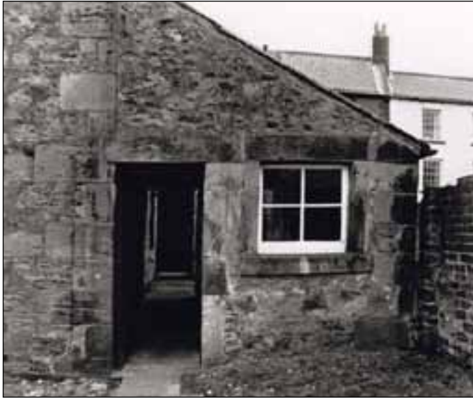
Figure 13. Photograph taken of the rear store prior to demolition.

the lean-to appears to have had a passageway running through it, and access into the lean-to must have been off of this passage. It is likely it was used for storage, perhaps of coal, but was removed in 1989 when, following subsidence damage, the cost of rebuilding proved to be prohibitive. 45