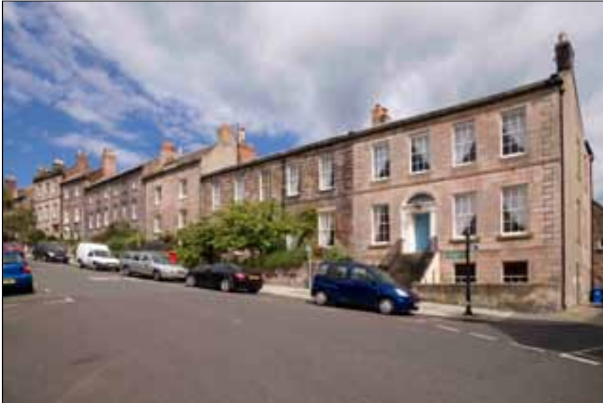
Figure 5. Early 19th-century housing in Lower Ravensdowne (Photograph: Bob Skingle 2008 DP065190 © English Heritage.

salubrious accommodation in the street at the time of Samuel Riddle's purchase of the land in Ravensdowne. The plot immediately south, then No. 78 but now demolished, was probably occupied by a type of court housing. The Ordnance Survey map of 1852 shows individual dwellings huddled around a small courtyard reached from Ravensdowne via a passageway (see Fig 1). The 1881 census records 6 families living here; their employment includes rope making, an omnibus driver and a grocer's porter. The largest family had eight children whilst another had five. They suggest a less fashionable aspect to upper Ravensdowne, close to the Military Hospital and barracks. No. 84 would have been built facing this court housing. 37