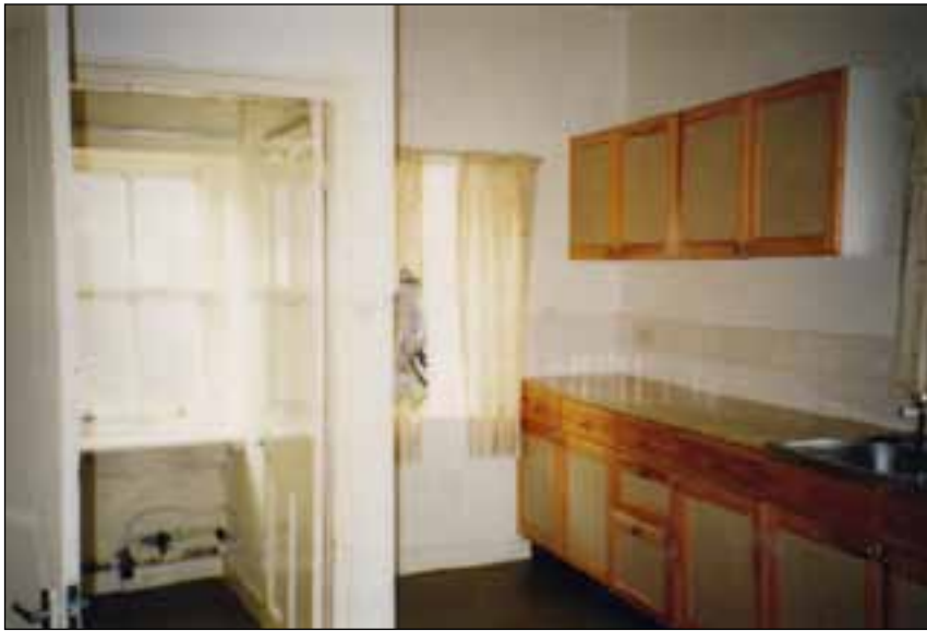
Figure 17. Present kitchen showing former larder, photo taken in 2002 (Photograph: English Heritage Estates Office © English Heritage).

The present kitchen, also a rhomboid in shape, is reached from the dining room. This was probably originally a large scullery and is now lit by four windows to the west, north and east. The back door, which would have led out into a small yard and outside store is located to the right (east). A boxed-in flue in the north-east corner of the room, which has a small single chimney externally, suggests a copper may have once occupied the corner: a fairly typical arrangement to provide heated water for washing food, utensils and clothes. We know from records that this room was once divided, 48 with a larder in the south-west corner, lit by a single window (Fig 17). This window has a recess beneath the sill which might suggest a blocked door to the street. However, there is no external evidence for this and it is more likely that the recess provided more storage space beneath the full-width stone sill which served as a shelf.