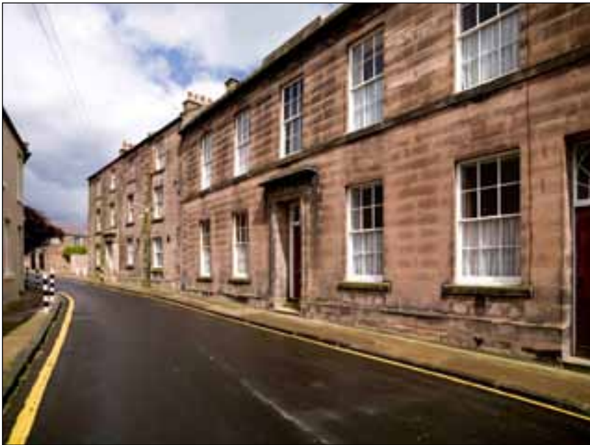
Figure 4. The point at which Ravensdowne narrows. Note, No. 84 is in the background, to the far left (Photograph: Bob Skingle 2008 DP065186 © English Heritage).

Ravensdowne, as has already been noted, is situated on the eastern side of Berwick-upon-Tweed within the town defences. It continues the line of Palace Street East northwards, rising steeply up to the junction of Woolmarket before ascending more gently northwards, terminating near Berwick Barracks on Parade. The gentle curve of the street reflects the line of the town wall to the east. Towards the northern end of Ravensdowne the roadway narrows and eventually veers sharply west, then continues north as it skirts around the barrack walls (Fig 4).