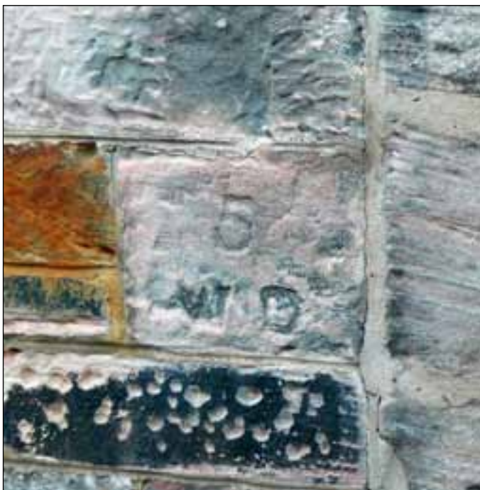
Figure 11. War Department boundary stone.

The western gable end of the house is flush with the edge of the street and is of roughly coursed stone rubble with ashlar quoins and an integral brick chimney stack, containing two flues, which breaks the ridge. The wall extends northwards as the side of the rear wing and the rear slope of the roof continue over the wing with a shallower pitch. The stonework has been repointed and repaired in a number of areas with cement, and is particularly heavily pointed towards the base of the wall, probably due to salt erosion of the soft sandstone. All window openings in this elevation are within the rear wing, two to the ground floor lighting the kitchen and one to the first floor rear bedroom. All have monolithic stone surrounds and interrupted jambs. The ground-floor windows share the central jamb but are of different sizes, as are their respective other jambs, sills and lintels, the latter bearing tool marks of contrasting character. The interrupted jambs on the first-floor window are of unequal height. Rubble-stone boundary walls butt against the western elevation to both north and south and there is a square stone in the northern wall which is inscribed with '5 WD' – an, increasing rare, War Department boundary stone, a type which can be found elsewhere on the town fortifications and the barracks and is indicative of ownership, referring in this case to the southern boundary of the barracks (Fig 11). 43