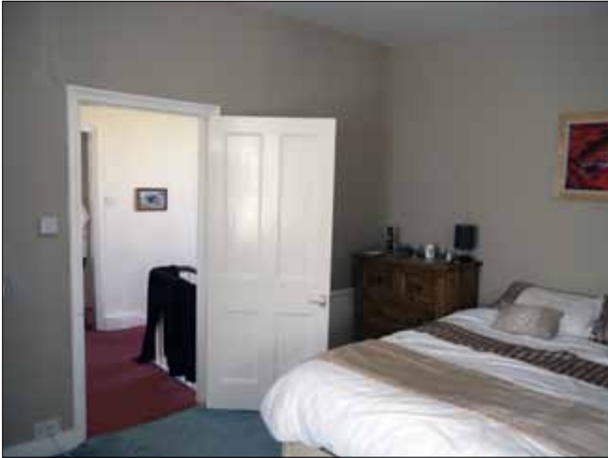
Figure 18. Main bedroom with a view through to the landing and stairs.