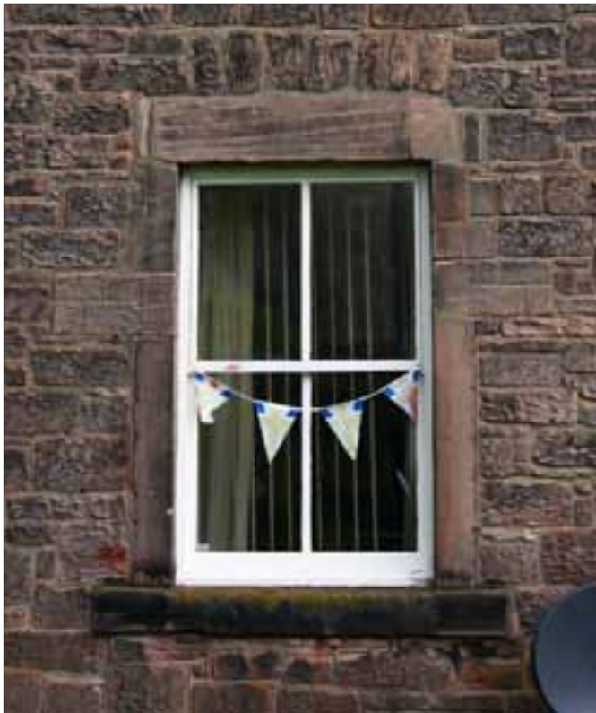
Figure 10. Window with interrupted jambs tooled to imitate coursed stone (Photograph: Simon Taylor 2012 © English Heritage).

The central door is flanked by sliding sash windows to the ground floor, with three similarly proportioned and evenly spaced windows to the first floor. All windows have stone sills and interrupted stone jambs, whilst there are stone relieving arches above the ground floor lintels. All the sashes and their boxes are recent replacements but are probably not dissimilar to the originals. Although the window openings appear superficially similar, none of the monolithic window jambs, lintels or sills are of equal length or width. This has been partially masked on the jambs and lintels by deliberate tooling, creating false edges on some stones, whilst others have been tooled to imitate coursed stone blocks (Fig 10). This gives the impression around each window of stone jambs and lintels of similar dimensions.