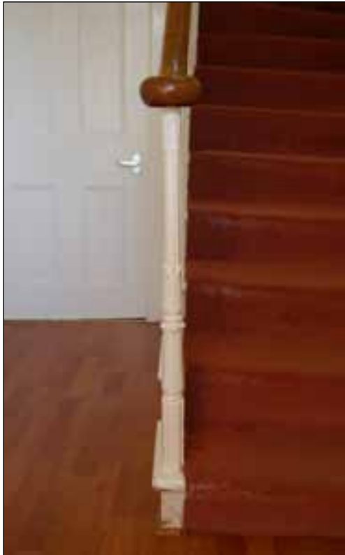
Figure 14. Newel post.

The original open-string dog-leg stairs has continuous winders, two simple square-section balusters per tread and a slender embellished newel post of cast iron which resembles the rising stem of a plant or flower. The newel is topped with a circular cap and joined to a handrail (Fig 14). Each tread end is carved to resemble a console-like bracket. The stairwell is lit by a north facing window.