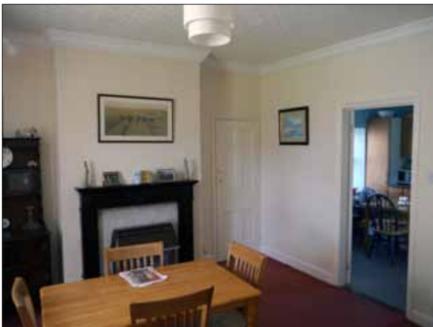
Figure 16. Present dining room, formerly the living kitchen, with view through to the present kitchen in the rear wing.

facing window with splayed reveals. The room is almost rhomboidal in shape, caused by the walls' alignments with Ravensdowne and the boundary of the old Ordnance House plot. The original fireplace has been replaced and ceiling decorations are modern. We do, however, know that the room once had a picture rail which was photographed in the later 20th century before it was removed. 47 The room does retain its original door, architrave and skirting which is finished with a simple roll top. It also has two built-in storage cupboards, with their original doors and locks. One cupboard with four panels is located to the right of the projecting chimney breast whilst the other cupboard is built into the south facing wall; its door has two panels and is crudely constructed to fit the opening.