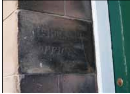
Figure 7. Signage in a doorway of 76 Ravensdowne (Photograph: Simon Taylor 2012 © English Heritage).