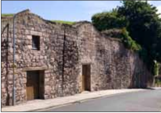
Figure 6. Ice houses on the east side of Ravensdowne.