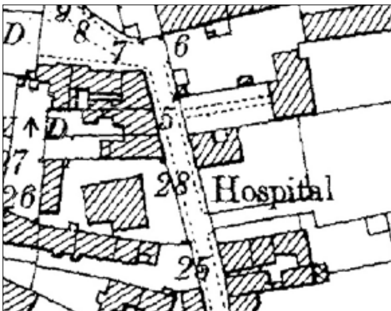
Figure 2. Ordnance Survey map of 1897 showing 84 Ravensdowne.

It appears that 84 Ravensdowne stands on ground which was once part of a larger tract of land sometimes referred to as 'Old Windmill Hill'. Two windmills are shown on Speed's plan of 1610, one is located on Windmill Bastion (lending its name to the defensive earthwork), whilst the other is positioned nearby. Another plan, of 1745, drawn