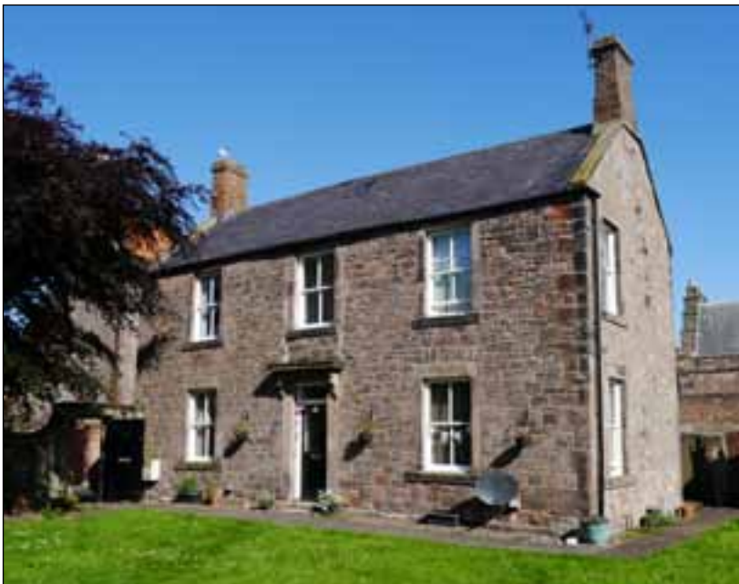
Figure 9. Front elevation (Photograph: Simon Taylor 2012 © English Heritage).

No. 84 Ravensdowne is two storeys high, with a symmetrical principle elevation of three bays (Fig 9). The main body of the house is one room deep. A two storeyed wing at the rear makes the whole 'L' shaped in plan. The house is built of solid stone walls, with roughly coursed rectangular blocks of the local pink-grey sandstone on an ashlar