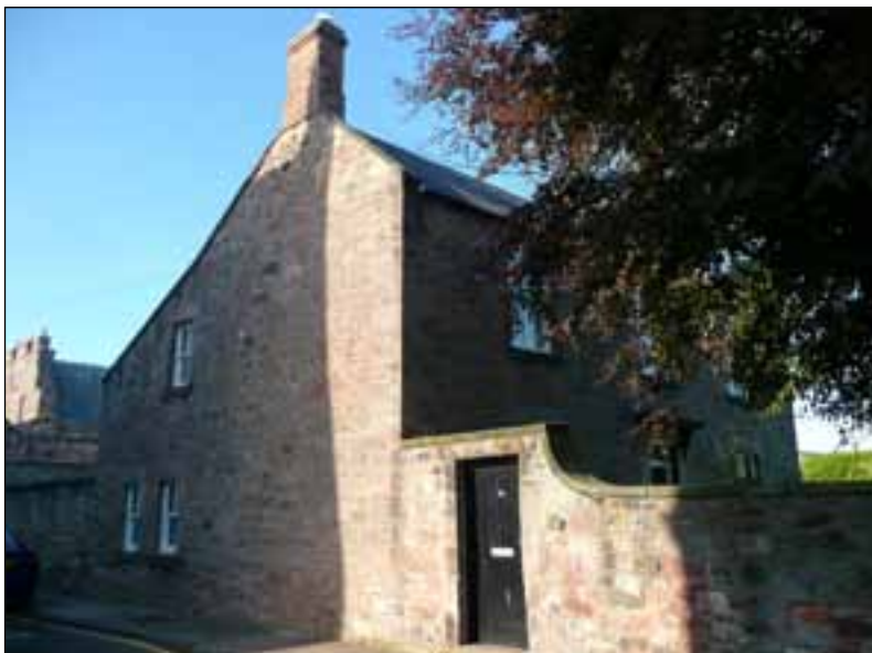
Figure 8. Western elevation of No. 84 aligned with the street.

It is a modest-sized detached villa and not unlike other small villas of this period. 39 In contrast to most of the houses which line Ravensdowne and face directly onto the street, No. 84 is set at right angles to it, taking advantage of a southerly aspect (Fig 8). The western gable end is flush with the edge of the street and a stone wall shields the rest of the plot and provides an element of privacy to the house and garden. Pedestrian access