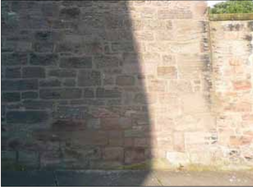
Figure 12. Possible ragged joint on the western elevation (Photograph: Kirsty Tuthill 2011 © English Heritage).

The eastern elevation is gabled and partially obscured by late cement smear pointing which appears to be ashlar scored. However, there are also traces of earlier lime render or wash on the unpainted stonework. There are single ground and first-floor window openings, with modern sliding sashes, to the left of an integral central brick chimney stack with two flues, which breaks the ridge. The windows are of similar size to those on the front elevation and there is a narrow relieving arch above the ground floor window. They also have monolithic stone surrounds with interrupted jambs which, like those in the front elevation, bear tooling which imitates stone coursing to mask the irregular lengths and widths of the stones used. The sill to the ground-floor window protrudes to the right, well beyond the base of the jamb which is not seated on the shoulder of the sill. This suggests a number of possibilities; either the window has been narrowed or the sill was not originally made for this opening. Given the consistency of window widths between first and ground floor and the lack of evidence for narrowing in the stonework, the latter seems more likely.