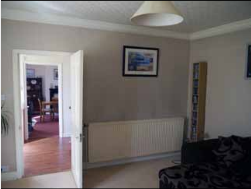
Figure 15. Present living room, formerly the parlour, with a view through to the hall and dining room.

facing window with splayed reveals. The room is almost rhomboidal in shape, caused by the walls' alignments with Ravensdowne and the boundary of the old Ordnance House plot. The original fireplace has been replaced and ceiling decorations are modern. We do, however, know that the room once had a picture rail which was photographed in the later 20th century before it was removed. 47 The room does retain its original door, architrave and skirting which is finished with a simple roll top. It also has two built-in storage cupboards, with their original doors and locks. One cupboard with four panels is located to the right of the projecting chimney breast whilst the other cupboard is built into the south facing wall; its door has two panels and is crudely constructed to fit the opening.