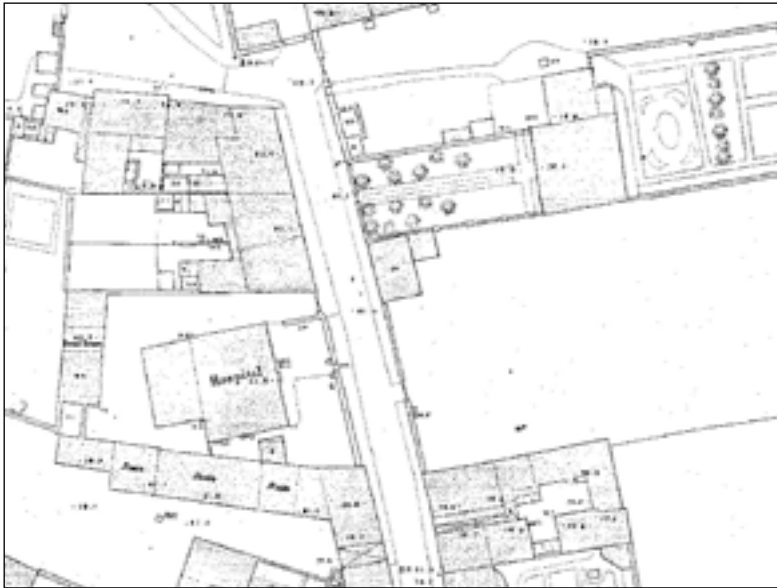
Figure 1. Ordnance Survey map of 1852 showing an L-shaped building on a large plot now occupied by 84 Ravensdowne.

the road by a wall with gated access to the south. A pump and water trough are also shown within the plot.