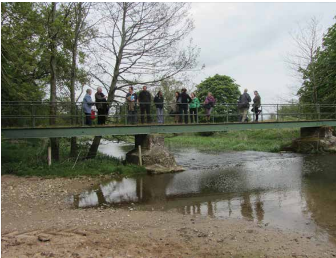
UEA 'Lancelot 'Capability' Brown – A Research Agenda for the Future' workshop delegates at Kimberley Hall 10 May 2013