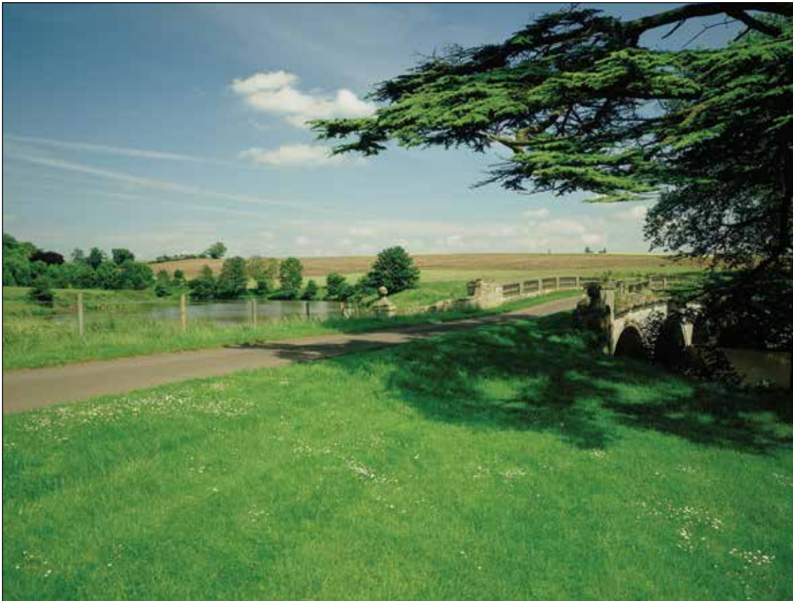
Compton Verney

Although there are thus differences of opinion concerning precise forms of management, there is no doubt that parks, while being primarily aesthetic landscapes, also had important economic functions, and constituted part of the wider economy of the landed estate: and it is important to know how far their form and structure may have been modified by such practical roles. In a wider sense, moreover, the nature of the relationship between designed landscapes and the wider productive countryside would repay further investigation. Many landowners undoubtedly wanted their parks to appear distinct and different from the surrounding countryside, but it does not necessarily follow that they found all aspects of the wider rural environment aesthetically unappealing.