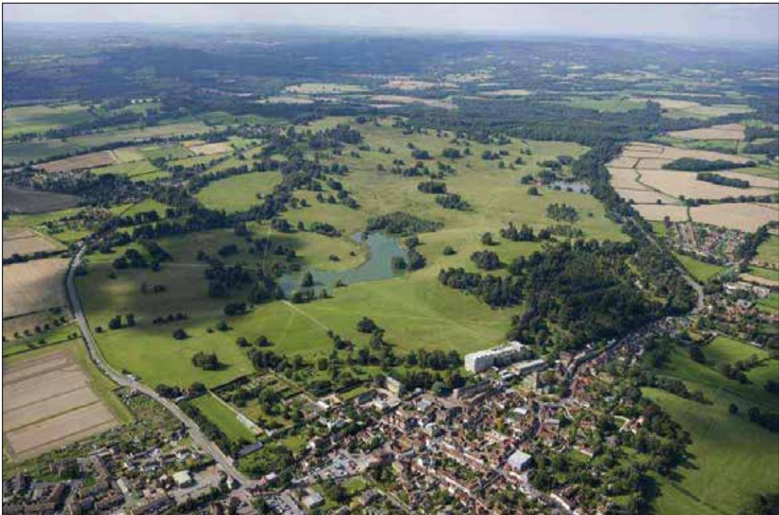
A view of Petworth Park. Image reference number 24703_027

If elements of Brown's parks were thus perhaps rather more like gardens, and less like traditional deer parks or the wider countryside, than we often assume, the extent to which he 'swept away' existing geometric landscapes also requires further examination.