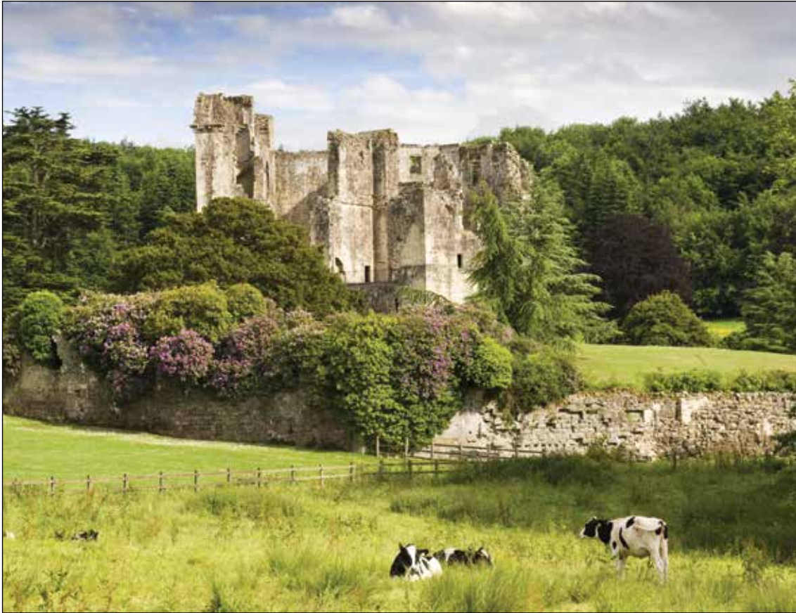
Old Wardour Castle in its Capability Brown landscape setting. Image reference N090397 © English Heritage Photo Library

radically different in appearance to the landscape of the park. Instead of wide, multi-species hedges with abundant timber and pollards, they thus featured large straight sided fields defined by flimsy species-poor hawthorn hedges, often sparsely-timbered, straight roads and newly-built isolated farms. It is perhaps noteworthy that Brown's career coincided with the first 'wave' of parliamentary enclosure, between 1750 and 1780. In the 1740s just 39 parliamentary enclosure acts were passed, increasing to 117 in the 1750s, 393 in the 1760s and peaking at 640 in the 1770s. The following decade saw a more modest total of 237 acts, though this represented merely an interlude before the second and more dramatic wave of acts in the decades either side of 1800. 116 The first wave of enclosure was dominated by acts dealing primarily with open fields, and as such was particularly focused on the Midland counties where such landscapes were most extensive. This was also one of the main centres of Brown's activities.