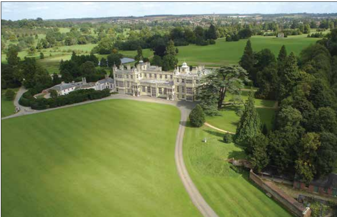
An aerial view of Audley End. Image reference number N071723

These suggestions have been given a further twist by the growing acceptance, on the part of many landscape historians and archaeologists, that large-scale landscape design had, in fact, been invented in the Middle Ages, and that deer parks had often formed key elements of extensive and elaborate ornamental landscapes laid out around elite residences. In Michael Leslie's words, 'There was indeed a medieval landscape art ... involving the modelling of substantial tracts of land, large-scale earthworks, water features and garden architecture with the aim of pleasing the eye ... fundamental to their effect is the motion of the visitor or viewer'. 97 These designs featured large bodies of open water, parkland turf scattered with trees, and – allegedly – circuitous approaches and drives, all first clearly described by Wilson-North, Everson and Taylor at Bodiam Castle (Sussex) and since identified at numerous locations. 98 The similarities between such early