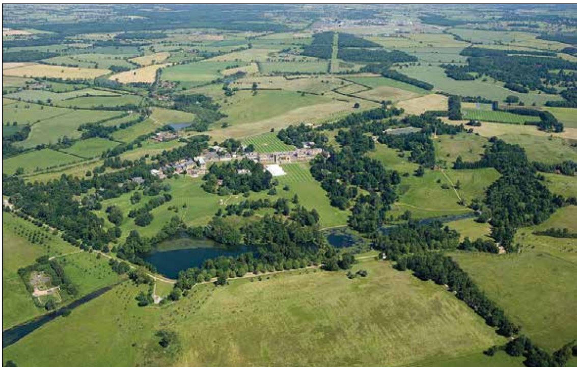
Aerial view of the Stowe landscape. Image reference number 26048_010

Unfortunately for so neat and attractive an argument, research into the chronology of enclosure over the last three decades or so has made such a direct connection harder to sustain. By the middle of the eighteenth century more than two thirds of England already lay in enclosures, and even in the Midland counties, where open landscapes persisted longest, the heartlands of the larger estates had usually been enclosed. 115 Yet we should perhaps be cautious in rejecting completely a connection between enclosure and the emergence of the Brownian park. The new method of enclosure by parliamentary act which developed in the eighteenth century created landscapes more regimented and geometric than most of those established by earlier forms, and ones perhaps more