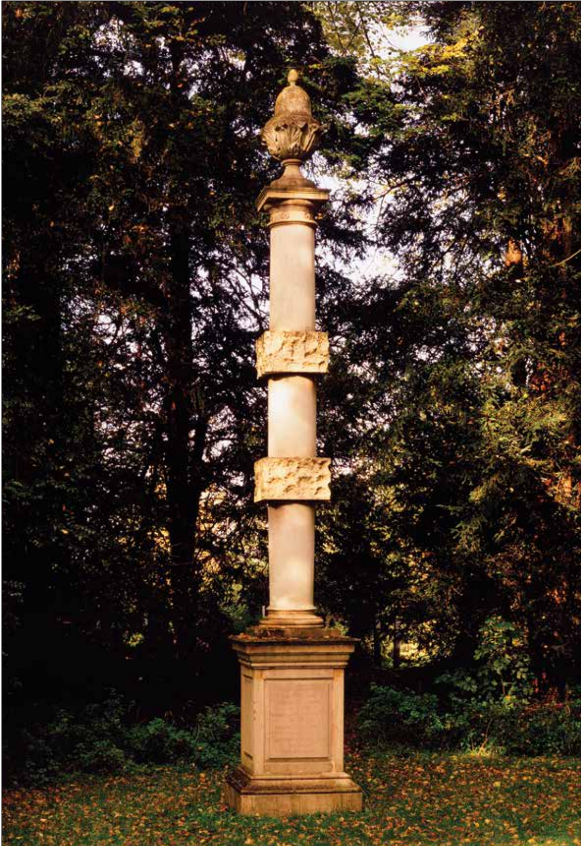
The Capability Brown Column at Wrest Park. Image reference number N080242