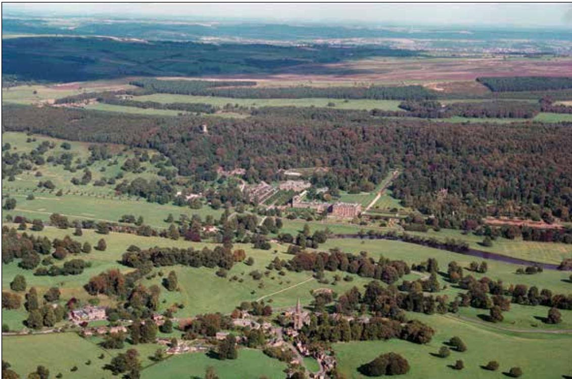
Aerial view of the park at Chatsworth Image reference number NMR_23218.03