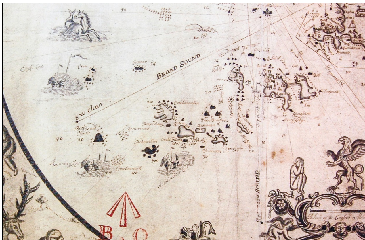
Fig 2 Detail from Edmund Gostelo's c 1708 chart (The National Archives MPH1/368).

2.2.6 Rex Cowan reports five different artefacts which were marked with the owner's initials (Licensee Report 1977). Of these, three have been correlated with the initials of crew members of the Eagle , including the captain's initials on a silver spoon (2.1.8 above).