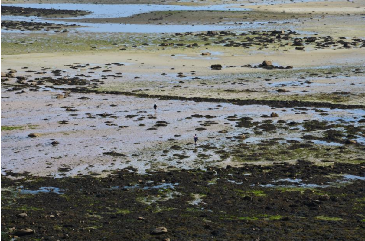
Samson Flats submerged prehistoric field system, Isles of Scilly, UK.