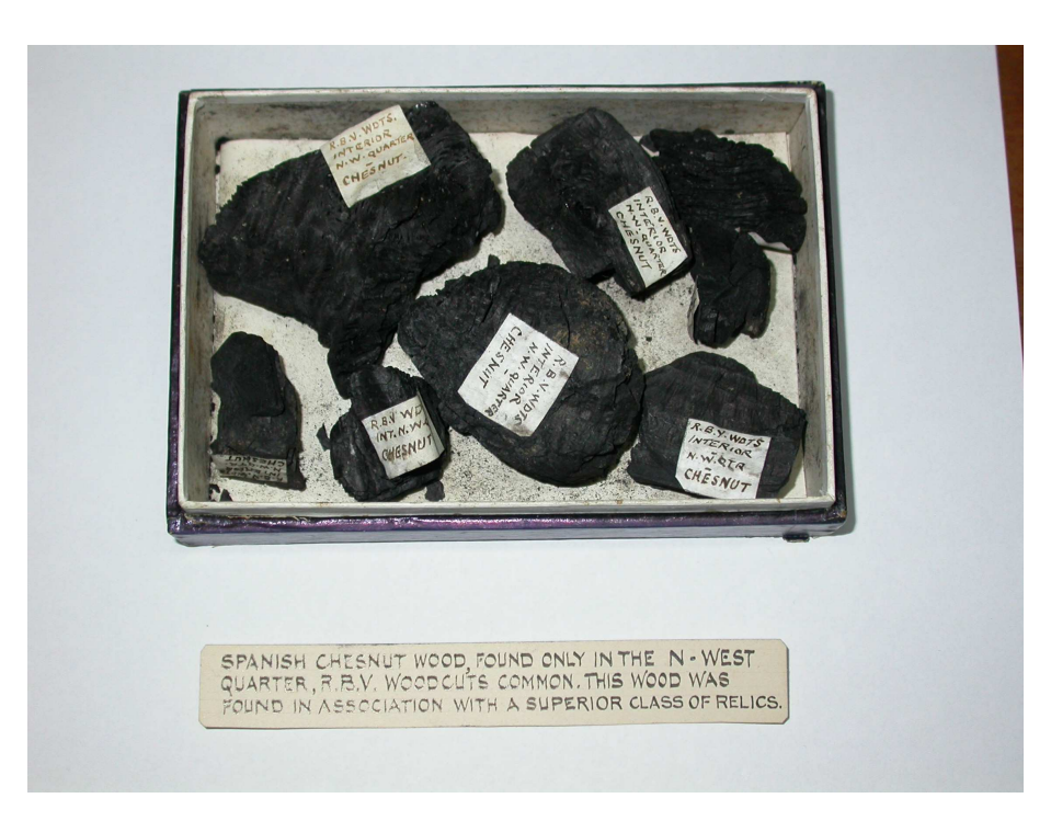
Figure 2. Additional taxa recovered from Woodcutts Common (SBYWM:S.WCT9.1, SBYWM:S.WCT9.2, SBYWM:S.WCT9.3). Image: Z Hazell (Historic England) reproduced with kind permission of The Salisbury Museum.

Figure 1. The eight "chesnut" fragments recovered from Woodcutts Common (SBYWM:S.WCT9.4). Image: Z Hazell (Historic England) reproduced with kind permission of The Salisbury Museum.