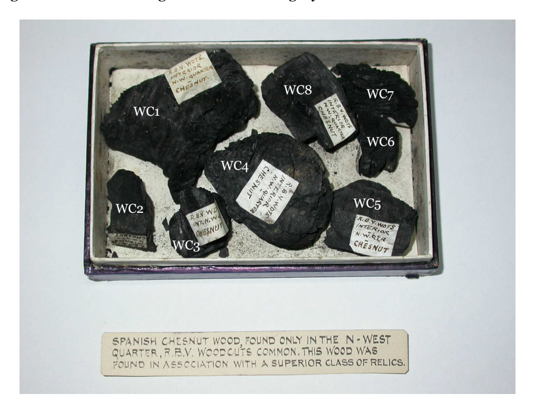
Figure A1. Image showing the fragment numbers as allocated to the eight fragments within the original 'chesnut' category.