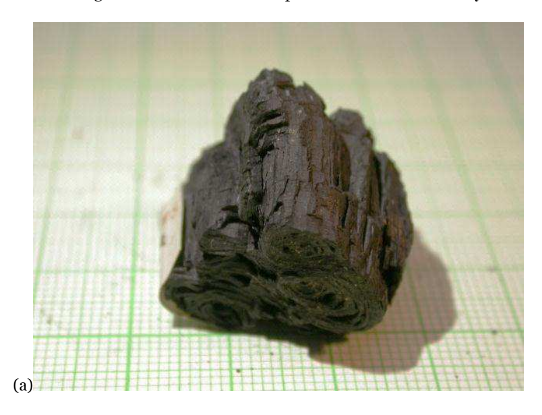
Figure 3. Low magnification images of some of the 'chesnut' fragments (revised to oak) from Woodcutts Common, showing: (a) Fragment WC3, showing knotwood on the TS (facing), (b) Fragment WC5 with its uneven growth within growth rings, and with wide rings (up to c 5mm (ie fast growth) in places, and (c) Fragment WC7 with multiple radial cracks – the ring porous growth rings are just visible running (vertically) across the fragment. Photos: Z. Hazell © Historic England. Produced with kind permission of The Salisbury Museum.

Figures 3 and 4 show images of some of the 'chesnut' [oak] charcoal fragments, illustrating a range of unusual growth patterns (twisted knotwood, fast and uneven growth rates within growth rings) and characteristics (radial cracks, vitrification) that were observed, and which might help explain the original (mis)identifications.