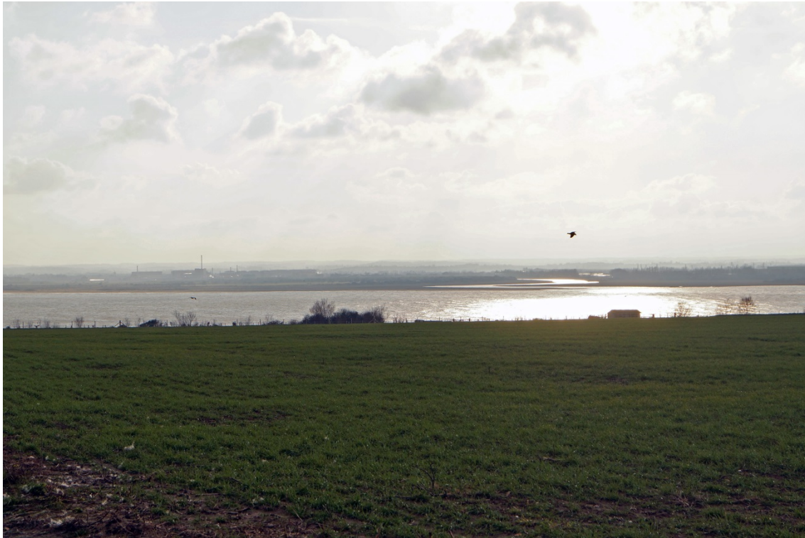
Figure 2 View from Chalk Hill towards Pegwell Bay

coherent project, the presence of diverse material remains in the ditches, and only limited evidence of structures or features within the enclosure. This all fits the idea of a mainly pastoral society (though cereals were also cultivated) in which people did not usually construct permanent dwellings but moved with their livestock – primarily cattle – and gathered periodically at enclosures and other places for exchanges and ceremonies, these gatherings often involving feasting, followed by deliberate deposition of the residues.