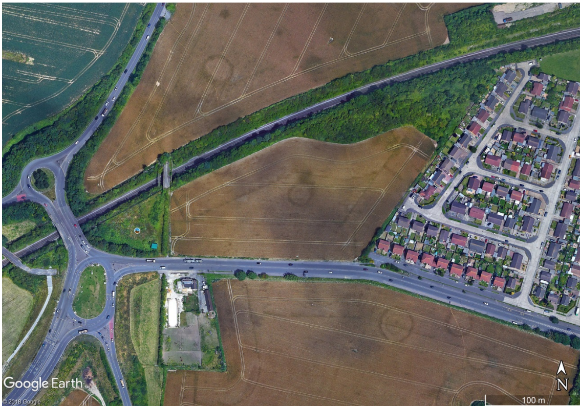
Figure 3 Google Earth image of ring-ditches and roundabouts at Lord of the Manor

barrows lie along an escarpment to the east of a broad shallow valley known as Hollins Bottom, which runs south-east for about two kilometres and is cut by the cliffs of Pegwell Bay, although prior to the erosion of the last 4000 years the valley floor probably descended to the beach. It may be that these barrows and ring-ditches form the eastern end of a more or less continuous distribution stretching for around 7km along the southern edge of Thanet – since the gap in the present-day distribution may simply reflect the presence of Manston airfield, which could have obscured sites in this area.