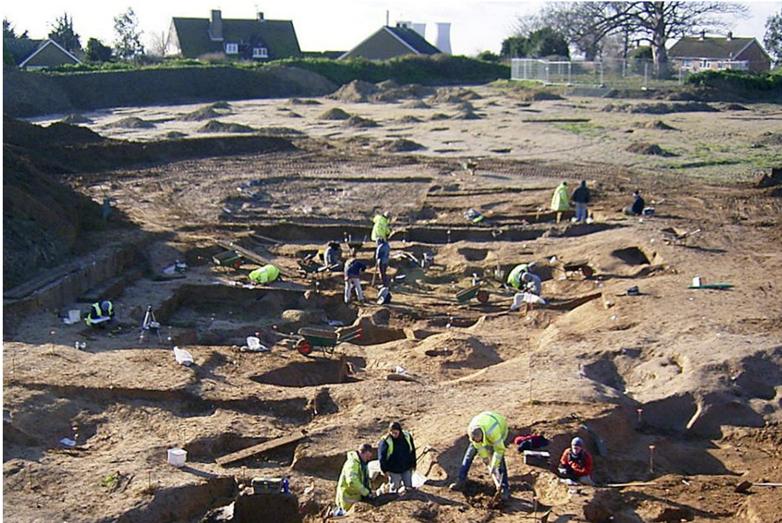
Figure 4 Digging in the suburbs: excavations in progress at Cliffs End Farm, Ramsgate

Along with the evidence for violence, the other remarkable feature of this group of people is that many of them were foreign to the Thanet area, and indeed to the British Isles. Analysis of chemical isotopes in their bones provides evidence of the kind of environment in which they grew up. From this it was determined that 14 of the people interred at Cliffs End Farm were migrants – some probably from Scandinavia and others from a warm area south of Britain, perhaps Iberia (McKinley et al 2014, 143–4).