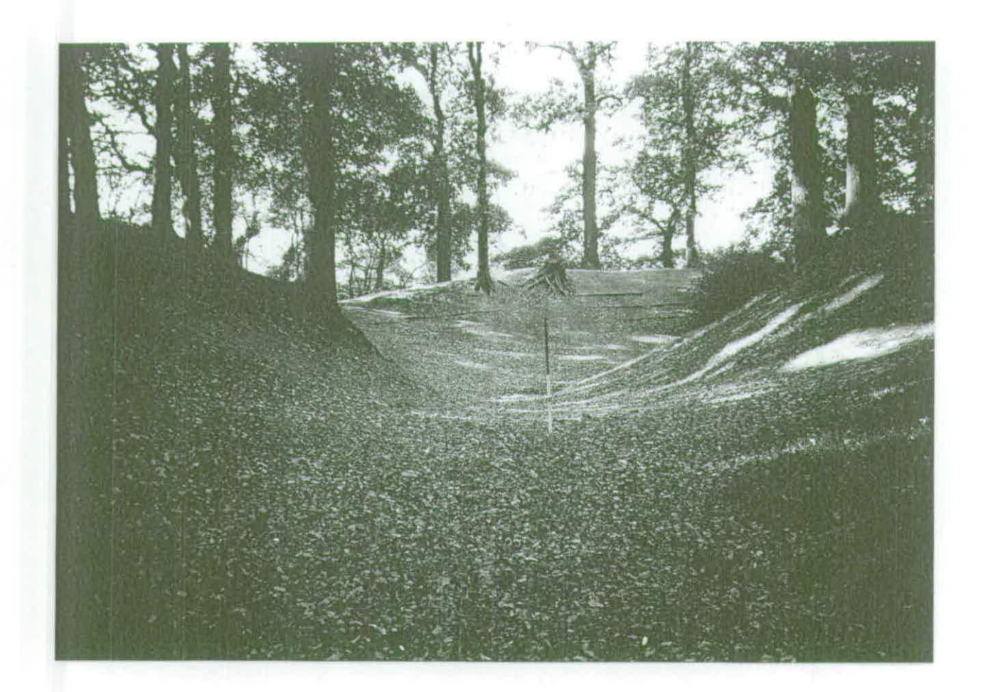
Fig. 1. The ditch at the north-west corner of Hobs Moat. Wood used in consolidation work can be seen on the far bank.