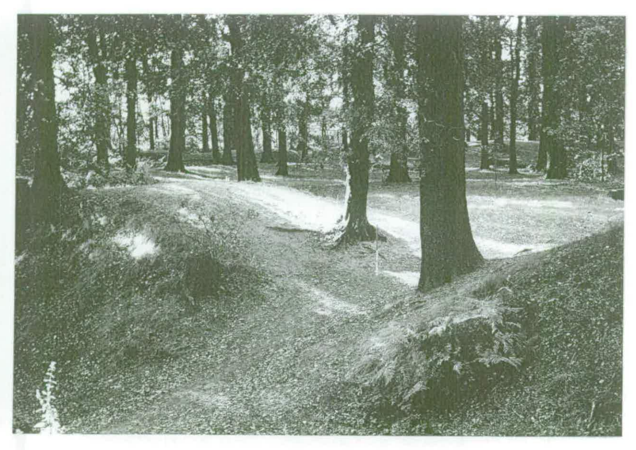
Fig. 2. The possible entrance on the inner bank of the moat island on the east side.