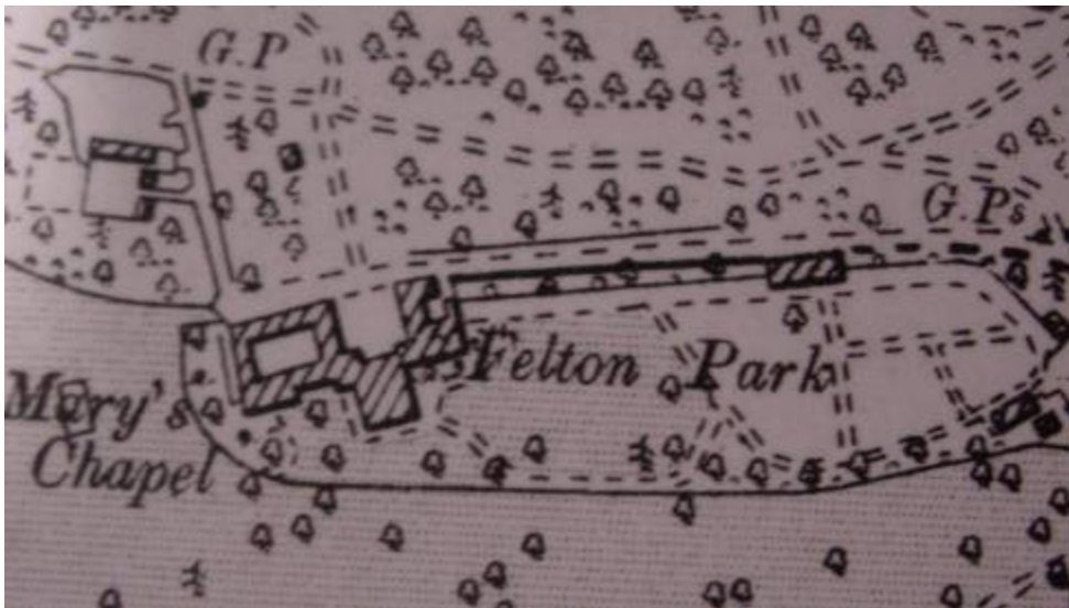
Extract from O.S. 2nd Edition 1:10560 map, revised 1896. The layout of pleasure grounds and productive garden remain largely unaltered.

Tomlinson describes the house as being: situated on gently rising ground in the park, amid very beautiful and extensive grounds. The garden: contains a fine collection of plants from Japan, remarkable for the peculiar and striking beauty of the leaves.