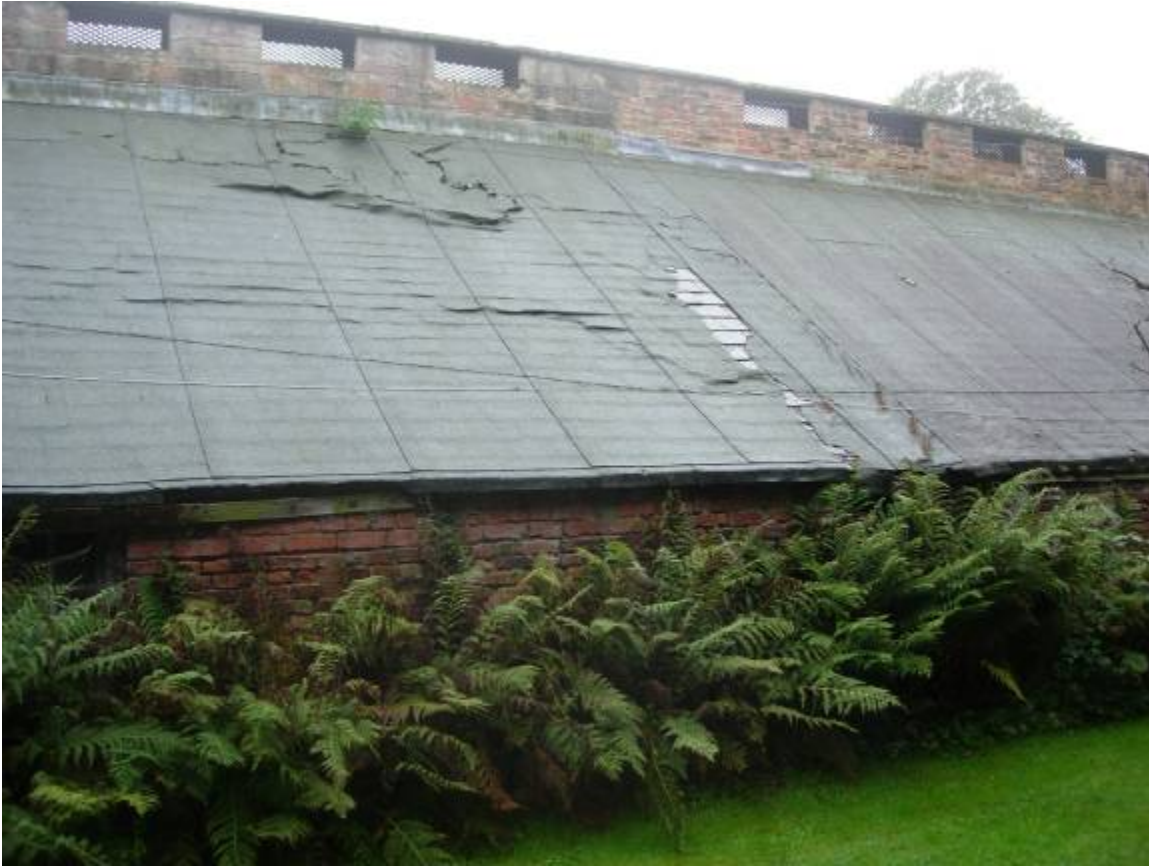
Does the change of materials at the wall head from stone (eastern half) to brick (western) reflect phasing in construction? [N. face]. Slippage of the potting shed roof caused by failed truss. 2013