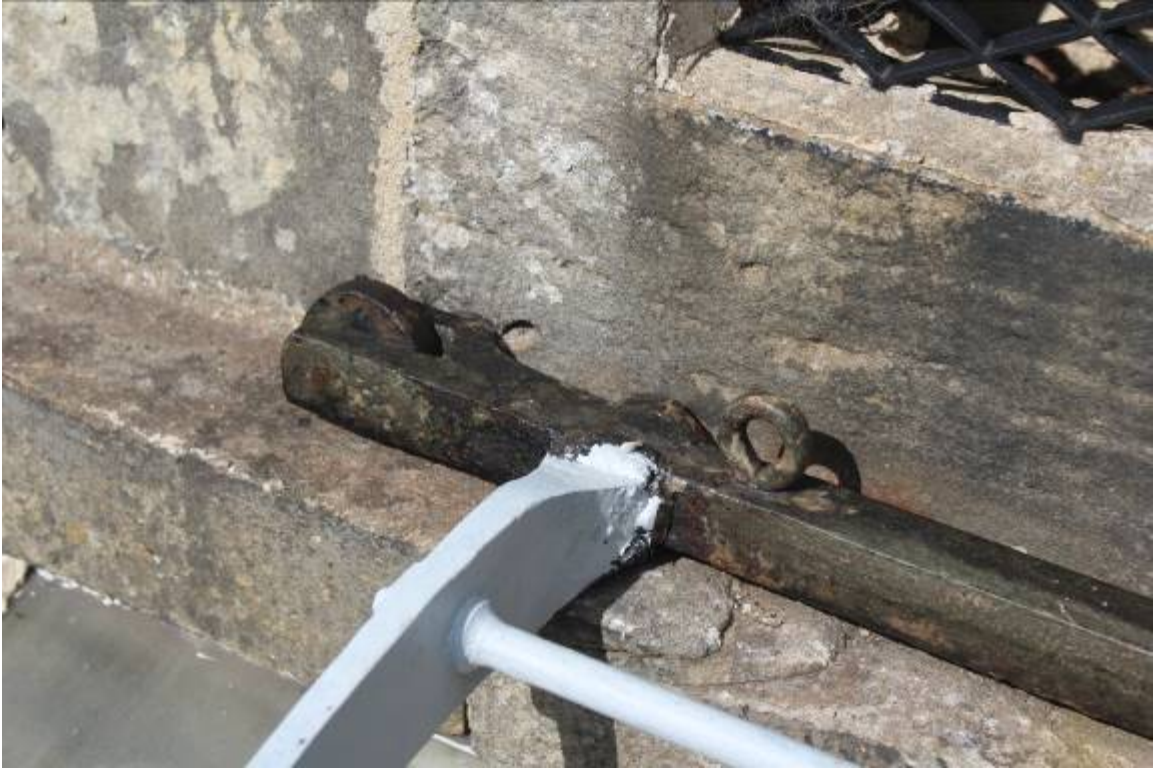
The western wheel at the top of the moveable ladder. The eye may have been used to tie a rope used to assist in moving the ladder