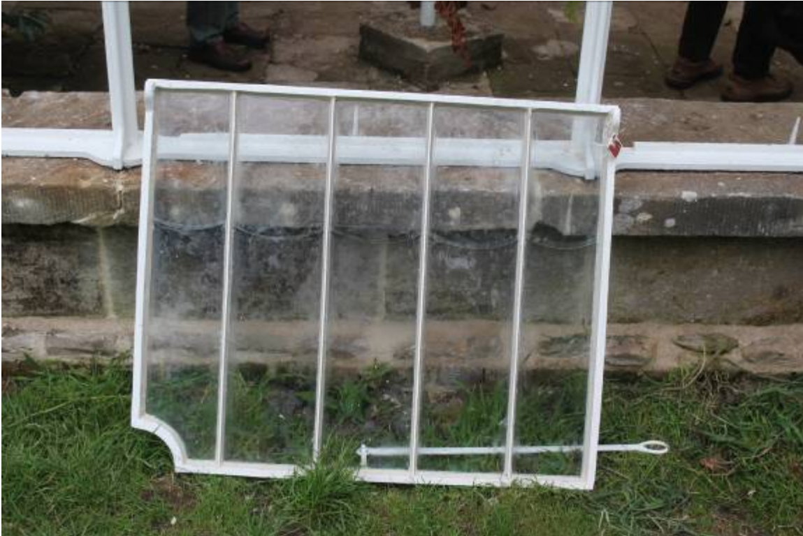
Restored casement from eastern division showing stay to control degree of opening (locating pin on sill behind) and rebate for vine stem to pass into the house from an external vine border

these corners, fastened by screw nuts, to keep the stems of the vines in their places.