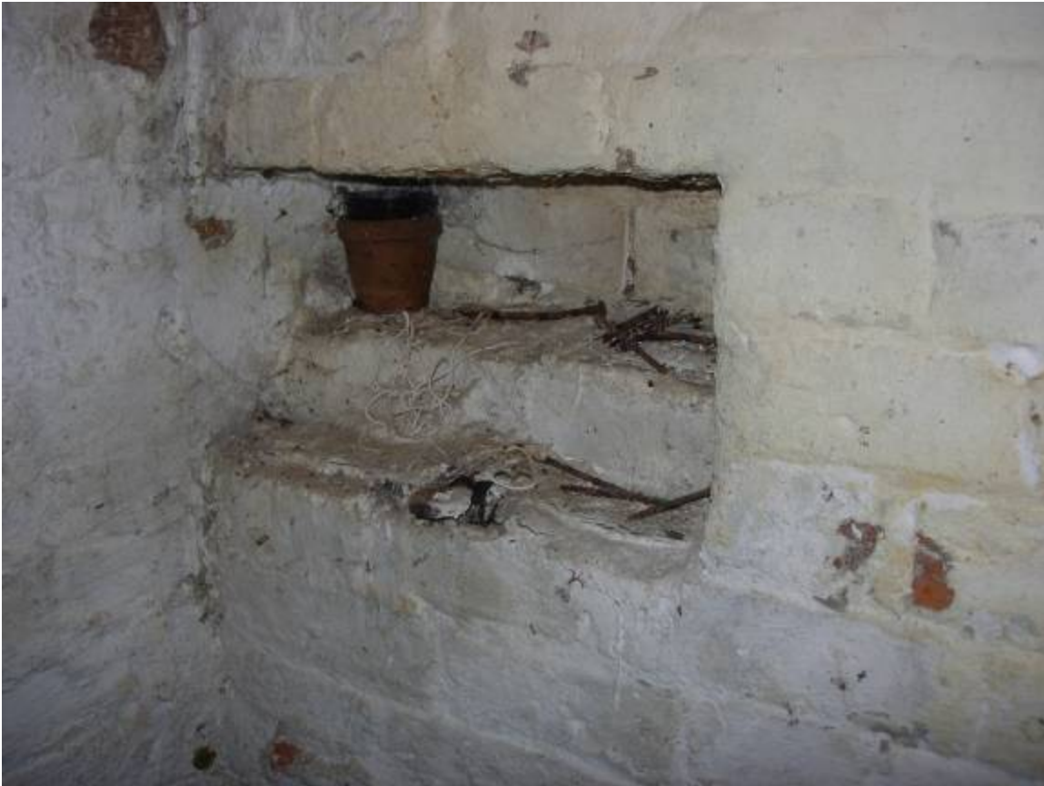
Odd blocking or rebate in dividing wall at E. end of potting shed range. Remnants of embedded metalwork. 2013