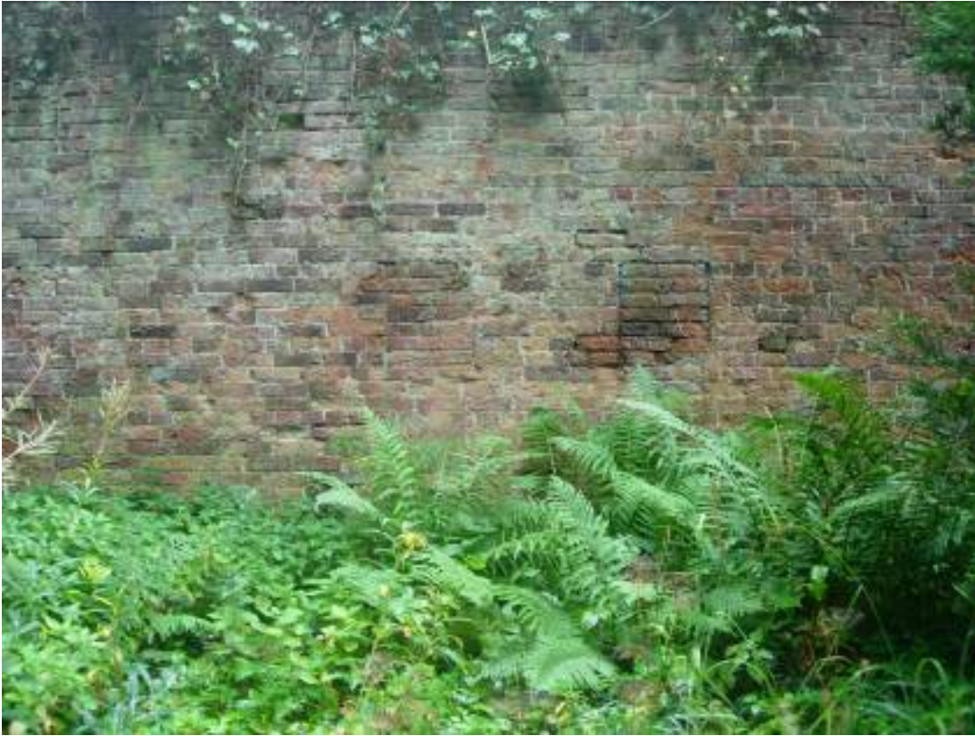
A number of paired openings can be seen on the north side of the garden wall, indicating removable brickwork to allow access for cleaning the flues of the hot wall