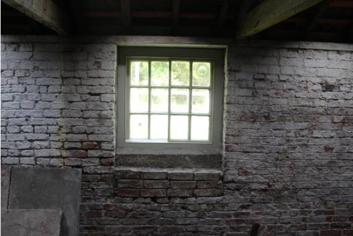
Potting shed window in the western part of the range with Crown glass bullions in the Yorkshire sashes. Note the additional three courses of deeper bricks below the window and at the wall head indicating modification of the opening.

Robin Dower observed that in 2002 they took down the section of flued hot-wall between the glasshouse and the wide gate into the garden to the west because it was leaning and on the point of collapse. The dismantling showed that the west gable of the potting shed was built against the leaning wall but that to make a satisfactory vertical face for the Glasshouse to abut and to support the higher parapet the wall appears to have been rebuilt properly plumbed up. The new wall that was rebuilt was also plumb so the planes of the two re-buildings more or less converged. At the other end (East) there doesn't appear to have been any misalignment and the buildings do look as though they were set up against the undisturbed brickwork of the original garden wall.