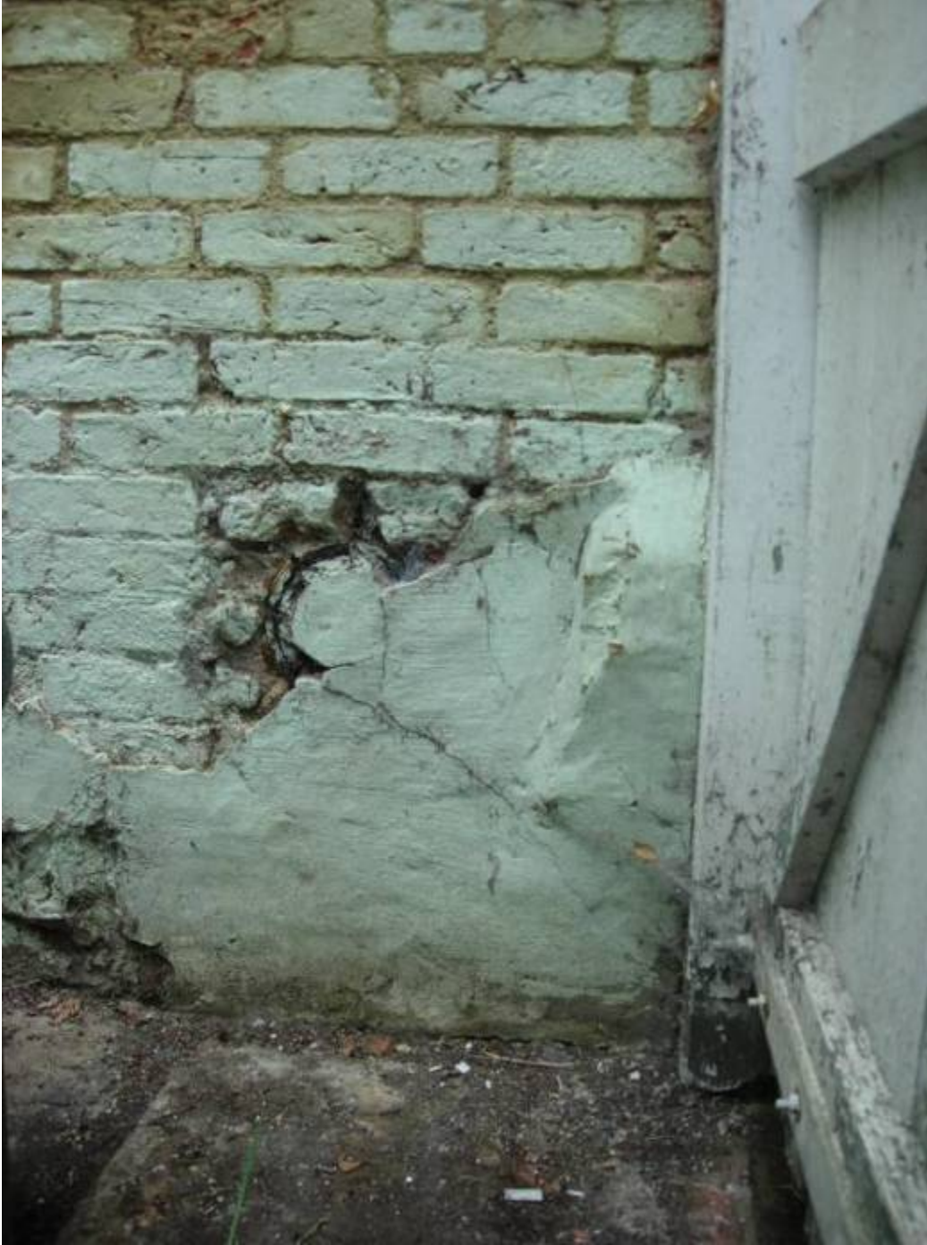
Stub of cast iron heating pipe at the east end of the range. Removal of render here would perhaps reveal another pipe below (providing flow and return) both perhaps set into an earlier flue opening (c.f. above photo of west end)