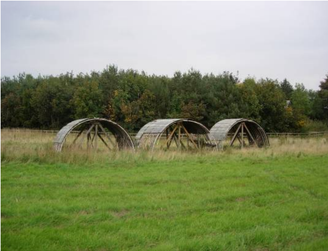
The three segments, still in their transport cradles

http://www.shorehambysea.com/the-vinery.html