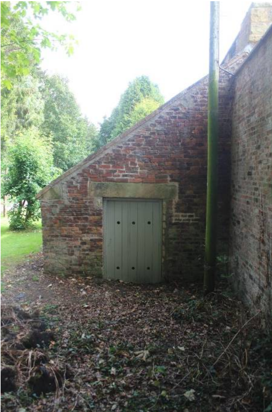
The west end gable brickwork suggests a rebuild of the upper courses, perhaps to accommodate the lifted roof of the potting shed

The potting shed windows, which have “Yorkshire” horizontal sliding sashes, are not the original configuration, the window openings having been raised by some three brick courses at some point in the life of the range. The bricks are deeper than the original bricks in the potting shed wall indicating a substantial later modification to the original range. Both gables hint at modification and it may be that an existing shed range, pitched to the old garden wall head, was lifted to fit the elevated wall when the curvilinear range was built.