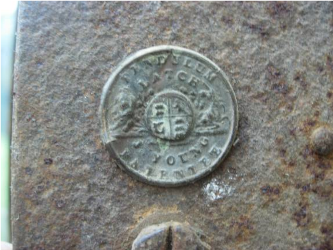
J.Young maker's plate on one of the lock boxes at Felton

The manufacturer and the builder of the lean-to curvilinear range at Felton are unknown. Apart from finding a definitive match for the unusual longitudinal form of the glazing bars or other components such as the top hung front sashes with their distinctive rebates or the movable ladder - which has not proved possible to date – the only potential clue to its region of manufacture seems to be the lock boxes on the two surviving iron doors.