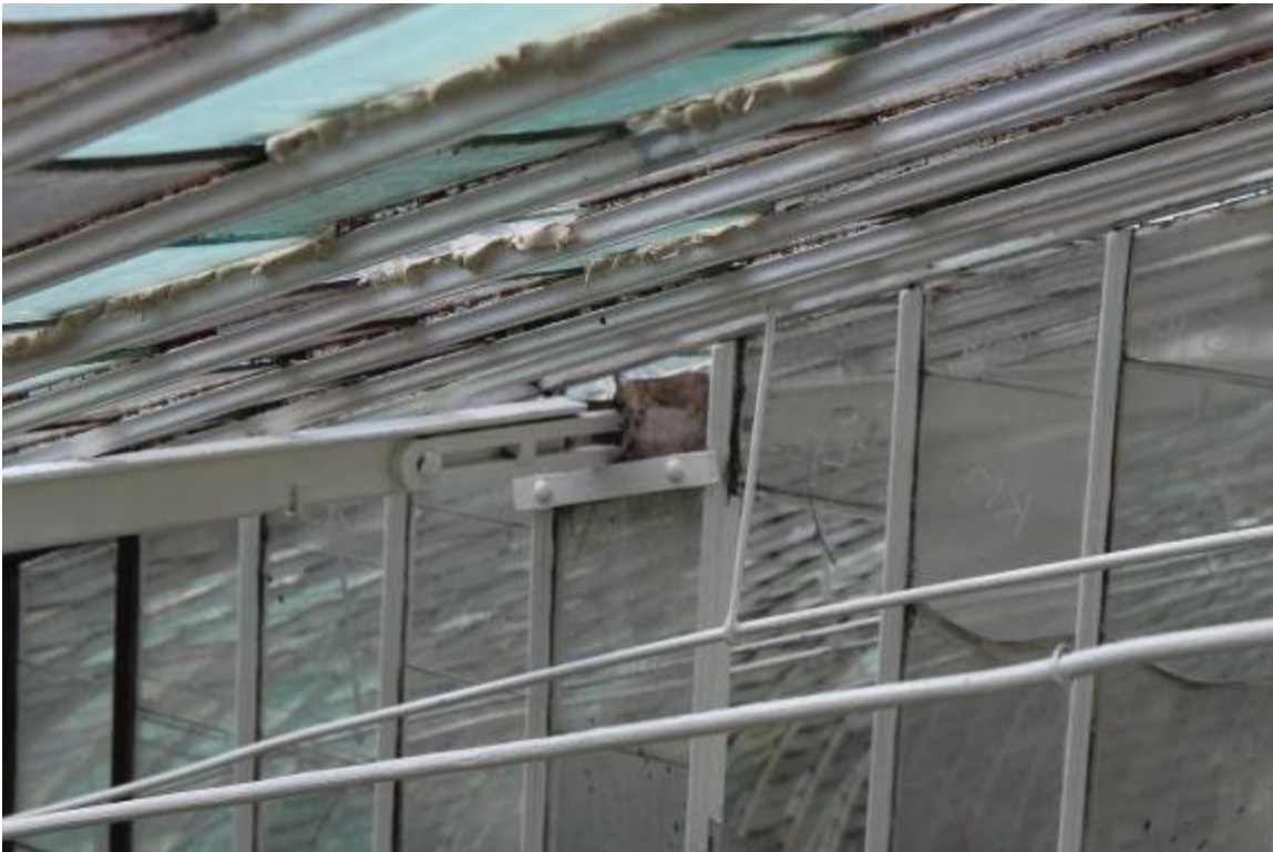
The support purlin passing through the internal partition. The join here may have been designed to accommodate thermal movement of the purlin. Sept 2015

Additional clips to secure the wrought iron glazing bars were attached to the support purlin at intervals as part of the repair work in 2015.