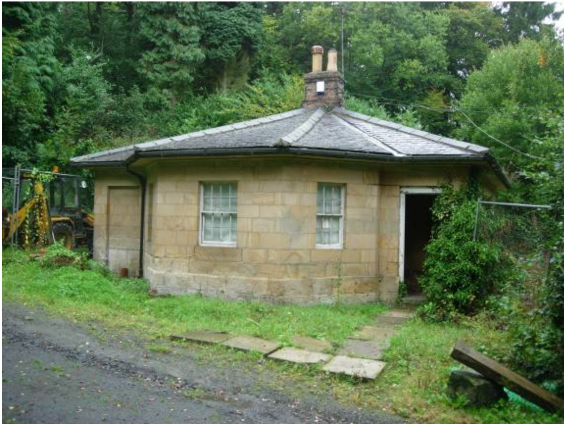
The lodge, on the approach from Felton village, in 2013.

The closing decade of the eighteenth century saw an improved approach to the house from Felton. A stone bridge, with ornamental ironwork, led past a new lodge [the list description gives a date for the building as: c.1800] and gave access to a more gently graded drive.