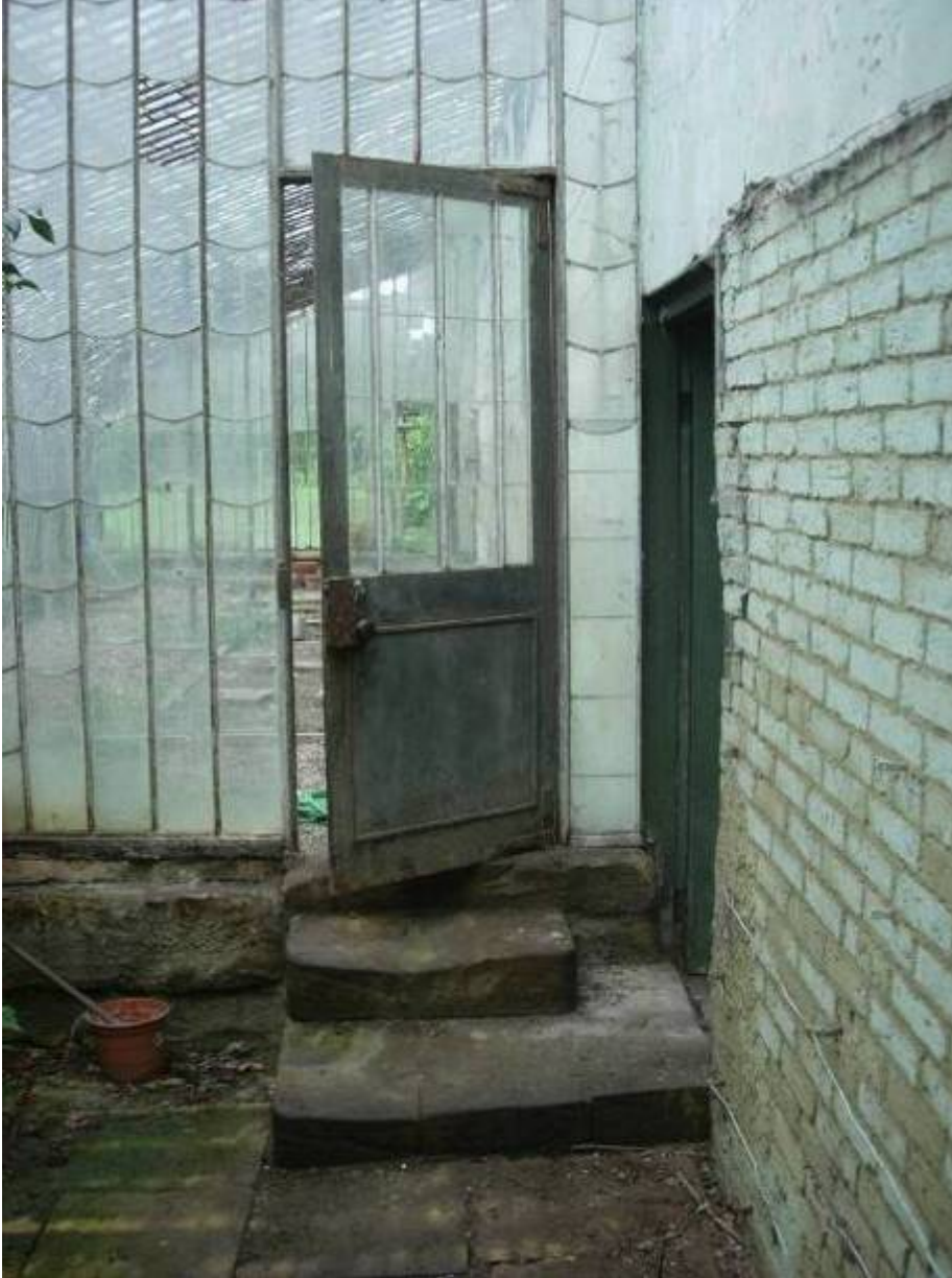
The well worn steps at the central partition suggest a long period of use. The heavy iron partition door is harr-hung, turning on pintles top and bottom. 2013