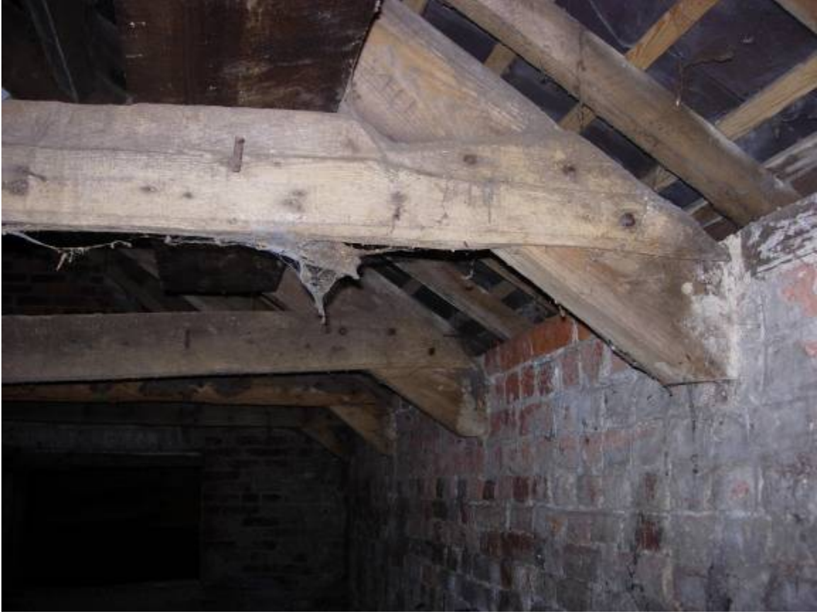
Earlier truss form showing assembly numbering in eastern part of potting shed range. 2013