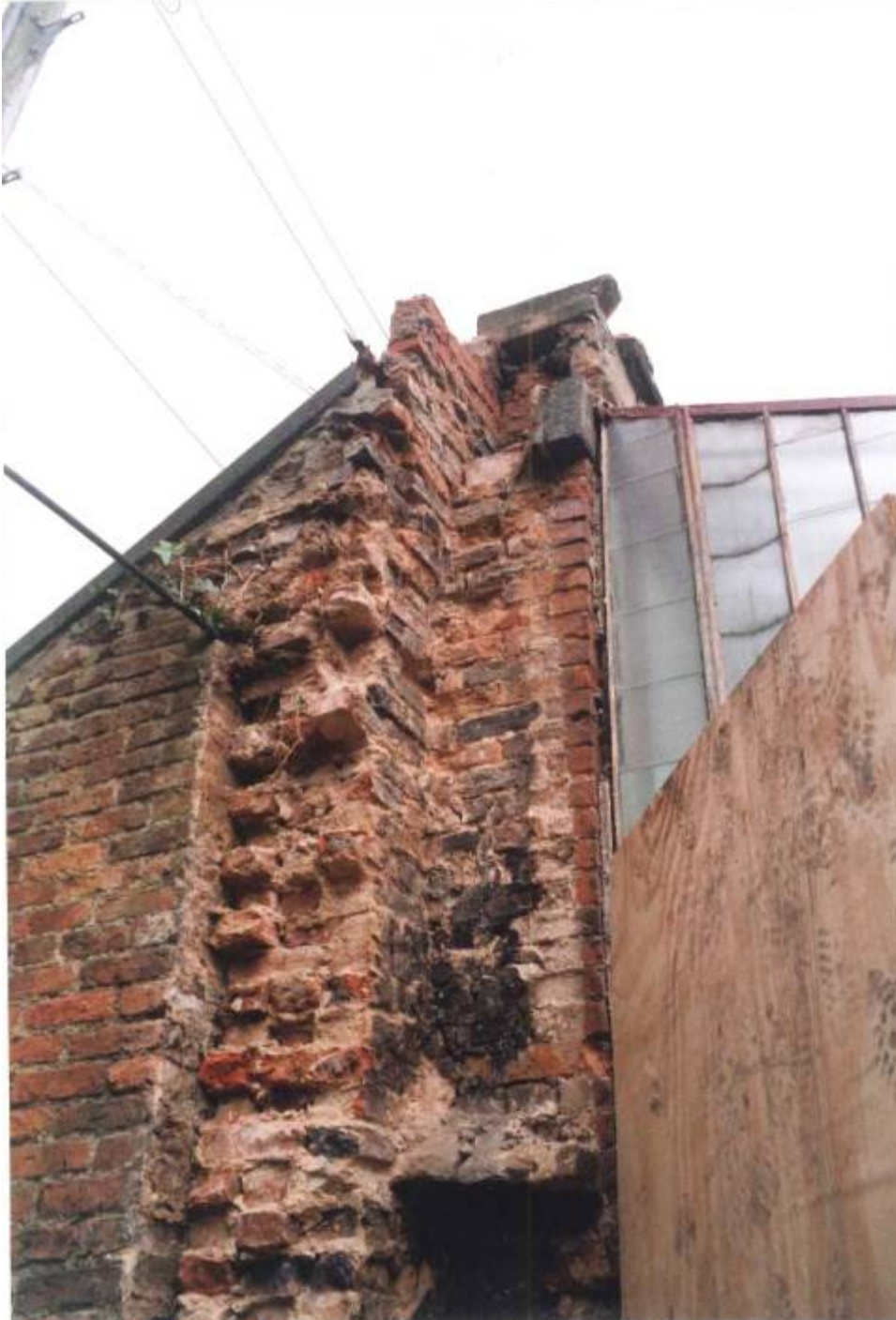
Detail at the wall head showing the western potting shed gable apparently built against the earlier garden wall rather than bonded with it, but oversailing the earlier wall towards the wall head. The flue appears to terminate in a chimney at the wall head.