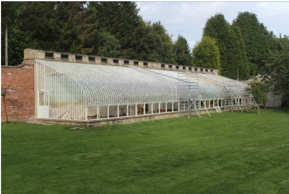
The glasshouse range undergoing repairs. Looking NE. September 2015

An evaluation of the local context, possible date and manufacturer, and rarity of the structure for Historic England – a revision of the 2013 report reflecting further research and investigation during the 2015 repairs.