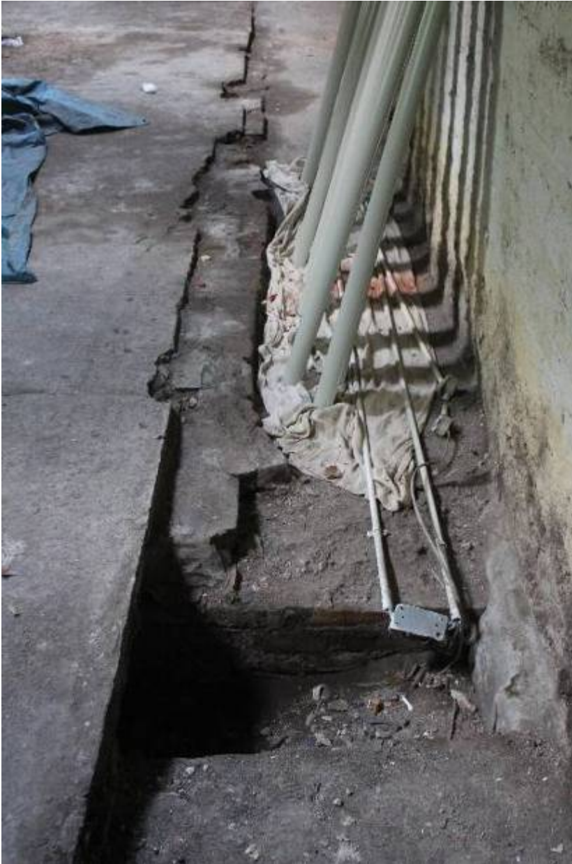
Curving brickwork hints at a heating flue run in the floor of the potting shed towards the western end. 2015. It would be useful to see more of the area at present covered by a concrete floor

As already observed there remains considerable archaeological potential at the site to determine the original layout of the interior and the original heating arrangements.