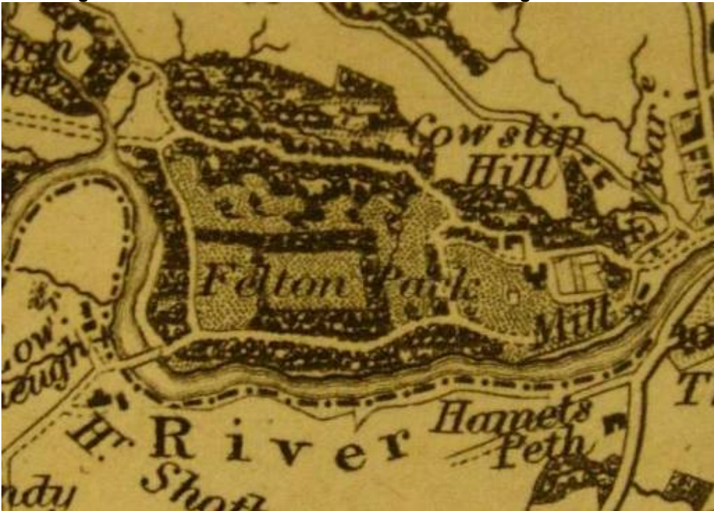
Extract from Greenwood and Co.'s Map of Northumberland, published 1828, showing the extent of the parkland; the rectilinear form of the old garden and the drive approaching from Felton village and the Great North Road to the east.