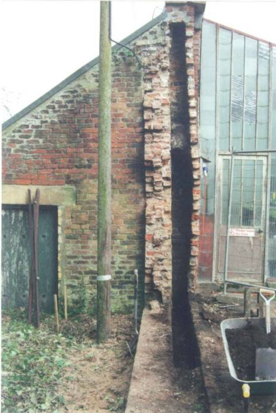
The garden wall to the west of the glasshouse was heated by internal flues, seen in section when the wall was dismantled for repair in 2002. The offset to accommodate the glasshouse can be seen at the wall head.