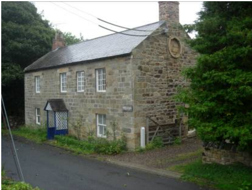
Garden House in 2013