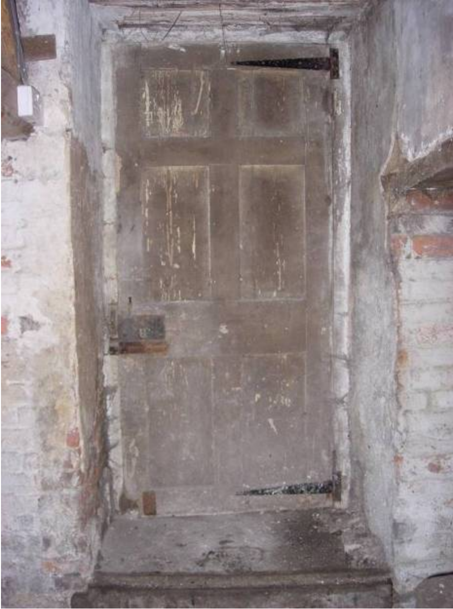
Six panel door between the potting shed and glasshouse. Clearly re-hung but is it the original and if so does the style help with dating? Twin keyholes and the shadow of another lock box suggests replacement. Shed (N.) side. 2013