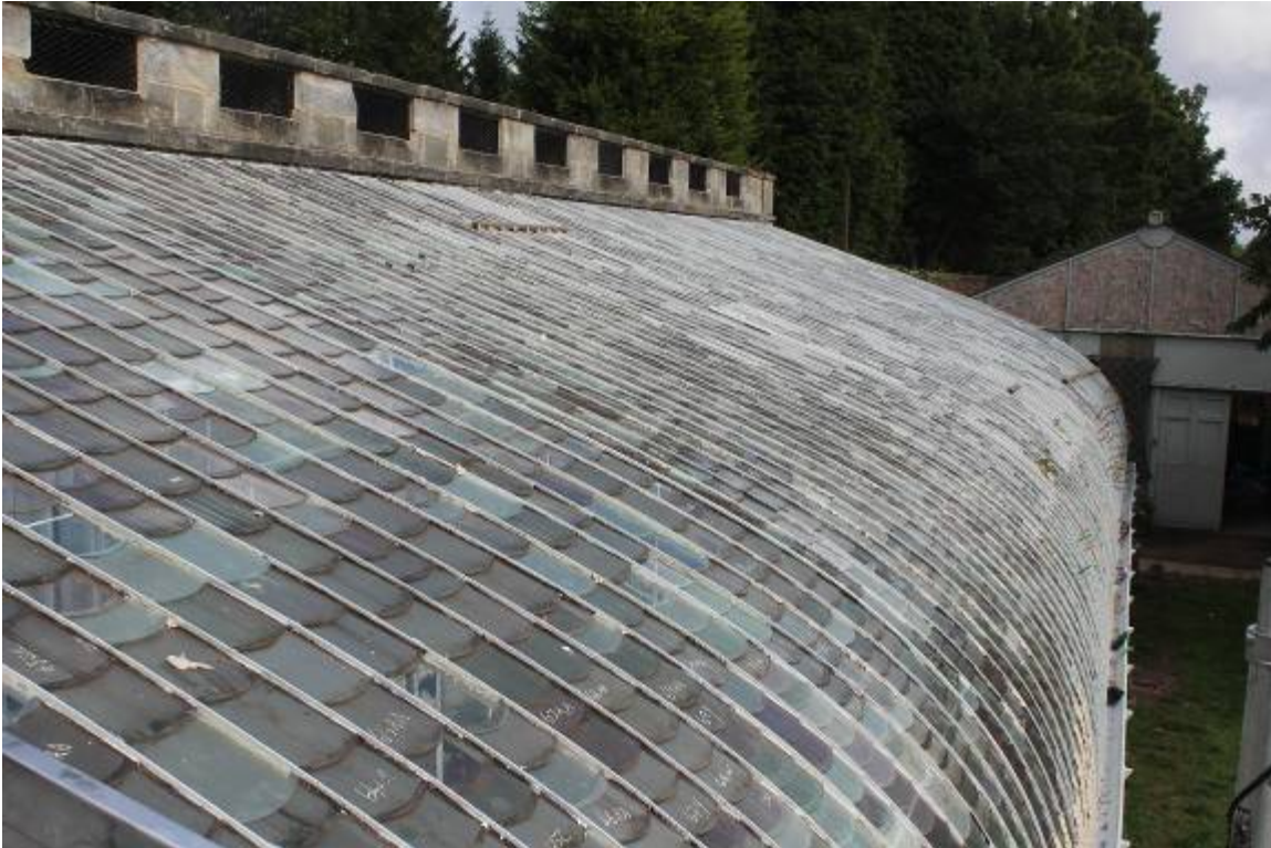
Glazing restoration on the eastern part of the range. The temporary numbering was a means of replacing panes accurately. Sept 2015

The EH Research Report on the glass [RR Series NO. 5 2013] indicates very little (one conclusive sample) survival of glass from the type produced in the date range 1830-70. This suggests that if the original construction date is before the mid 1840s the original glazing was largely replaced. It is possible that when the extension westwards was added to the original range a re-glazing was undertaken. The rolled glass used at Felton, which must have been produced after 1847 (date of the patent), may have been adopted to reduce scorch by diffusing the light entering the glasshouse.