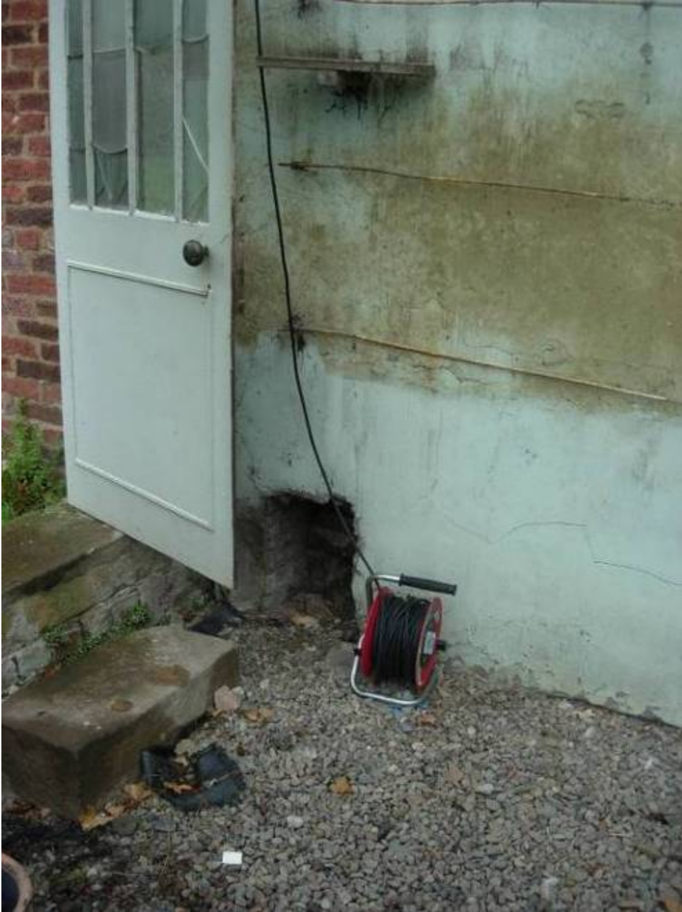
Opening in the back wall - for pipework or flues? at the west end of the range. The step here is inconveniently high and may be a later addition. 2013