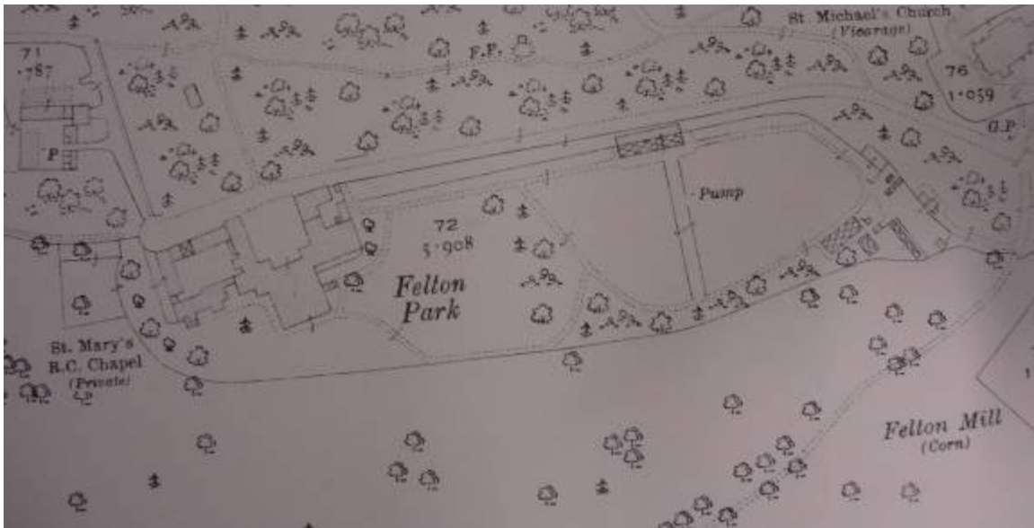
Extract from the O.S. 1:2500 plan, 3 rd Edition of 1923, revised 1921 [ Northumberland [New Series] Sheet 51.1]. The pleasure ground, productive garden and frame yard are still intact.