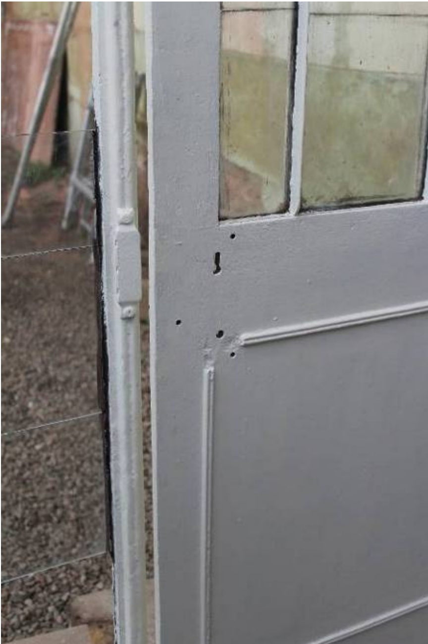
Partition lock box removed during repairs 2015. N.B. the moulding on the cast iron door plate was cut away to accommodate the lock, indicating that the lock was not part of the original design

Online searching in 2015 produced another example of the lock in an American museum (the Winterther Museum), though the details given did not state if the lock had come from a glasshouse door. One of the Felton locks was removed and sent for repair to allow reuse, leaving one original undisturbed as part of the 2015 repairs. Removal of the lock box showed that the original moulding on the door had been cut away to accommodate the lock and was not part of the original design.