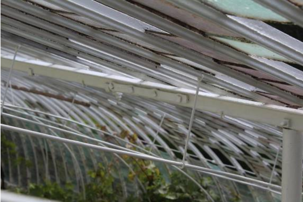
Fish plate joining sections of the purlin in the eastern part of the range. Note clips securing glazing bars to the purlin and arrangement for hanging the vine training wires from the glazing bars