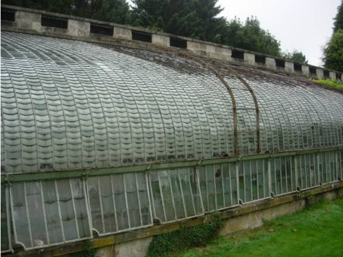
The moveable ladder and top hung front sashes 2013