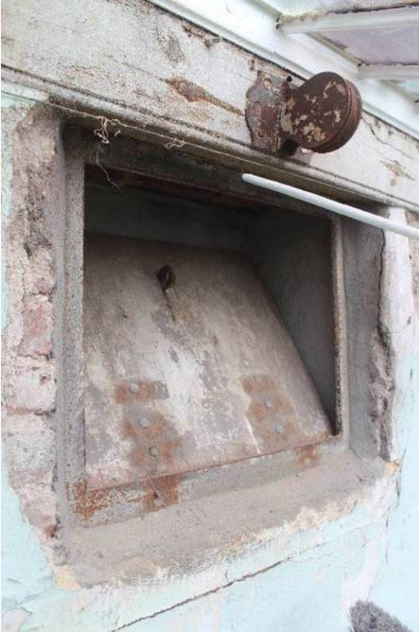
Ventilation opening at the top of the back wall. The arrangement for notching the top of the glazing bars over the top rail can be see top right