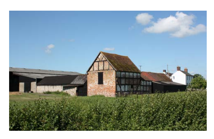
Farmsteads with a two-storey, timber-framed building with an attached single-storey range are a common feature, this form of structure extending eastwards into the southern part of the Severn and Avon Vales. These were absorbed into a regular L-plan by the mid-19th century.