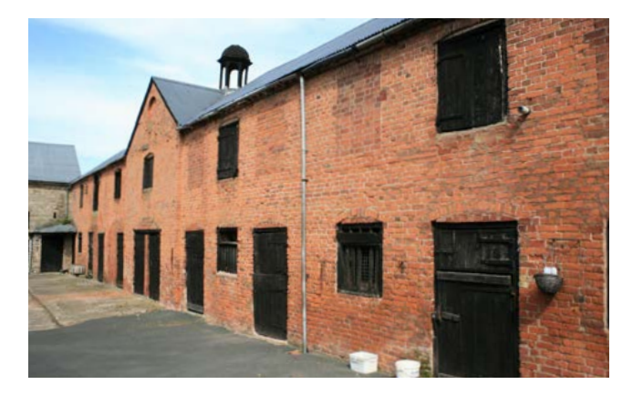
A large, late 19th-century, brick cow house range with hay loft over, its style reflecting an estate style of architecture.