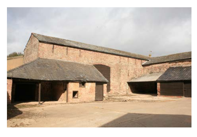
An L-shaped farmstead group, part of a larger complex with other detached buildings set around a yard, with additional lean-tos for housing cattle.