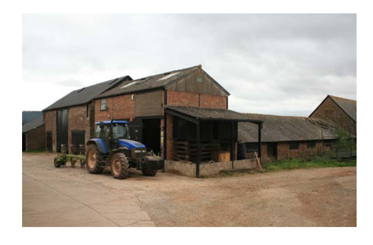
A regular courtyard group with barn, cattle housing and fodder stores that has developed from a loose courtyard origin.