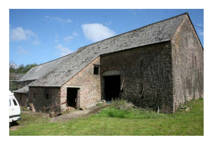
Cattle housing was commonly provided in lean-to structures built against the sides of barns.