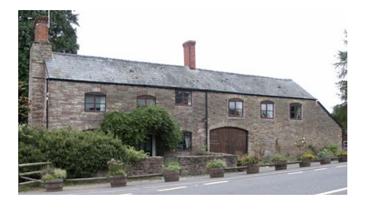
Linear farmsteads, such as this example of the early to mid- 19th century, are difficult to identify as almost all have passed into residential use. They are usually found along roads or around common land where smallholdings remained.