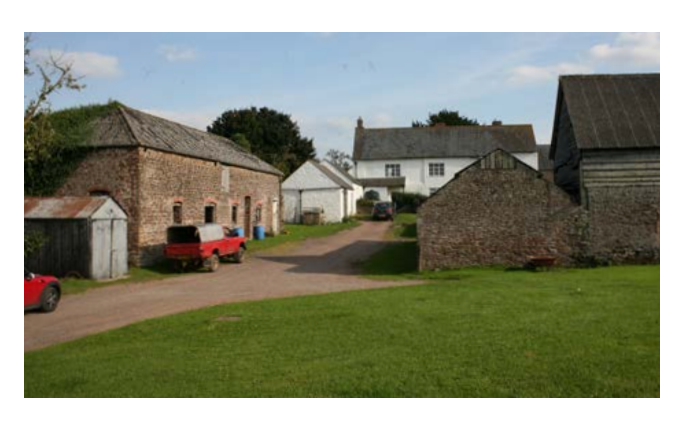
Medium-scale, loose courtyard plans that developed over time are characteristic of the area.