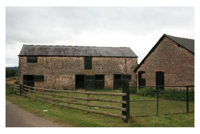
Cattle housing is often extensive, the building on the right being a wide-span building of a type developed in the High Farming years of the mid-19th century.