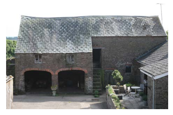
There are examples of bank barns with the threshing floor on the first floor, often marked only by a small winnowing door. This example on Garway Hill has a granary sited over cart sheds in the lean-to, and a stable to the right.