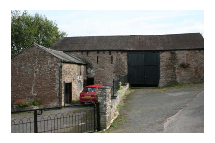
An L-shaped farmstead group of the early to mid- 19th century, with a stable projecting from a threshing barn.