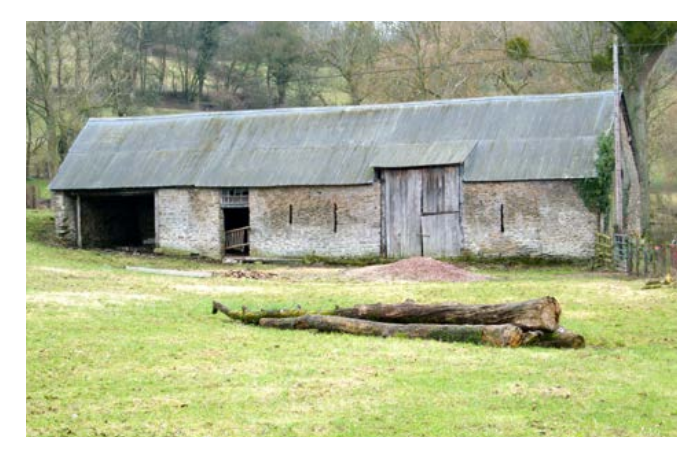
Combination barns are a characteristic feature of this area. This example has a stable and cart shed to one end.