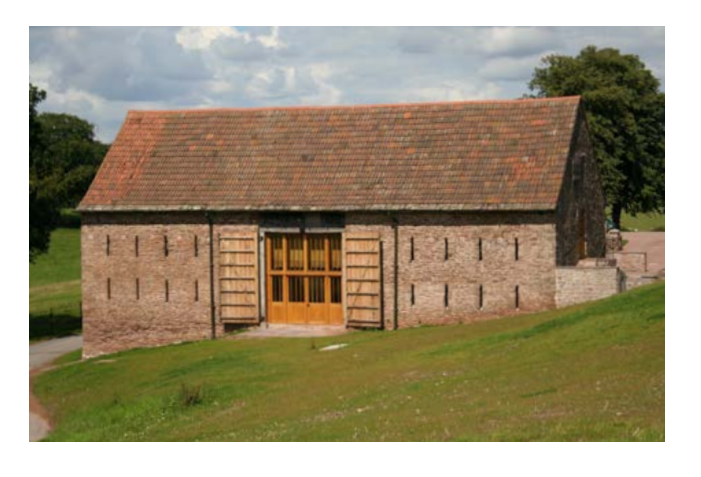
A substantial, five-bay threshing barn characteristic of this area.