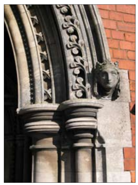
Fig. 5. Doorway to the porch.

within blind arcading. The triple lancet west window is surmounted by two quatrefoil windows above the passageway. The south east chapel has a triple lancet and a single lancet at the east end. The chancel east window has tall triple lancets divided by large buttresses extending just above the capitals, surmounted by a guatrefoil window. The south and north walls of the chancel have tall paired lancets and two small round windows each. A vestry, and to its north, a choir vestry is located on the north side of chancel and has a basement below. The porch has a double chamfered doorway with attached piers and nailhead, dogtooth and foliage mouldings. The tower has three principal stages with two openings to each stage together with a half stage of blind arcading between the second and third stage. There are corner spirelets to the broach spire and three lucarnes. A stair tower is attached at the north east corner.