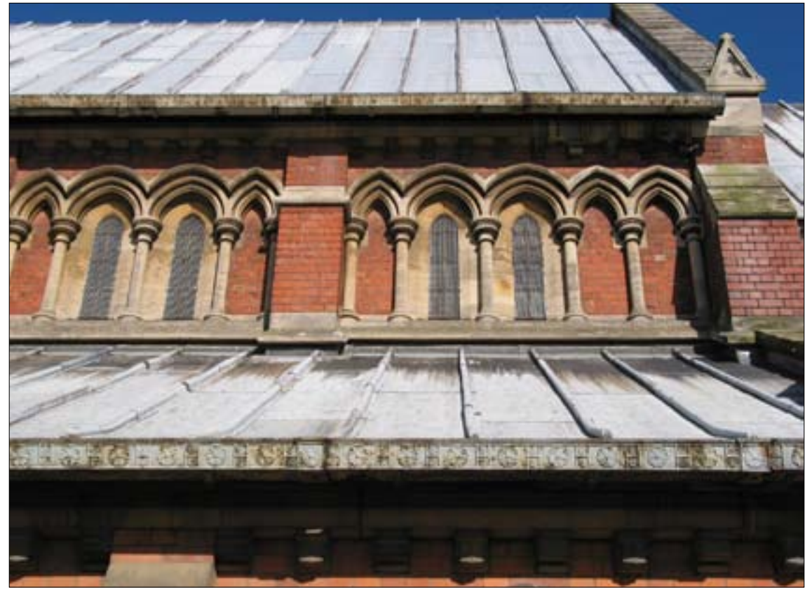
Fig. 4. Clerestory arcading and cast iron guttering.