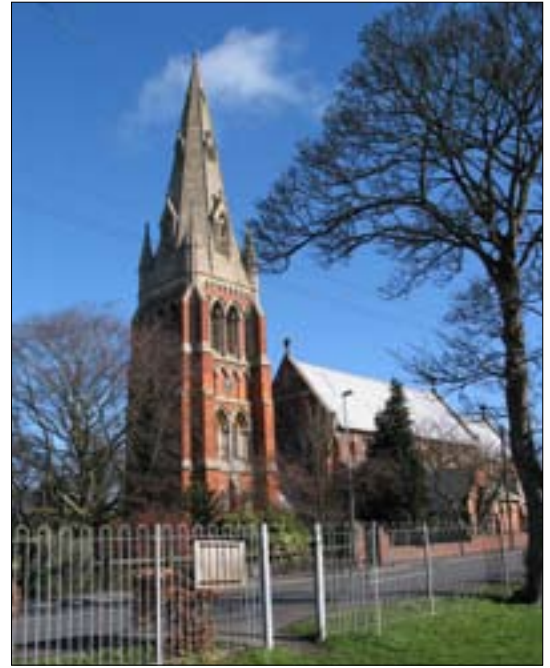
Fig. 2. The tower and broach spire.