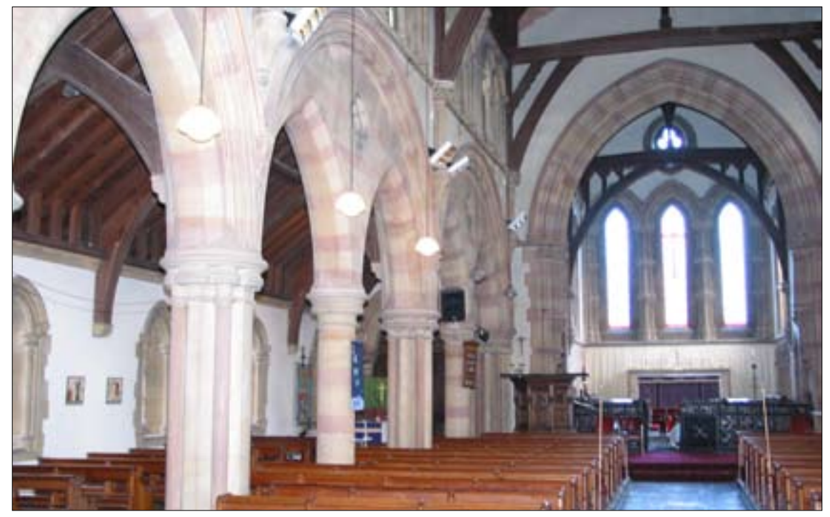
Fig. 6. Interior, looking east.

The interior is plastered with banded white and red Ancaster stone dressings. Instead of strong red brick, there is a subtle colour scheme, the alternating bands of Ancaster stone complementing each other in a way that achieves a polychromatic effect without the harshness of much constructional polychromy. It bears more resemblance to the Venetian examples that Ruskin espoused than the work usually described as Ruskinian Gothic by Scott's pupil, Street, or by Butterfield. Thus it is softer than the High Victorian Gothic of the 1860s and 70s and shows a move, however slight, towards the more refined Gothic associated with Bodley at the end of the century.