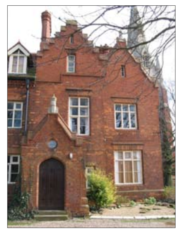
Fig. 12. The vicarage, west elevation.

The School is a single-storey structure attached to the choir vestry at the north east end of the church. It is of similar red brick to the church but with a tiled roof. Access from the church is gained externally through a three bay loggia supported on simple square section timber piers with angled struts. The first bay is enclosed with an open iron screen of plain design. Behind the loggia, there are two rooms, now used as toilets, a kitchen and the single schoolroom. This is expressed externally as a gabled wing at right angles to the link block with a bellcote on the west gable. The gabled wing has three flatheaded windows to the east and west elevations, each of diamond shaped small panes, the central window of greater height. Box section cast iron gutters have a swirling vine pattern. Extension of the school took the form of a prefabricated building rather than modification of the original structure which is consequently largely as built, other than the truncation of the chimney at the junction of the two wings.