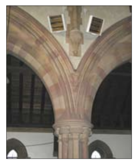
Fig. 7. Nave arcading.

The six bay nave is divided with three principal semicircular arches which are then subdivided into six smaller pointed arches. This unusual arcading is derived from that at Boxgrove Priory, West Sussex, a form also seen at St Thomas à Beckett's church at Portsmouth. Scott had carried out the restoration of Boxgrove in 1864-5.<sup>2</sup> The piers of the principal arches are in the form of Greek crosses with detached shafts within the curved angle of the cross while the latter are round piers. The spandrel between each pair of arches is pierced with a quatrefoil opening. The broad and richly decorated triple chamfered chancel arch has roll mouldings and carved label stops, that on the north side depicting Bishop Christopher Wordsworth who dedicated the church. There are bell capitals to the nave piers