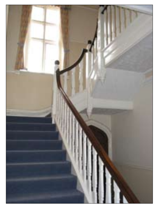
Fig. 13 The vicarage, entrance hall and stairs.