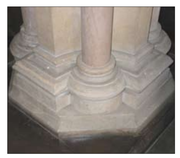
Fig. 8. Base of nave piers.