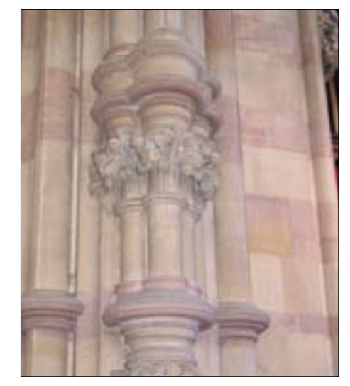
Fig. 9. Shafts of chancel arch.

and there is extensive stiff leaf carving by Farmer & Brindley to those of the chancel arch and the shafts of the roof struts. Deep splayed jambs to the nave windows have shafts attached by a fine fillet of stone. The paired clerestory windows are set back in deep splayed jambs with a detached arcade forming the internal or "scoinson" arch. The east and west windows too have attached shafts. Although the nave is tall, it is saved from being barn-like by the design of the roof where the combination of king posts, tie-beams and twin curved struts visibly hold the composition together. These struts are supported by carved stone corbels extended below as shafts.