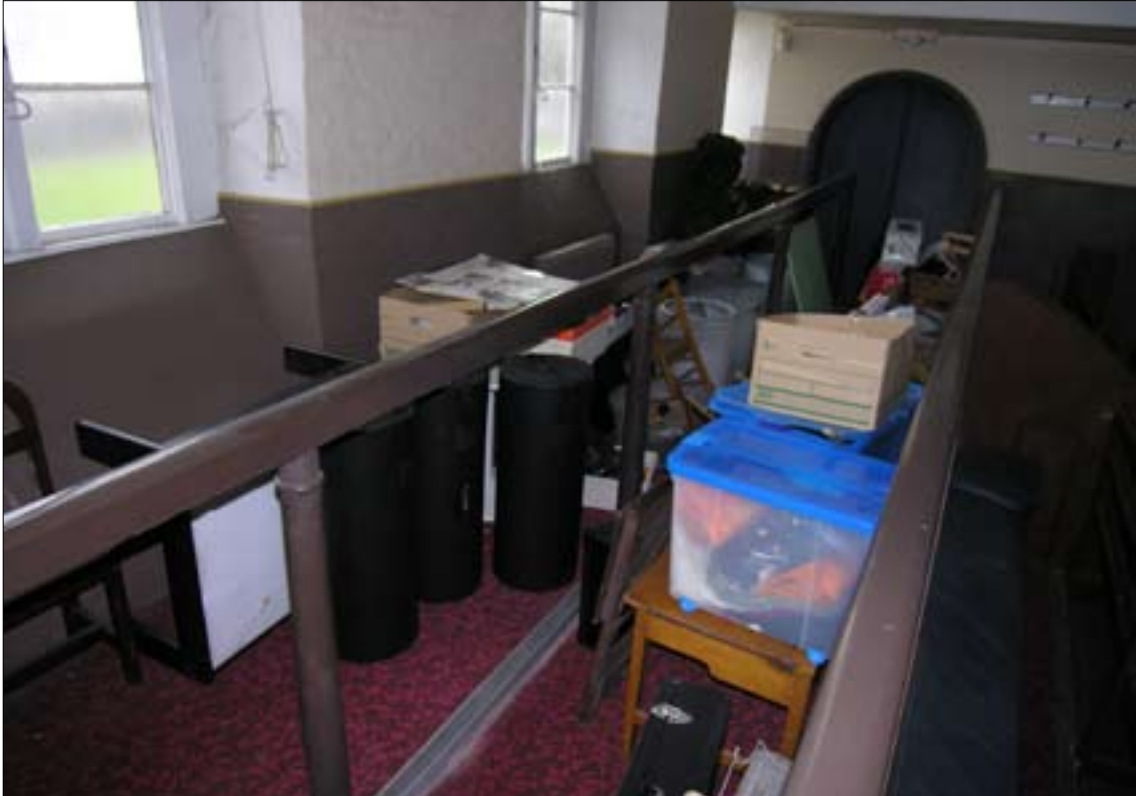
Fig. 8. The north Civil Courtroom, the surviving standing rail in the public gallery.