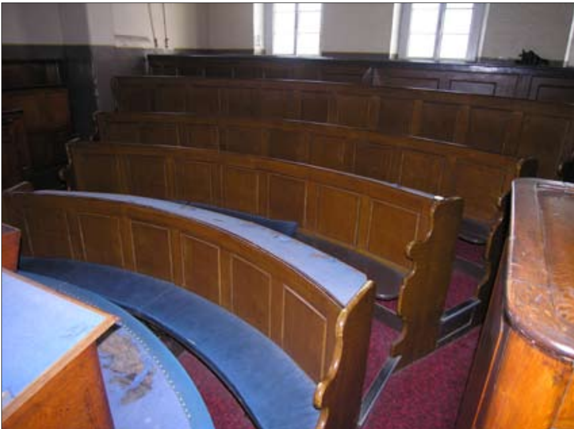
Fig. 7. The north Civil Courtroom, showing the curved benches installed in the 1820s.