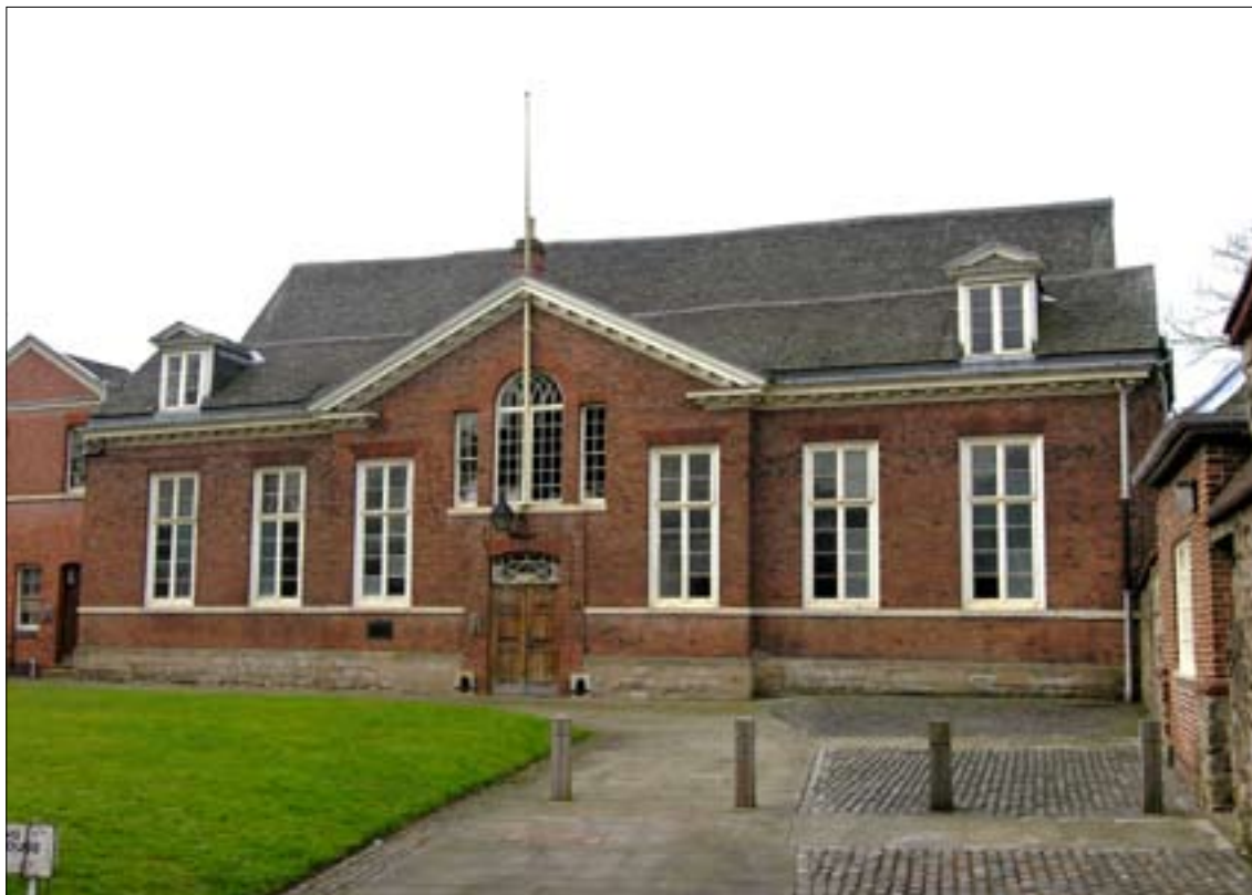
Fig. 3. The east front of the Great Hall as altered in the 1820s.

This arrangement of courts at either end of a single space, with no division between them, was common at this time. The fittings for each court were very basic; they included a raised dais and a central table with benches around it. The prominent spiral stair visible in the engraving of 1821 (fig. 1) led to an upper room lit by the windows in the pediment. This room presumably provided accommodation for judges and court officials and possibly the court records. This arrangement was swept away in the later 1820s when the present courtrooms and central hall arrangement was introduced.