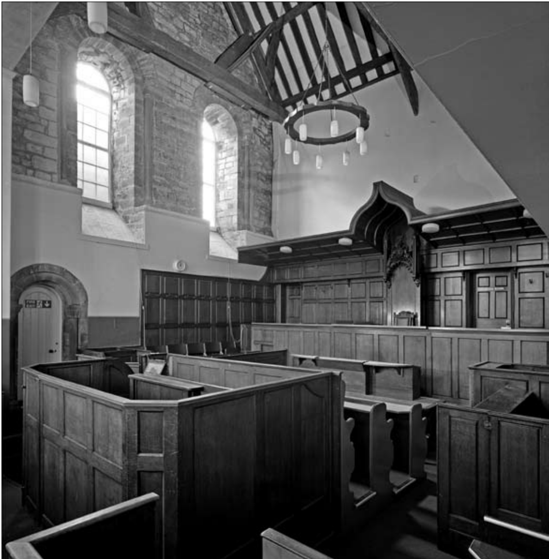
Fig. 6. The south Criminal Courtroom, showing the fittings inserted in the 1820s, with later alterations.

This courtroom has a raised dais along its west side (fig. 6). This west wall is panelled with a continuous canopy above. The panelling is early 19 th century, though the upper tier of panels appears to have been reused at a later date, probably when the canopy was added in the later 19 th century. The canopy has a central ogee hood over the judge's seat; this seat has a back panel topped with the royal coat-of-arms dating from the same period. This west wall has doors leading to the accommodation for court officials rebuilt in 1856-58. The panelled front to the judge's bench is early 19 th century, though extended in the later 19 th century, the clerk's desk in front is largely 20 th century. The three rows of painted benches, which occupy the centre of the court and have panelled backs and curvaceous bench ends, date from the 1820s. The witness box to the north is panelled with curved corners; it has a separate access doorway from the entrance hall. Most of this panelling dates from the 1820s but it has been altered, re-ordered and re-used. There are panelled benches to the side of the witness box.