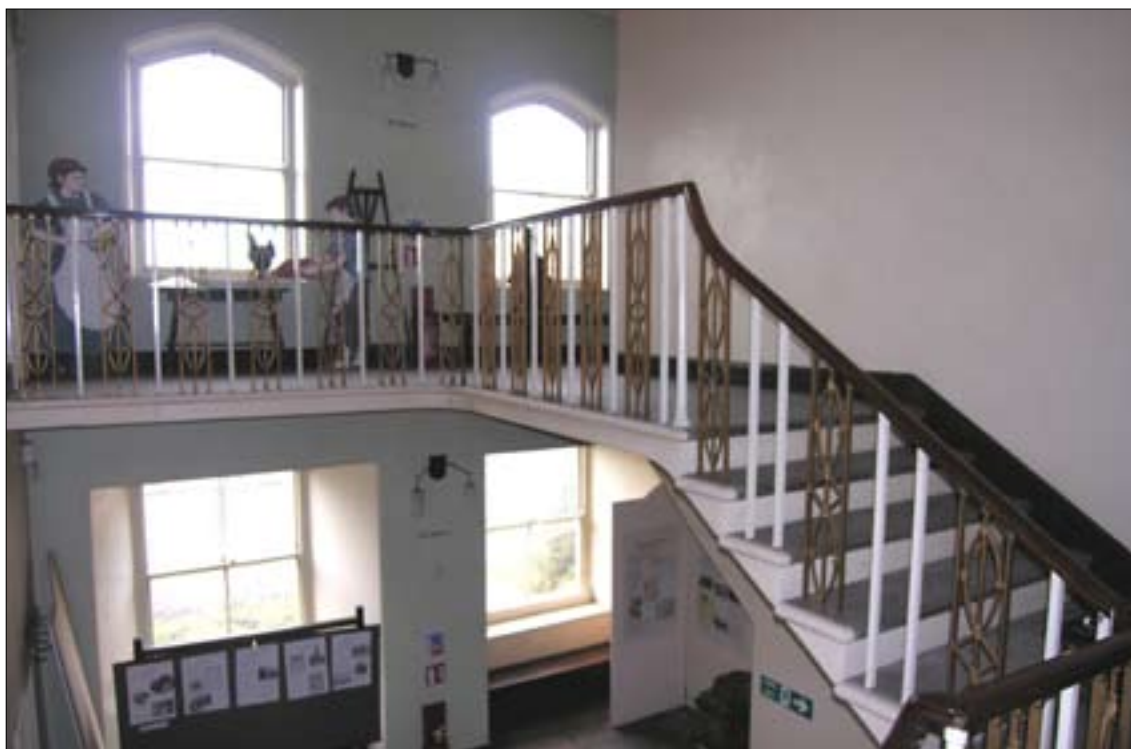
Fig. 5. The upper flight of the main stair, altered 1856-58, re-using the 1820s iron balustrade.