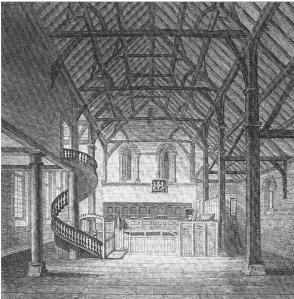
Fig. 1. The interior of the Great Hall in 1821, showing the Assize Court fittings at the south end.

This Great Hall was built in the 12 th century as part of the post-conquest castle. It was originally an aisled hall with timber aisle posts, though these posts have been removed on the east side and buried within later walls on the west side. The original clerestory was removed and the roof replaced in the 16 th century (fig. 1); between c.1502 and 1530 according to recent dendrochronology results. 1