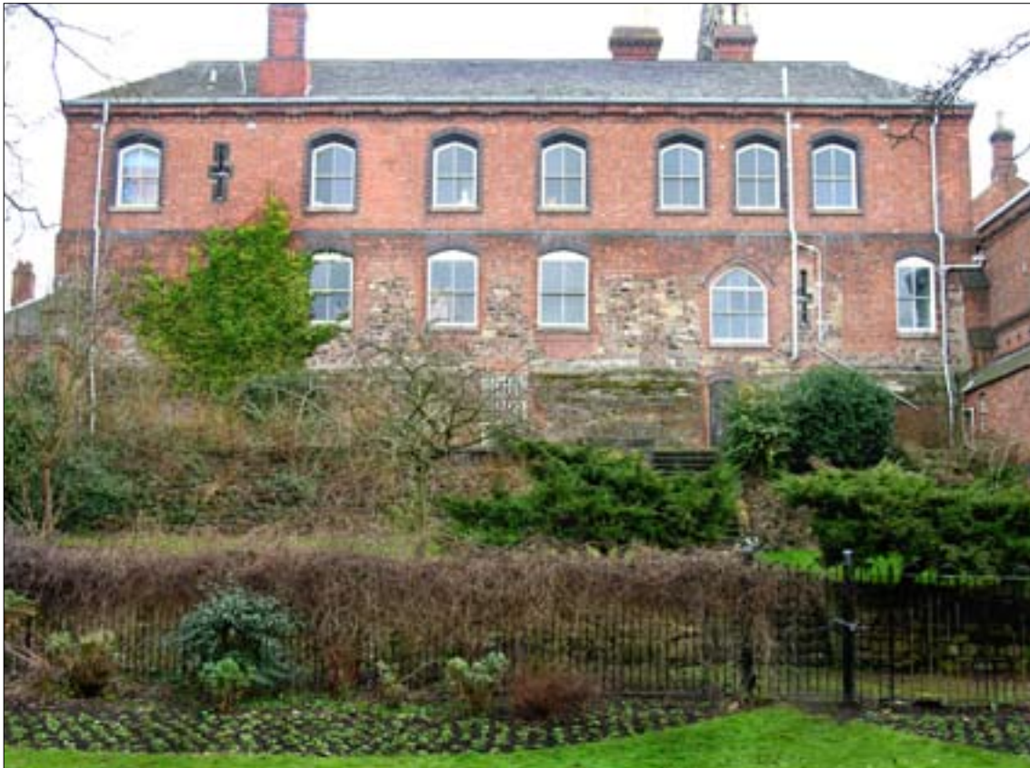
Fig. 4. The west front of the Great Hall altered by William Parsons 1856-58.

(from east to west) were inserted dividing the hall into three. The central space became the combined entrance hall and stair hall, flanked by two separate courtrooms, one to the north for the Quarter Sessions and the other to the south for the Assizes. The remodelling of the central hall also involved the alteration of the 17 th century brick east façade. A new doorway was added and a Venetian window was inserted at the first-floor level which necessitated the alteration of the pediment above (fig. 3). A new two-storey wing was added to the south of the Great Hall containing the barristers' rooms, and cells were installed below the south, Assizes courtroom.