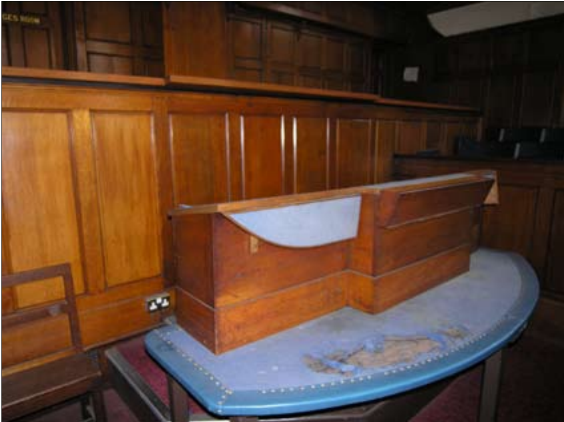
Fig. 10. The north Civil Courtroom, the panels in front of the judge's seat showing the four original central panels and the later panels added at either side.

This use of curved benches was popular in the early 19 th century in civil courts. The witness box is sited on the south side in this court, again it has panelled sides with curved corners. There is further seating on the north, here the benches have been removed and replaced with chairs and the back panelling has been reduced in height. All along the west side is bench seating for the public which appears to have been altered in the later 19 th century. The original public gallery behind this seating survives intact with its central standing rail (fig. 8), this area is accessed from the double doors in the lobby. As in the Criminal Court, the narrow upper gallery on the south side was probably used as a press gallery, or for extra public seating.