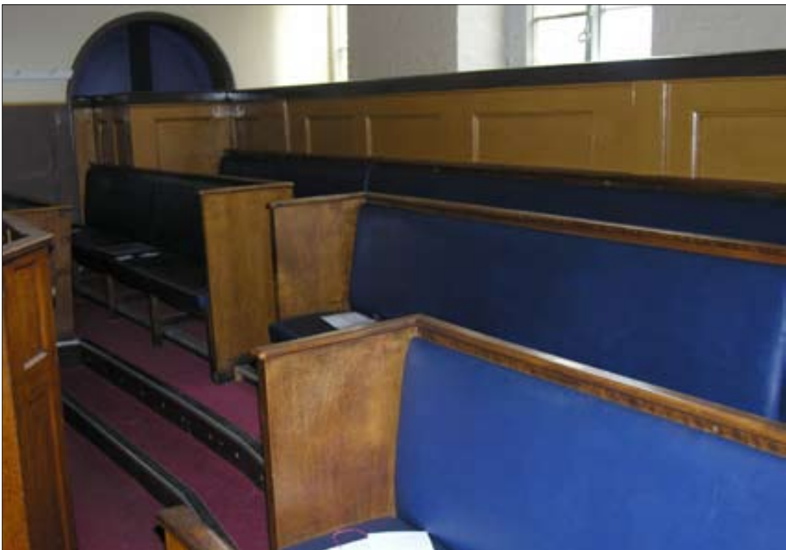
Fig. 9. The south Criminal Courtroom, the public seating inserted in the 20 th century.