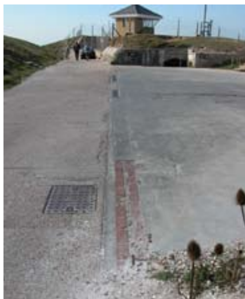
Figure 14 The Main Building lay to the right, this view shows the line of its front wall.

The central area of the emplacements was transformed by the construction of a large structure known as the Main Building (Figure 14). The Preparation or Main Building was equipped with a wide variety of test equipment to check its electronic, pneumatic and hydraulic systems. Other smaller shops within the building checked guidance gyros, aligned monitoring transponders to the correct frequencies, and charged vehicle batteries. It was a steel-framed structure spanned by five trusses and two half-trusses at either end,