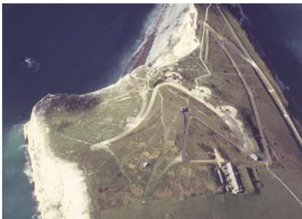
Figure 12 The High Down Test Site viewed from the east, to the bottom right are the Coastguard Cottages and to their right are the White Cliffs.

The High Down Test Site was established on the site of New Battery in 1956 and occupied 35 acres (14.16 hectares) of the downland and cliffs (Figure 12). Access to the site was from Alum Bay along the original fort road terraced into the hillslope above the White Cliffs. The test site's outer boundary fence ran from this road and to west of steps to Coastguard Cottages , past the cottages and to the cliff edge. On the road above the White Cliffs, at the