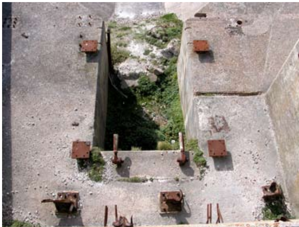
Figure 19 Gantry 2 detail showing the fixing plate for the gantry and efflux duct beneath.

Sites , No.1 to the west and No.2 to the east. Adjacent to each of stands was a Test Post (Figure 18) before firing these were used for the initial checking of the rockets' systems and for routing cables back to the Preparation Area . Adjacent to each of the Test Posts was a bath into which the personnel could jump if they were contaminated with high test peroxide. The sites of both these baths are now obscured by tipping. At Firing Site No.1 a set of concrete stairs provided access from the Preparation Area to the rear of the Test Post . Its site is infilled with chalk rubble, a contemporary photograph (British Hovercraft