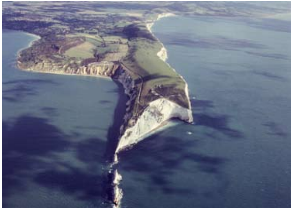
Figure 1 The Needles viewed from the west with the High Down and Tennyson Down to the right. In the foreground is James Walker's 1859 Goose Rock lighthouse. To its right is Scratchell's Bay and above it New Battery and the High Down Test Site. (c) English Heritage NMR18515/30