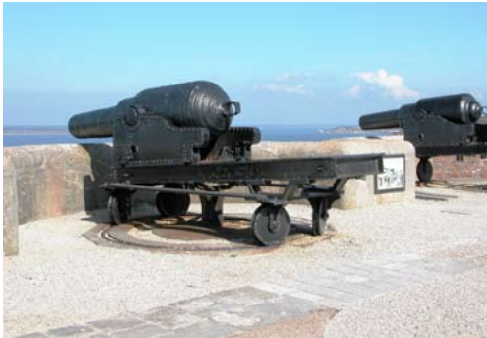
Figure 3 The Needles Battery, 1870s rifled 9-inch muzzle loading guns placed on replica carriages.

The end of the century brought new threats, in particular small motor torpedo boats, and in the late 1880s trials were undertaken with searchlights and quick firing guns. In 1908 a Fire Command Post was added to co-ordinate all the guns defending the Needles Passage and later in 1913 one of the country's first fixed anti-aircraft guns was tested on the fort's parade ground (Savage c.2000, 7; Coad 2007, 53).