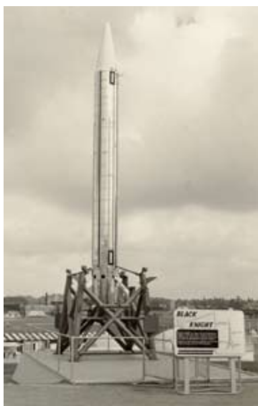
Figure 6 Black Knight rocket.

A detailed discussion of post-war British space policy, the specifications and performance of the Black Knight and Black Arrow rockets are beyond the scope of this report. Three recent publications provide up-to-date summaries of these projects and the design of the rockets (Hill 2001, Millard 2001 and Hill 2007). The National Archives, Kew, also holds many original files relating to the role of Black Knight in the Blue Streak missile programme, post-war space policy, as well as technical reports detailing the results of the experiments carried out using these vehicles.