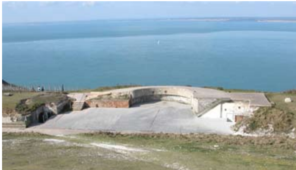
Figure 10 The central emplacement, to either side are entrances to the underground magazines.

The three emplacements are semi-circular in shape with an outer curving concrete parapet (Figure 10). From the seaward side they presented a low profile with only their shielded guns appearing above the parapet. To the rear the gun pits were open with the guns set on a central mounting that elevated the barrels to the height of the parapet. Surrounding the gun was a raised metal platform for the gun crews. Set into the walls of the emplacements are lockers, formerly closed with steel doors, which were used to house ready-use ammunition. The eastern most emplacement (F1) has been stripped of most of its fittings, and was left as an open area when the battery was incorporated into the test site's Preparation Area . At this time its base was covered by tarmac thereby obscuring any surviving features of the gun mounting and supports for the surrounding deck.