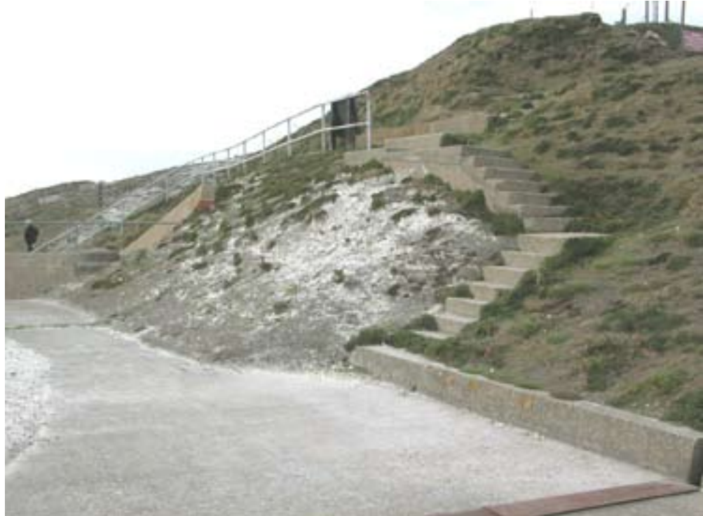
Figure 18 Site of the Test Post adjacent to the Firing Site No.1 (west).

Sites , No.1 to the west and No.2 to the east. Adjacent to each of stands was a Test Post (Figure 18) before firing these were used for the initial checking of the rockets' systems and for routing cables back to the Preparation Area . Adjacent to each of the Test Posts was a bath into which the personnel could jump if they were contaminated with high test peroxide. The sites of both these baths are now obscured by tipping. At Firing Site No.1 a set of concrete stairs provided access from the Preparation Area to the rear of the Test Post . Its site is infilled with chalk rubble, a contemporary photograph (British Hovercraft