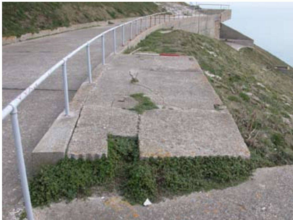
Figure 17 Facilities Storage area.

To the south of the Pump House is a narrow passage way between it and the freestanding trapezium-shaped Control Room . This passage way gives access to the Control Room through an outward opening armoured door in its rear wall. To either side of the Control Room concrete wing walls retain the hillslope and give access to its front. It is built on a concrete base and is separate from the main causeway and in the event of an accidental explosion it was designed to withstand pressures of up to 10lb/in 2 . Internally are various plinths and mounting bolts for the safety officer's console that was positioned in the centre of the room and in the northeast corner controls to engage the fire fighting system. In its eastern and western walls are armoured observation windows facing the two Firing Sites and single windows in its front and rear walls. At platform level the passage way is covered by wooden boarding to give access onto the Control Room's roof. This was previously bridged by steel plate, which allowed a rocket trailer to be reversed into this area.