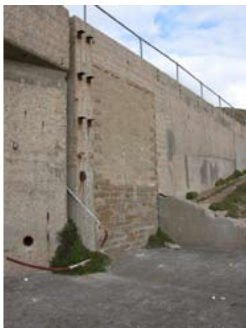
Figure 20 Gantry 1 showing the blocked High Test Peroxide bay and the vertical joint separating the gantry foundations from the causeway.

The Firing Sites' foundations were cast as separate structures indicated by a vertical joint on the front face of the platform. During operation the Firing Sites were covered by Gantries (Figure 19). These fulfilled a number of functions, they were used to raise the rockets over the firing position, provided weather protection for the rockets and personnel, and carried the service pipes and cables. They were steel-framed and clad in Noral aluminium sheeting. In contrast to the gantries at Woomera these ones were fixed. The superstructures of each Gantry were 62ft 7ins (19m) tall and internally there were six working decks, at the apex of the structure was a running beam and 'Felco' hoist which was used to raise the rocket off its transporter and position it over the firing pit. Externally the gantries