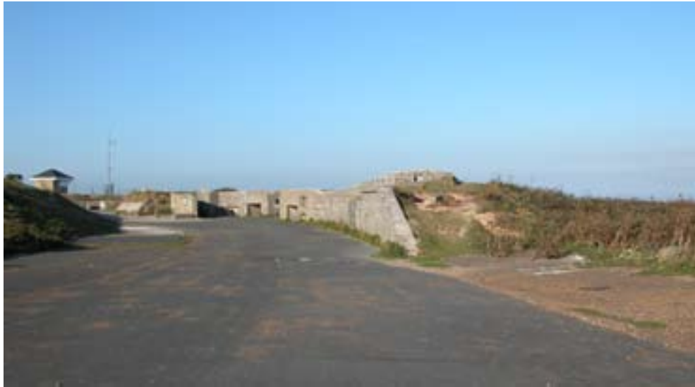
Figure 7 The New Battery, rear side from the east .

The New Needles Battery (SZ 29918 84806) sits at the western end of West High Down, just beneath its crest (see Figure 9). As described above a new road was constructed to link the Old Needles Battery to the new site. To the rear of the battery an upper road led to the Battery Command Post and on towards the Coastguard Cottages . The eastern extent of the battery roughly coincided with the present north to south fence to the south of Coastguard Cottages , where two War Department boundary marker stones remain. The New Battery comprised three open, mass-concrete emplacements with a Position Finding Post at its eastern end (Figure 7). During the 1950s the emplacements were partly subsumed within Saunders Roe Preparation Area and a number of modifications were made to them. In the early 1970s the 1950s structures were removed re-exposing the battery.