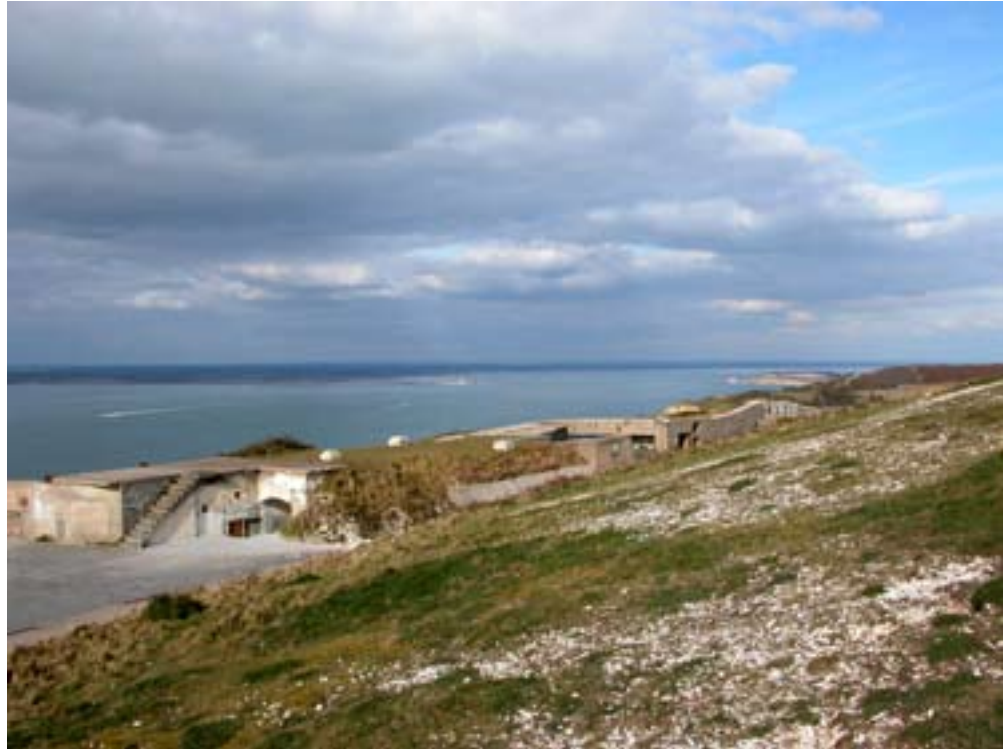
Figure 4 The New Needles Battery, looking eastwards towards Hurst Castle and the Solent . (c) English Heritage

not until 1900 that it was equipped with two 9.2-inch Mark IX breech-loading guns, the third was in place by 1904. The delay in arming the new battery may in part be accounted for in contemporary perceptions about threats to the country and the competing demands on both the Treasury and gun-makers to re-equip the Royal Navy with modern battleships. At the east end of the emplacements was a position finding post with a telephone room beneath. Around 1900 a new battery command post was built on the crest of the hill. For practice use two quick firing 3-pounder guns were placed between the centre and northern emplacement, but by 1907 these had been removed. Between 1911 and 1914 the emplacements were adapted for Vavasseur Barbette (VB) mountings, which used an inclined ramp to help to absorb the recoil forces. In 1913, one 9.2 inch Mark IX breech loading gun (M1) was installed and a year later a similar gun (M2) was erected, leaving the central emplacement dismantled (TNA: PRO WO192/134). During the First World War a 6-pounder quick firing gun was emplaced to the south of the westerly emplacement for examination service use, whose role was to confirm the identities of ships entering the Solent.