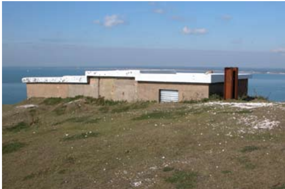
Figure 11 Battery Command Post, later used as a transformer house, looking west wards to the Solent's approaches.

Command Post was built with clear views of the Solent's western approaches (Figure 11). In the triangular-shaped piece of ground between it and the Coastguard Cottages , was another hut for 30 men, an unidentified building, and a temporary officers' mess formed from old railway carriages. Immediately to the south of the Coastguard Cottages was a Semaphore and Watch House (TNA: PRO WO78/4892, drwg.5). No surface traces of these features are visible.