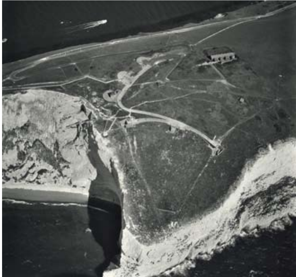
Figure 5 The High Down Test Site , in the foreground is the headland of Sun Corner and to its left Scratchell's Bay .

The site selected for the test stands was at the top of the steeply sloping cliff side between Sun Corner, at the western end of High Down cliffs, and the recently abandoned New Battery. The cliffs and hillslope above Sun Corner formed a natural amphitheatre with the test stands at the top and their exhaust, or efflux, channels facing out to Scratchells Bay (Figure 5). The tests stands were placed below the top of the cliff along the 113m (370 ft) contour at either end of a curving concrete service road. This position both gave the buildings in the preparation area some acoustic shielding and also gave them a measure of protection from flying debris should there be an accidental explosion. To the north the Needles headland provided similar protection as well as preventing observation of the site from the mainland.