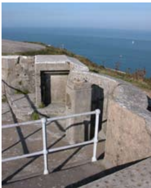
Figure 8 Position Finding Post.

The New Needles Battery (SZ 29918 84806) sits at the western end of West High Down, just beneath its crest (see Figure 9). As described above a new road was constructed to link the Old Needles Battery to the new site. To the rear of the battery an upper road led to the Battery Command Post and on towards the Coastguard Cottages . The eastern extent of the battery roughly coincided with the present north to south fence to the south of Coastguard Cottages , where two War Department boundary marker stones remain. The New Battery comprised three open, mass-concrete emplacements with a Position Finding Post at its eastern end (Figure 7). During the 1950s the emplacements were partly subsumed within Saunders Roe Preparation Area and a number of modifications were made to them. In the early 1970s the 1950s structures were removed re-exposing the battery.