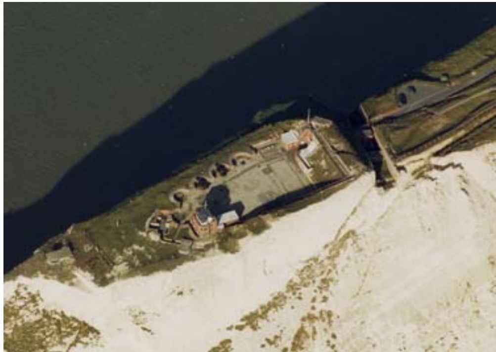
Figure 2 The Needles Battery.

From the cliffs above The Needles there are commanding views of the western approaches to the Solent and eastwards towards Southampton Water. Prior to the construction of the first permanent battery between 1861 and 1863 historic Ordnance Survey maps show that the headland was deserted except for a track along West High Down, which is followed by the modern footpath and terminated somewhere above Sun Corner. To assist in the construction of the fort and the transport of its heavy guns a new road was terraced into the north side of the headland along the top of the White Cliffs.