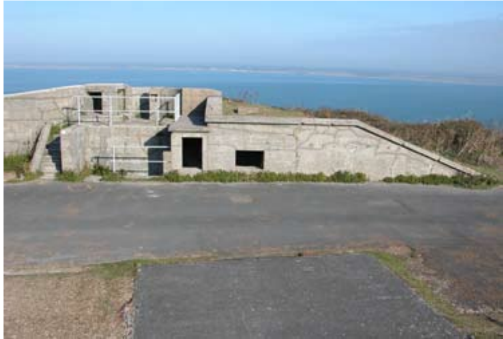
Figure 13 The telephone room beneath the former Position Finding Post was later used as a store.

Centre. The former Shell Store and Store for Small Items were converted into the General Battery Room and the Flight Battery Room . The General Battery Room is now used by the National Trust as a Café . To the north the large Cartridge Room was transformed into the Control Room to the west and the Guidance Room to the east. At the east end the small Shifting Room was used as the Recording Room (Strubbe drwg 99/11R; British Hovercraft Corporation 1971, 7-8).