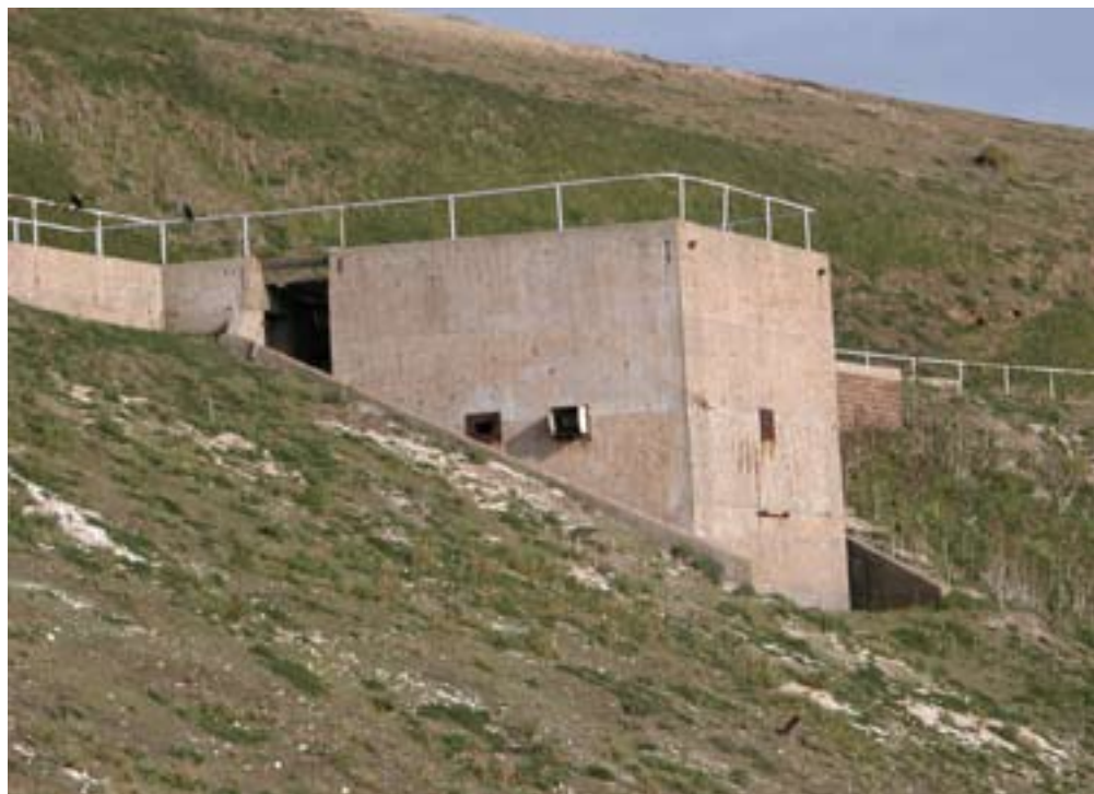
Figure 16 The Control Room, the Pump House lies to the left beneath the access causeway.

The test stands (SZ 29943 84707) were approached from the Preparation Area along a concrete road that turns steeply at the westerly emplacement, now occupied by the Coastguard Station . Steel covers along this section of track mark to the rear the line of the control and monitoring cables leading back to the Preparation Area and to the front the high test peroxide pipe. This track gives access to the gently curving access platform, the curve in part defined by the track following a level contour across the hillslope. At the centre, and seaward side of the platform is the reinforced concrete Pump House and Control Room and to either end the Firing Sites , No.1 to the west and No.2 to the east.