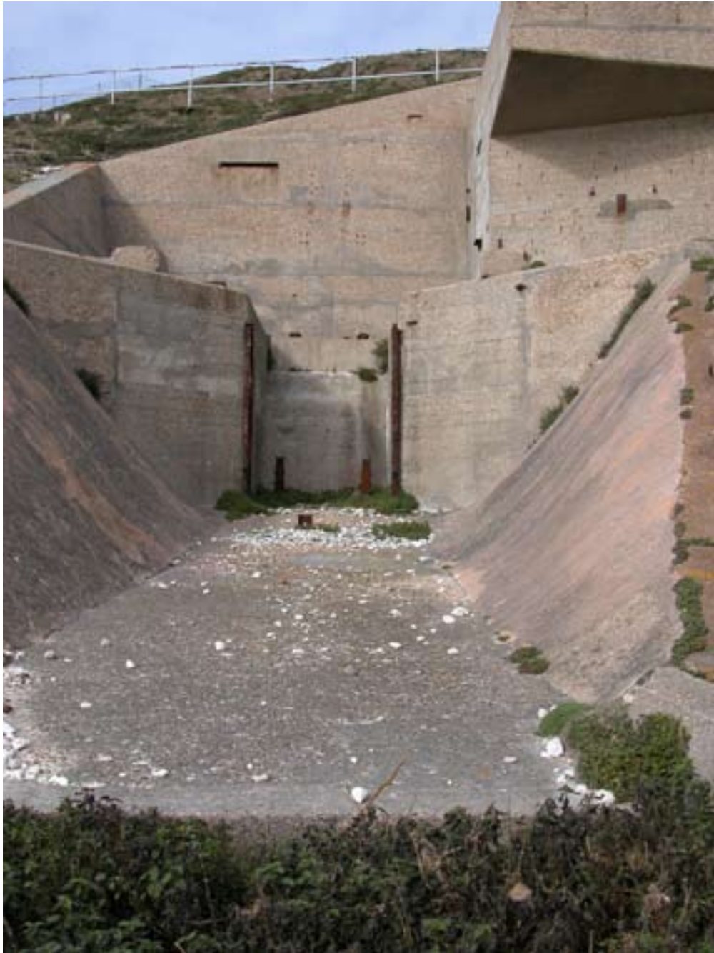
Gantry 1 looking up the efflux channel towards the gantry foundations