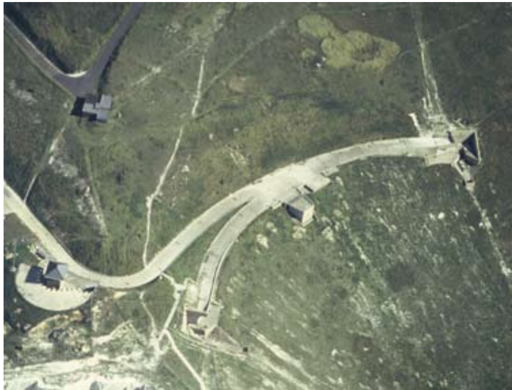
Figure 15 The Firing Area showing the Firing Sites and the central Control Room.

To prevent transport damage to the vehicle the Preparation Area is generally as close as possible to the firing or launch area (Figure 15). After the test vehicle had been checked it was hauled the short distance to one of the test gantries. Here the rocket was hoisted to a vertical position before it was lowered on to the launcher. The steel-framed gantries housed hoists for raising and lowering the rockets, servicing platforms and a variety of services, including high pressure air and nitrogen, fuel lines, and water for dowsing the exhaust duct and fire fighting. On this exposed headland they also had the vital function of providing a weather shelter from salt air, high winds, rain, ice and snow. At High Down the gantries were fixed, whereas the ones at Woomera were designed to be rolled back in preparation for a launch (Tharratt 1963a, 252). Once it was secured to the launcher the final checks were made, including the mechanical and electrical stage connections, internal