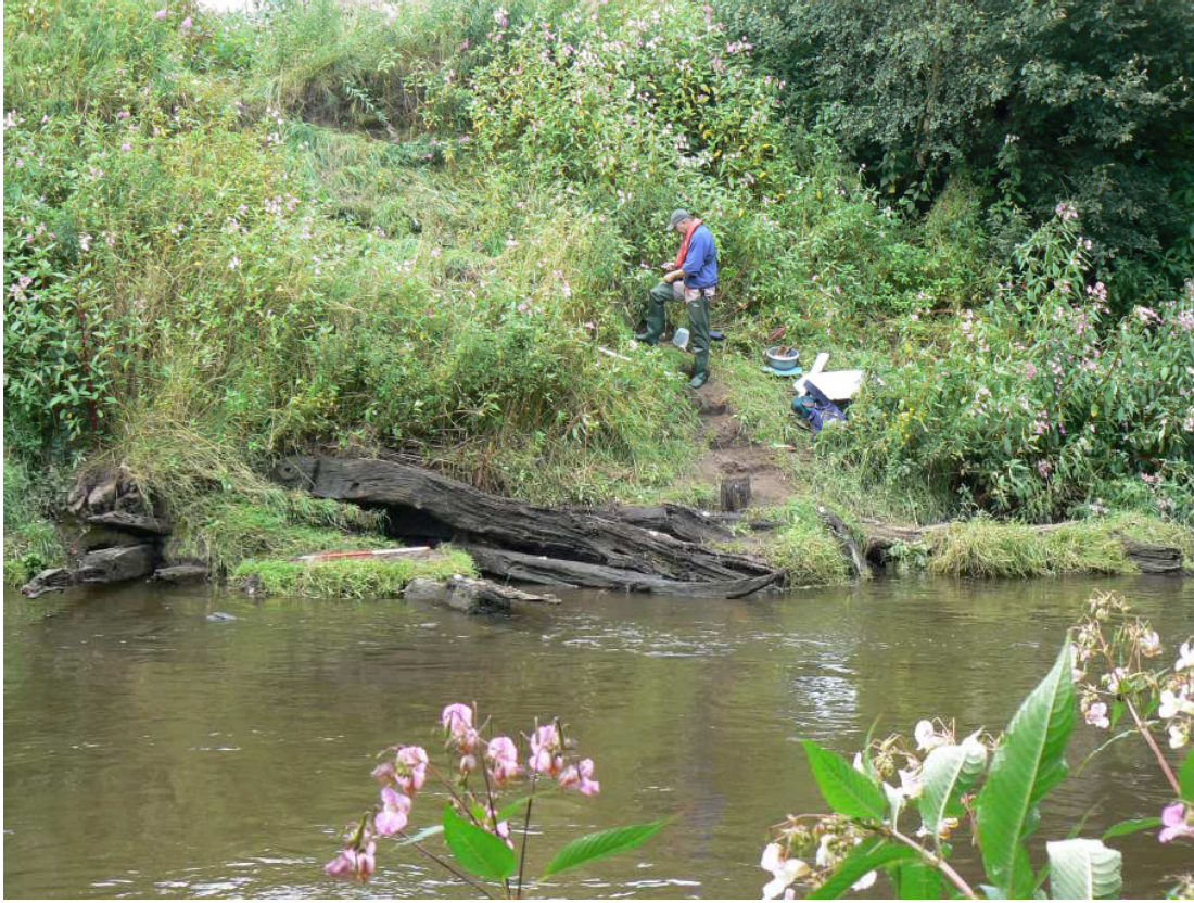
Figure 3 A view of the site looking south-west from the opposite bank. After Roberts 2010, plate 5