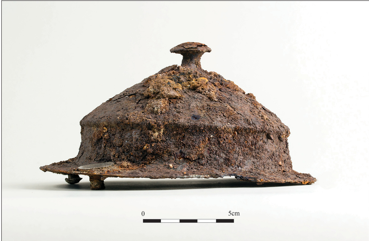
Above: Plate 4. SF3 Shield boss.