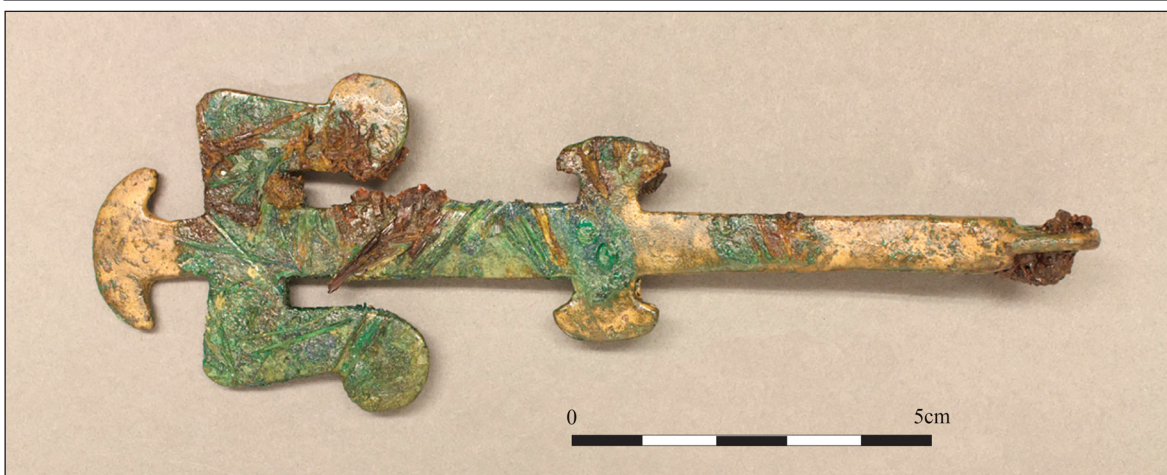
Top: Plate 1. SF25 Horse harness fitting converted to a brooch.