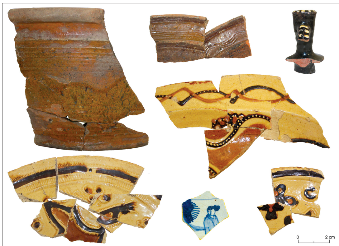
Plate 8. Post-medieval pottery. From The Shrunken Village of Hamerton . See Figure 4 in that paper for a detailed description of the items shown.

From Return to the Three Kings, Haddenham : further excavation of the early Anglo-Saxon cemetery discovered in 1989.