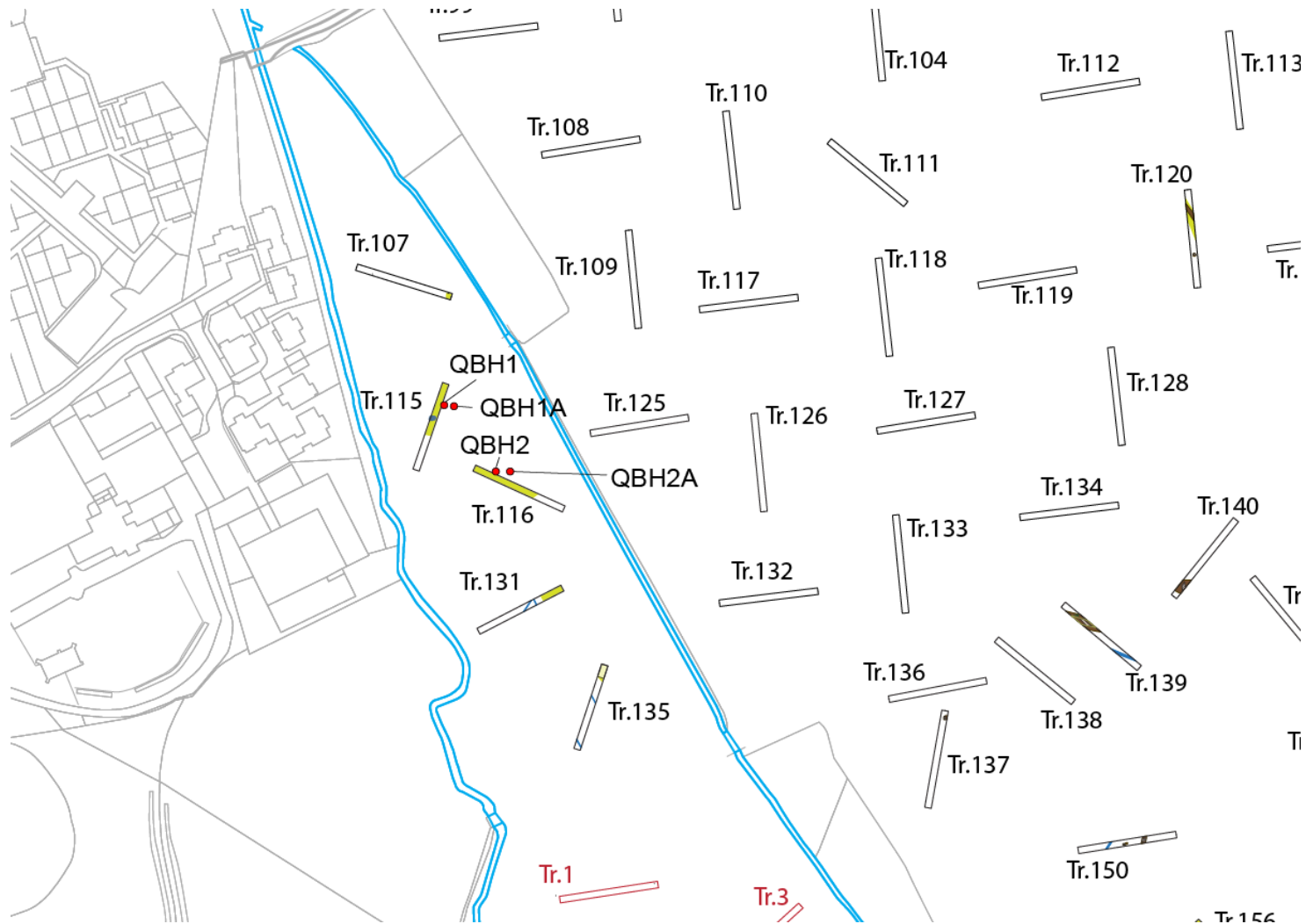
Figure 2: Location of the new ge archaeological boreholes at Land off Gilden Way, Harlow, Essex. Extent of the possible former channel highlighted in yellow in Trenches 115, 116, 131 and 135.