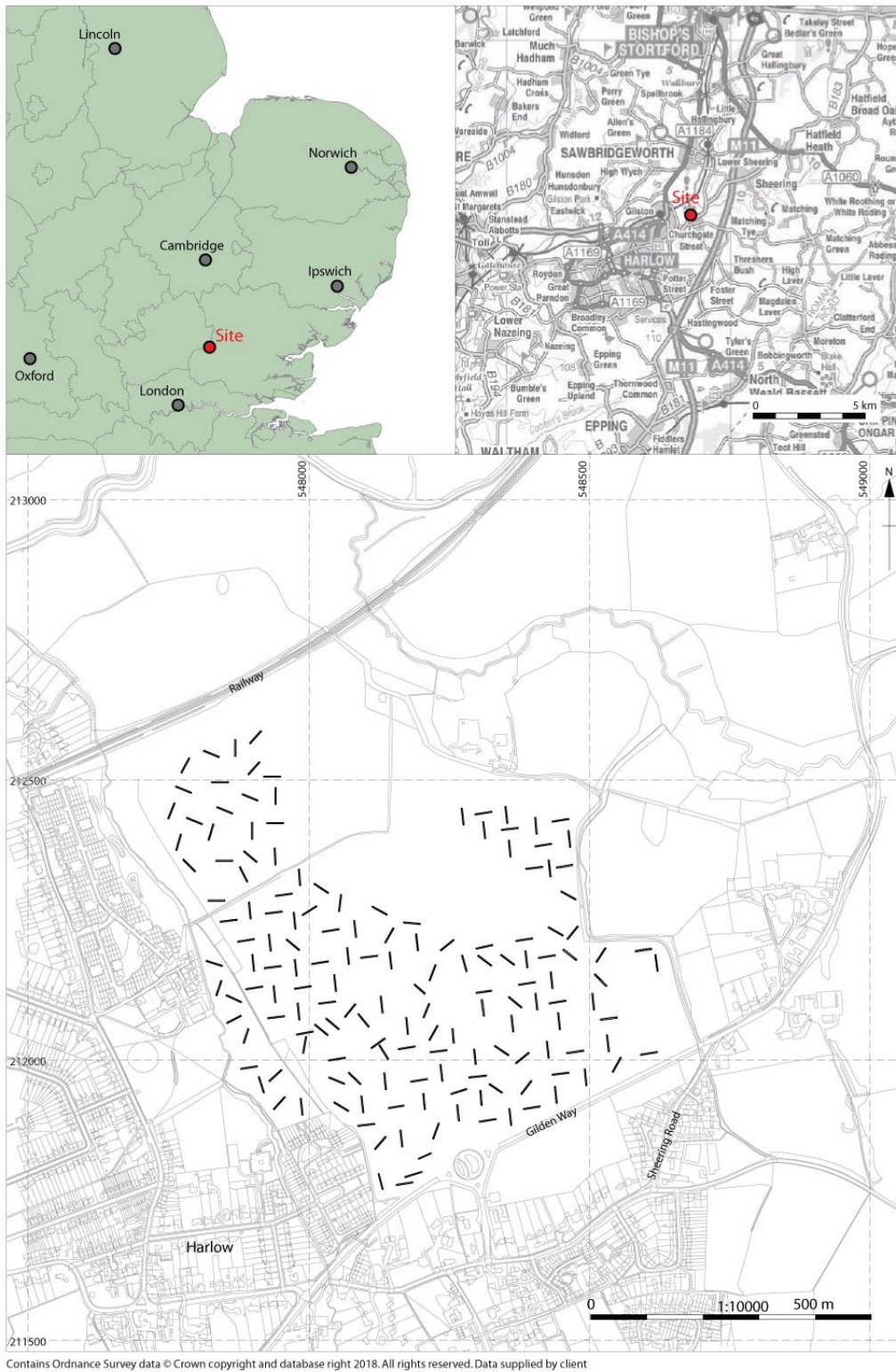
Figure 1: Location of the site at Land off Gilden Way, Harlow, Essex showing distribution of the archaeological trenches (figure adapted from Oxford Archaeology East, 2018).