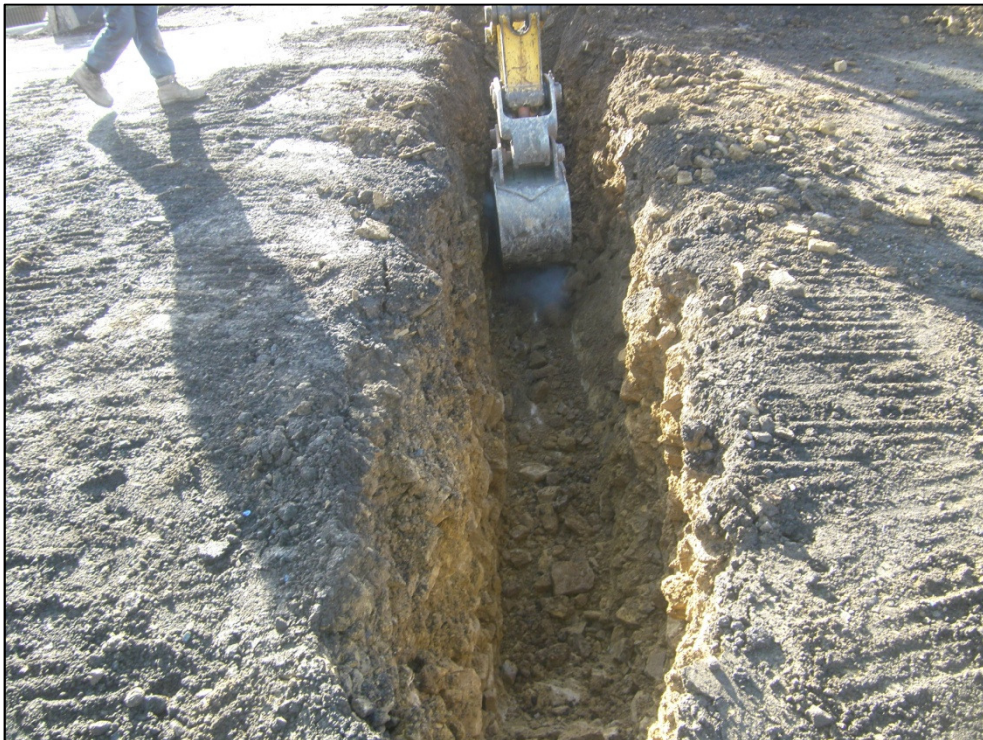
Plate 2: Further service trench excavated to the depth of adjacent manhole.