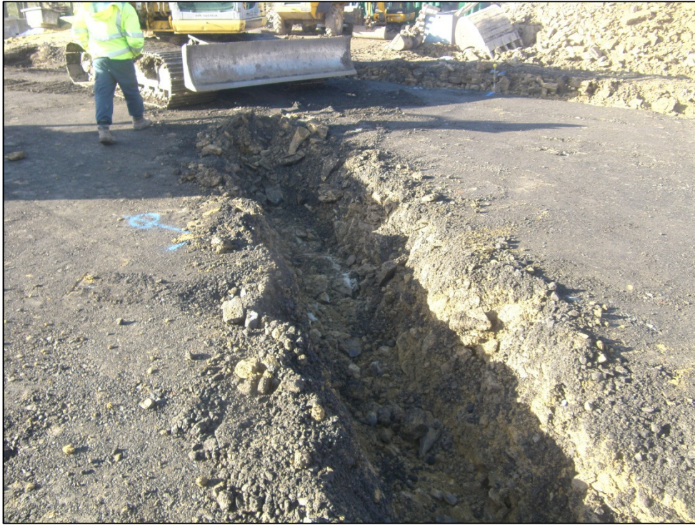
Plate 1: Service trench cut through fragmented bedrock.