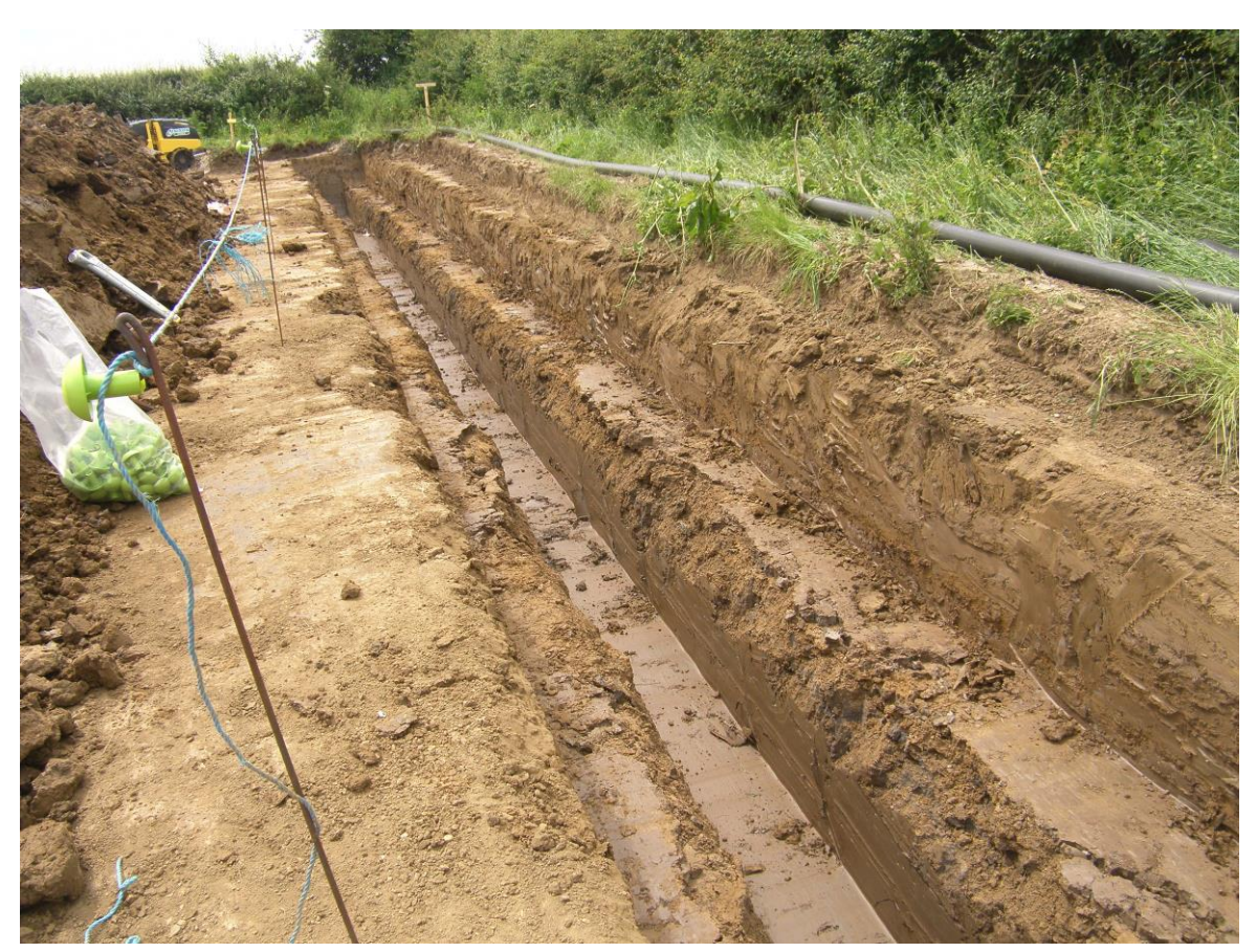
Plate 2. Sample section of pipe trench showing boulder clay

All finds derived from the topsoil (Appendix A). These included a small assemblage of Roman pottery (Appendix B) centred on SE 61581 57294, one piece of worked jet (Appendix C; Plate 3) at SE 61454 57562, and a mixed assemblage of animal bone, clay pipe stem, medieval, post-medieval, 18th to 20th-century pottery, and broken glass bottle and bowl fragments. The later material appeared to have been dumped in the topsoil, possibly during early 20th-century use of night soil for manuring.