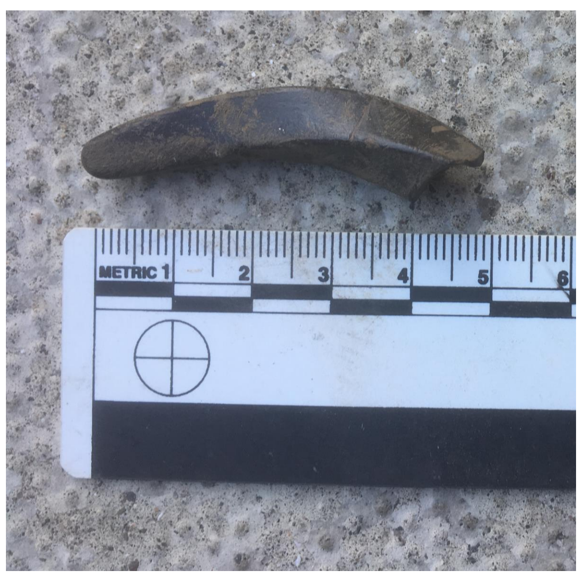
Plate 3. Jet object