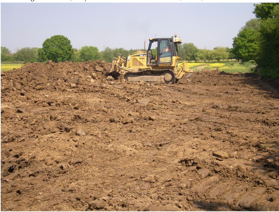
Plate 1. Bulldozer stripping topsoil

The second area of excavation was located close to the hedge-line adjacent to Landing Lane, extending for 394m south-westwards then turning eastwards for 253m towards the river Foss. The topsoil was initially stripped to a width of 9m using a bulldozer (Plate 1); the pipe trench was excavated by 360° excavator with a 1.5m-wide ditching bucket, with a variable depth of up to 1.8m. Excavation for the pipe trench (614m) revealed no archaeological features, only undisturbed natural substrate (Plate 2).