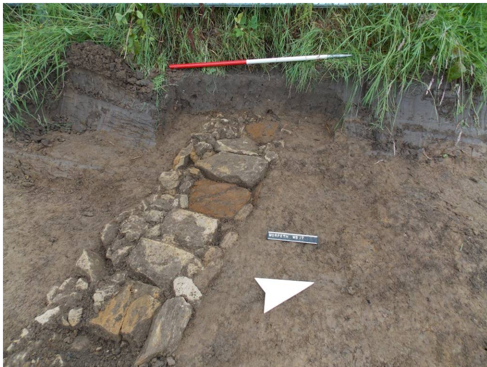
Plate 1: stone culvert uncovered in 2017

Archaeological Services Durham University (2011b), Loansdean, Morpeth, Northumberland Archaeological Evaluation Report 2751 unpublished report