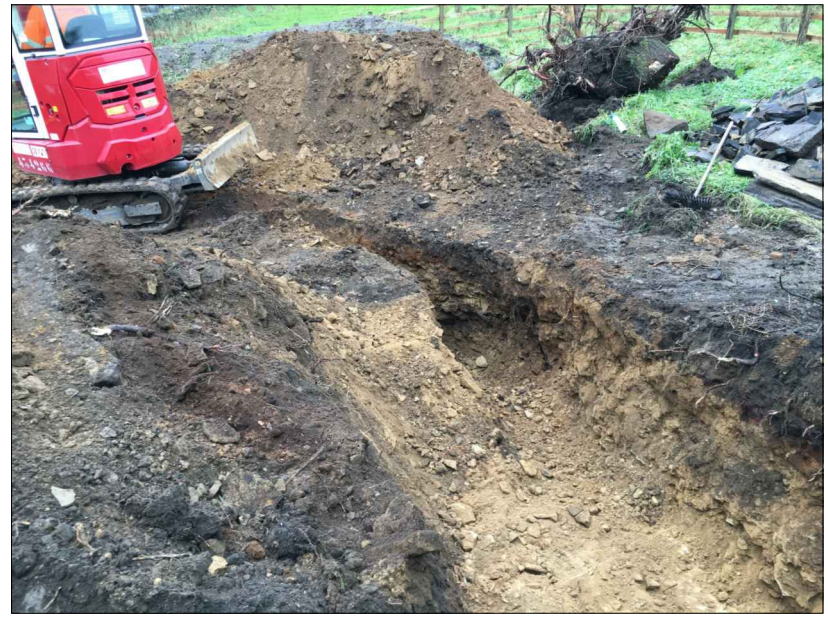
Plate 3: pipe trench in field showing topsoil over natural Ryecroft Road, Hainworth, West Yorkshire: plates