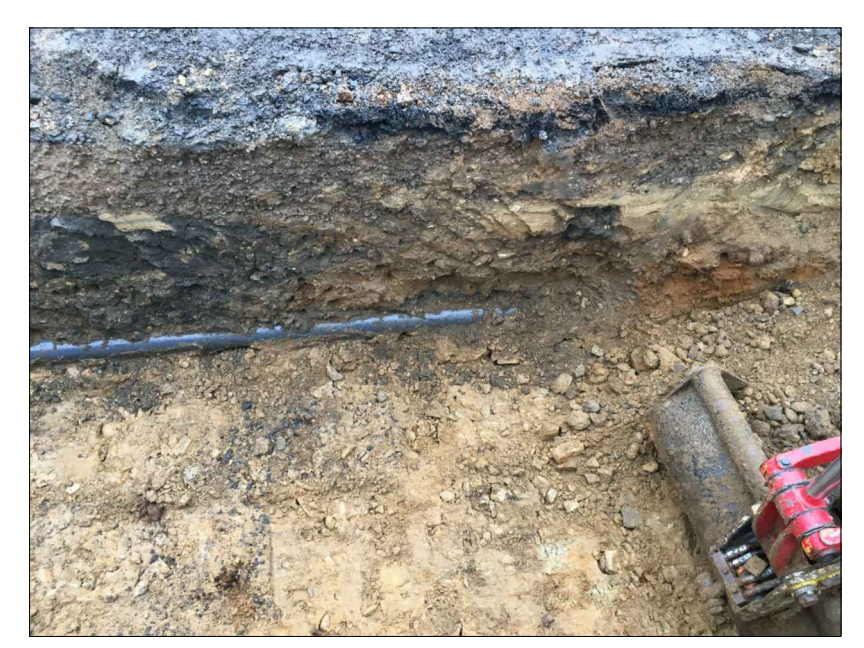
Plate 1: sample section of road trench showing depth of disturbance