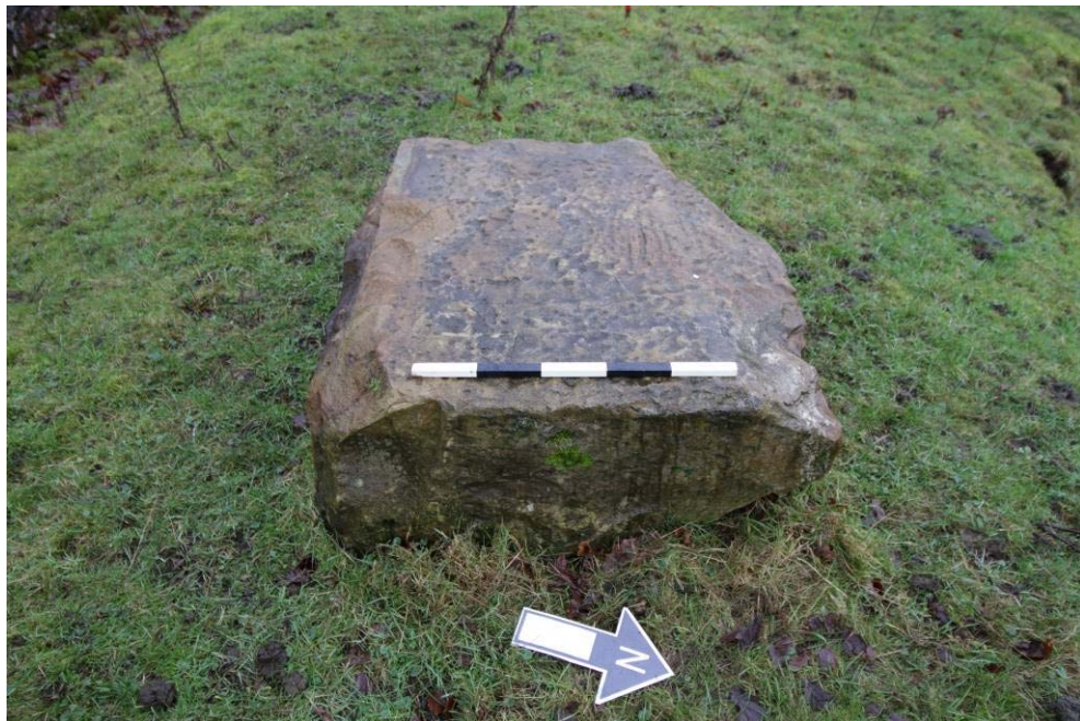
Plate 4: Site 3, stone at the east end of Site 3, facing west