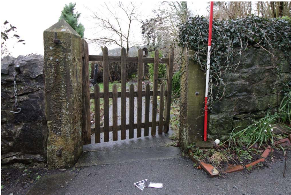
Plate 10: Gate to private garden on the route (to be removed)