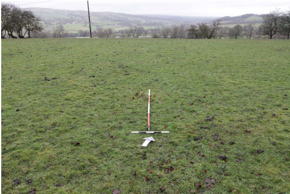
Plate 5: Site 4 ridge and furrow cultivation, facing north