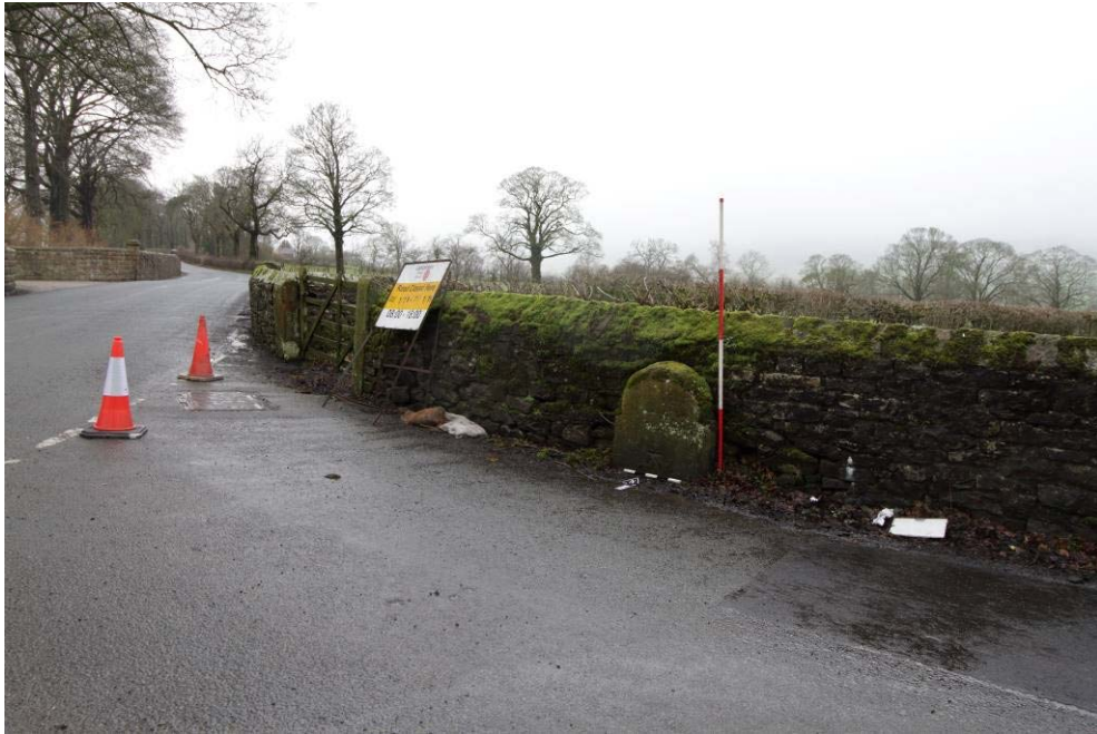
Plate 11: Site 9, Location of Grade II Listed milestone, facing west (the proposed track lies on the other side of this wall)