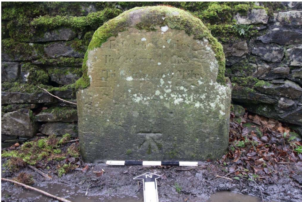
Plate 10: Site 9, Grade II Listed milestone (1164069), at the junction of Chatburn Road and Green Lane, facing north