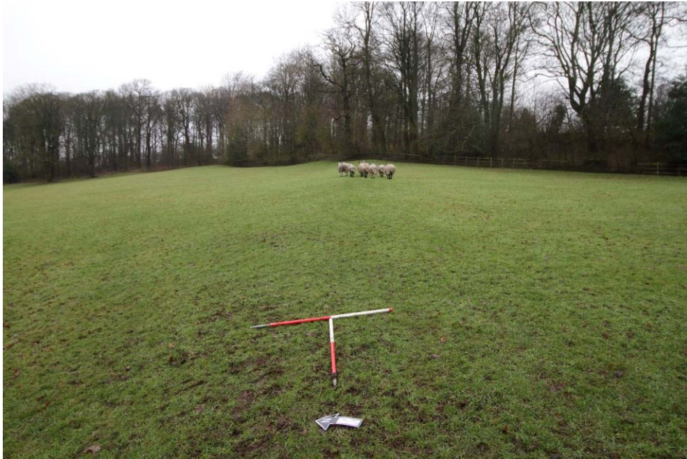
Plate 9: Site 8, line of Roman road from Ribchester to Ilkley, facing east (the sheep are walking up the road)