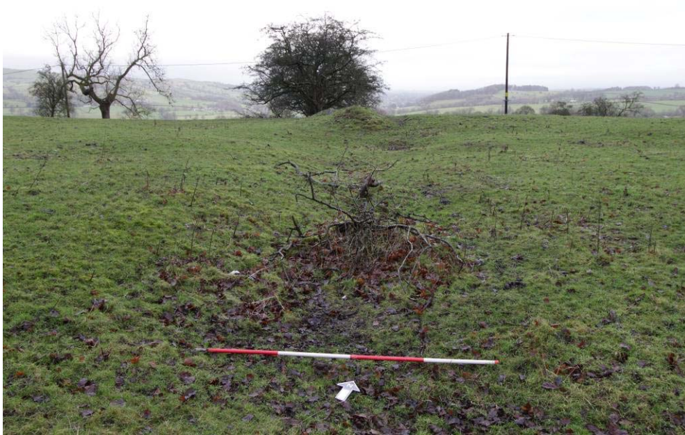
Plate 6: Site 5, relict field boundary, facing north