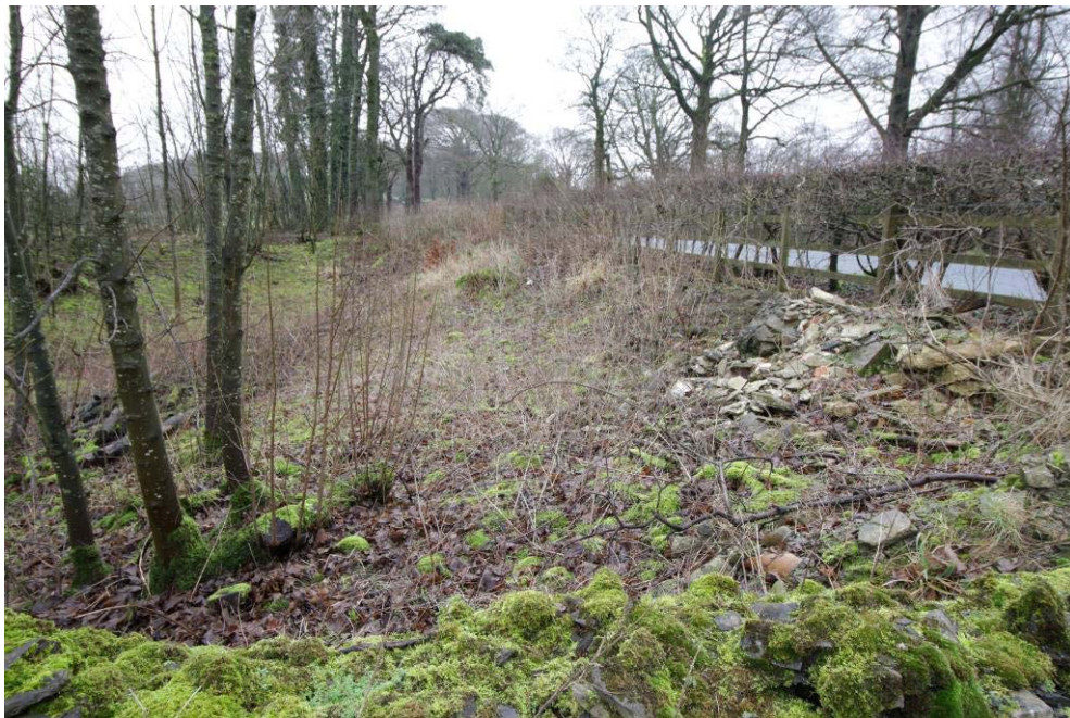
Plate 8: Site 7, possible site of archery butts (PRN34953), facing east