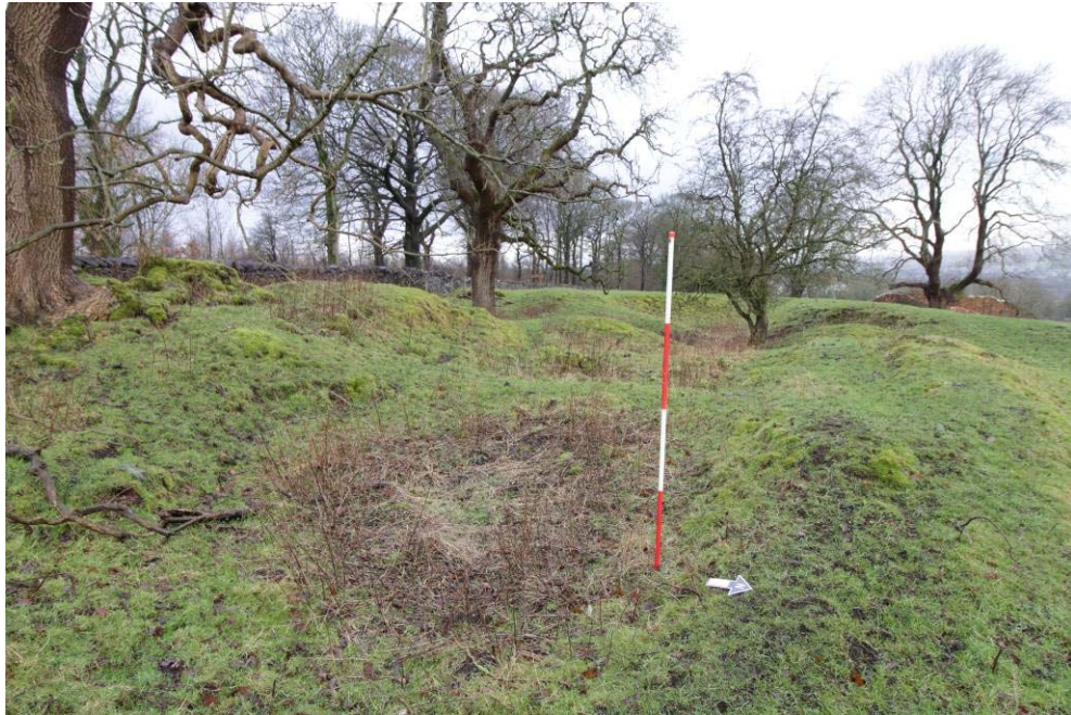
Plate 3: Site 3, quarry, facing west