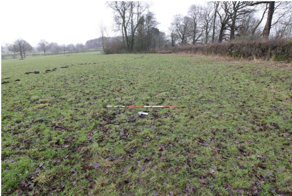
Plate 7: Site 6, shallow depressions to the west of PRN34953, facing east