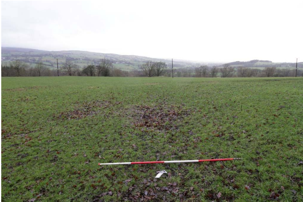
Plate 1: Site 1, relict field boundary facing north