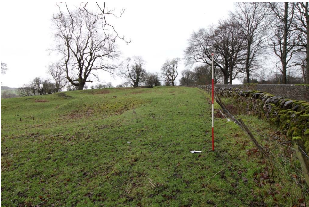
Plate 2: Site 3, quarry, facing east