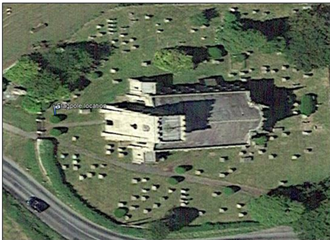
Figure 2. Flagpole location indicated on GoogleEarth image