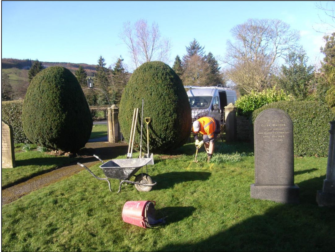
Plate 1: location of excavation close to west gate of churchyard