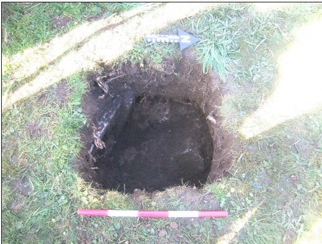
Plate 2: part-excavated hole showing limestone blocks