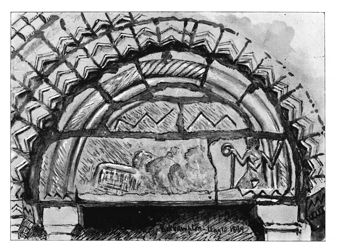
THE TYMPAN CYMPS - 0 R2 HPK BYN HI 1992 ON CHURCH.