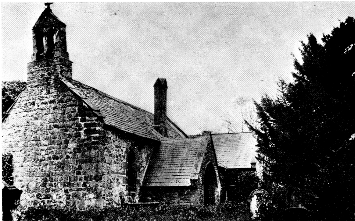
PLATE I.—ALLHALLOWS OLD CHURCH (Before demolition of nave and south aisle in 1935).