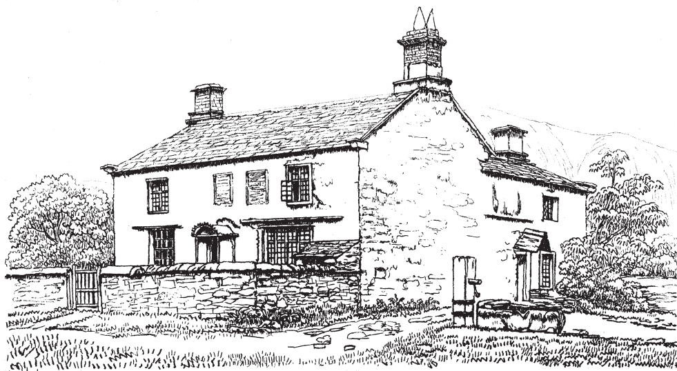
FIG. 2A. Monk Hall farmhouse drawn by William Green, 1819 (original size 21 x 15 cm)