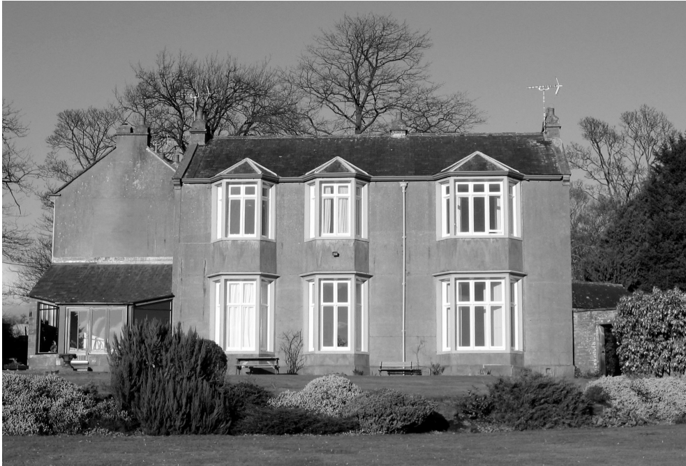
PLATE 2. Carleton Hill, Penrith – south front.