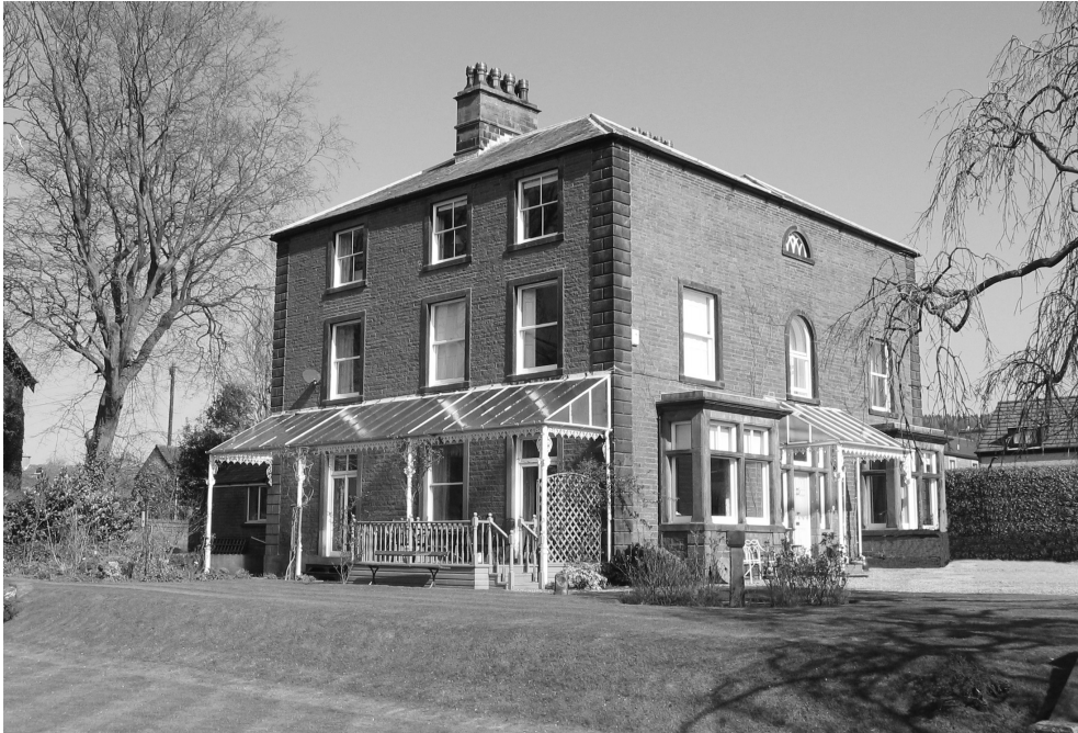
PLATE 3. Barco Hill, Penrith – from the south-west.