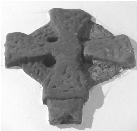
FIG. 9. Gosforth master, cross fragment ( Corpus Gosforth 3), middle tenth century. St. Bees sandstone. 61 x 48 x 13(?)cm. St. Mary's, Gosforth, Cumbria.

head at Gosforth ( CASSS Gosforth 3) suggests that a second tall cross did exist. 25 (Fig. 9)