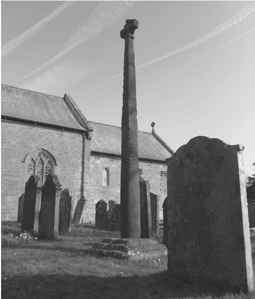
FIG. 2. Gosforth master, Cross ( Corpus Gosforth 1), middle tenth century. St. Bees sandstone. 436 (h) x 102.5 (c.) cm (without base). St. Mary's, Gosforth, Cumbria.

Strathclyde; no definitive information survives for the west coast. This absence of information allows us to conclude that no major political or religious centre existed in west Cumbria that would have garnered mention in the annals. Neither was the region a particularly contested one from the perspective of contemporary historians responsible for the regional annals, who did record political changeovers in such places as Dublin and York. Archaeological evidence of the Viking Age is also limited. 9 Pollen analysis from northern samples suggests woodland regeneration, which implies a declining population. 10