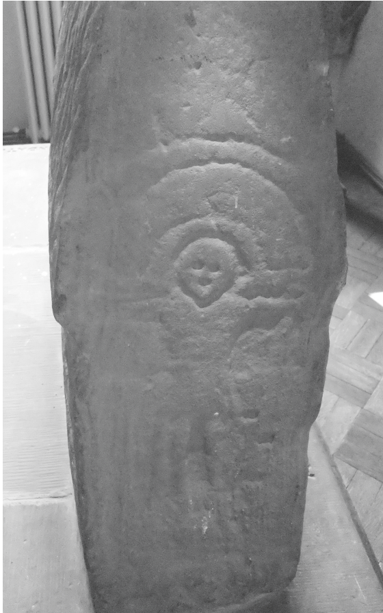
FIG. 12. Gosforth master, detail of east gable end of 'Saint's Tomb' hogback, ( Corpus Gosforth 5), middle tenth century. St. Bees sandstone. St. Mary's, Gosforth, Cumbria.

(Fig. 12) These crucifixions are poorly executed when compared to the depth and detail of carving on the hogback's broad sides. Previous scholars have assumed that these scenes are original to the monument and thus prove, along with a similar scene on the churchyard cross, that the community at Gosforth was Christian. 30 There is evidence to suggest, however, that these gabled ends may have been reworked.