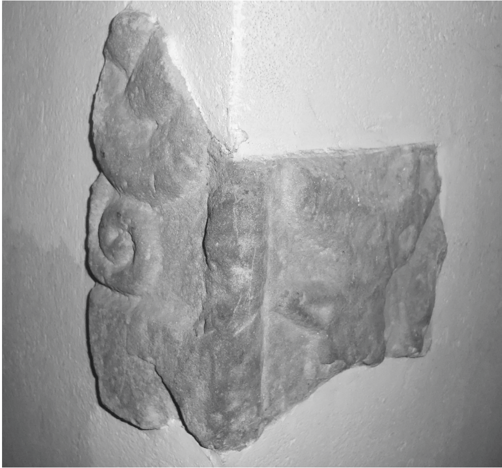
FIG. 1. Gosforth master, Sculptural fragment ( Corpus Gosforth 7), middle tenth century. St. Bees sandstone. 23 x 20 x 11cm. St. Mary's, Gosforth, Cumbria.

With regard to the Gosforth sculptures, Parker wrote, 'The Vikings erected nothing, their business was destruction ...' 6 We now know that this statement is inaccurate and that the Scandinavian peoples who first began to raid England and Ireland in the late eighth century had, by the early tenth century, established settlements throughout northern England, Scotland, and eastern and southern Ireland. 7 While archaeological evidence for Viking settlement in England is still thin, the sculptural and linguistic evidence is rich and indicates that these immigrants built permanent communities with a highly developed artistic tradition that combined with native traditions to create monuments distinctive to the pre-Conquest British Isles. 8