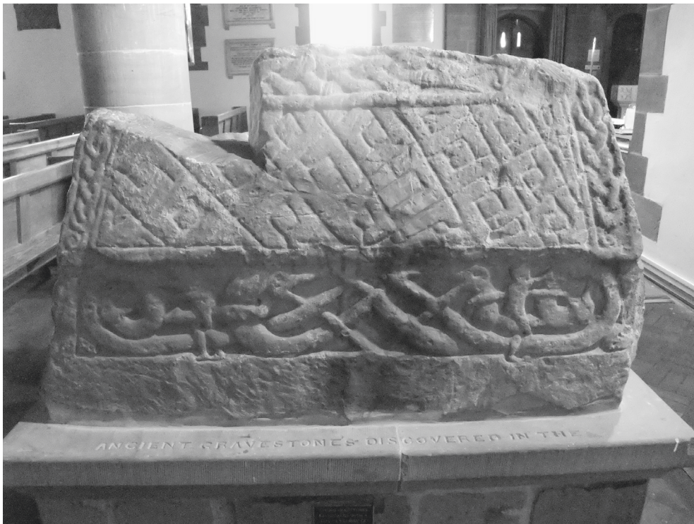
FIG. 3. Gosforth master, 'Saint's Tomb' hogback, ( Corpus Gosforth 5), middle tenth century. St. Bees sandstone. Average dimensions 157 x 75 x 25cm. St. Mary's, Gosforth, Cumbria.

The tenth century was a dynamic time for the British Isles. 18 While coastal Cumbria was hardly in the thick of things, the region did see an influx of settlers not only from the Isle of Man, but also from Dublin, the Danelaw (these mostly concentrated in the Eden Valley) and the Scottish Isles. 19 This is the political situation that gave rise to the settlement at Gosforth and was a factor in the creation of the sculptural group there. Despite the political instability, the North of England saw an explosion in the numbers and types of freestanding sculpture in the tenth century and Gosforth was very much a part of that movement. Inspired by earlier Anglian monuments, Viking artists created crosses, hogbacks, and architectural decoration for new and established communities alike. Gosforth's sculptural group is already important within the context of pre-Norman English art, but it can be better understood with a more accurate assessment of Gosforth's smallest fragment.