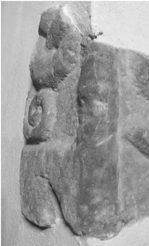
FIG. 6. Gosforth master, detail of fragment, left face ( Corpus Gosforth 7), middle tenth century. St. Bees sandstone. St. Mary's, Gosforth, Cumbria.