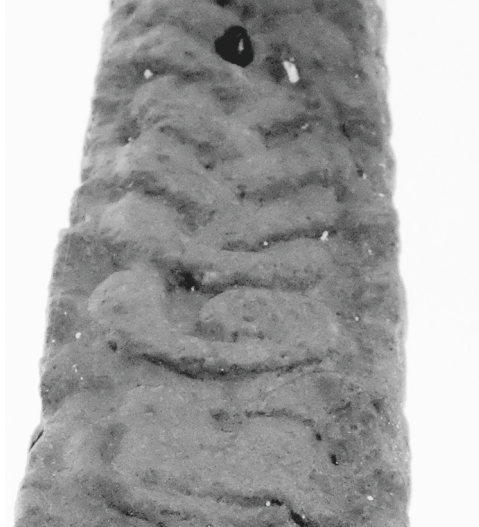
FIG. 5. Gosforth master, detail of cross, upper south face ( Corpus Gosforth 1), middle tenth century. St. Bees sandstone. St. Mary's, Gosforth, Cumbria.