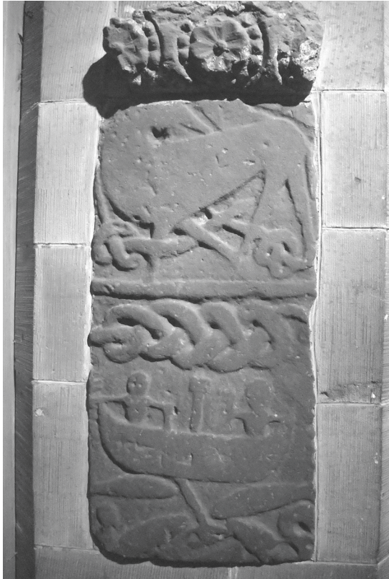
FIG. 8. Gosforth master, 'Fishing Stone' ( Corpus Gosforth 6), middle tenth century. St. Bees sandstone. St. Mary's, Gosforth, Cumbria. 70 x 33 x 14cm.