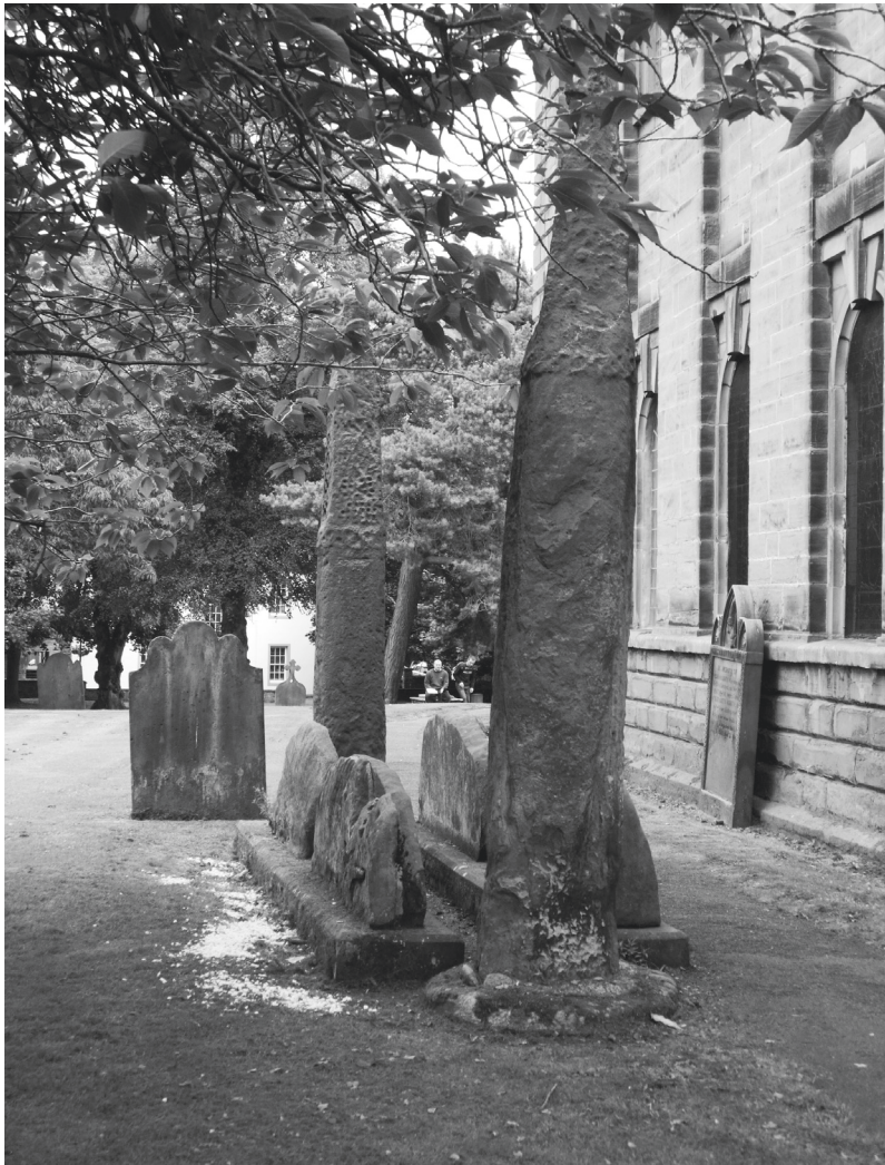
FIG. 13. 'Giant's Grave', ( Corpus Penrith 3-7), early tenth century. Sandstone. St. Andrew's, Penrith, Cumbria.

The presence of interlace on the right face of Gosforth 7 also lends some evidence to the debate about the possible relationship of hogbacks and crosses. James Lang argued that hogbacks may have been arranged with at least one cross abutting a gabled