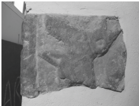
FIG. 7. Gosforth master, detail of fragment, right face ( Corpus Gosforth 7), middle tenth century. St. Bees sandstone. St. Mary's, Gosforth, Cumbria.