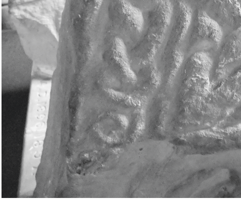
FIG. 4. Gosforth master, detail of 'Saint's Tomb' hogback, ( Corpus Gosforth 5), middle tenth century. St. Bees sandstone. St. Mary's, Gosforth, Cumbria.