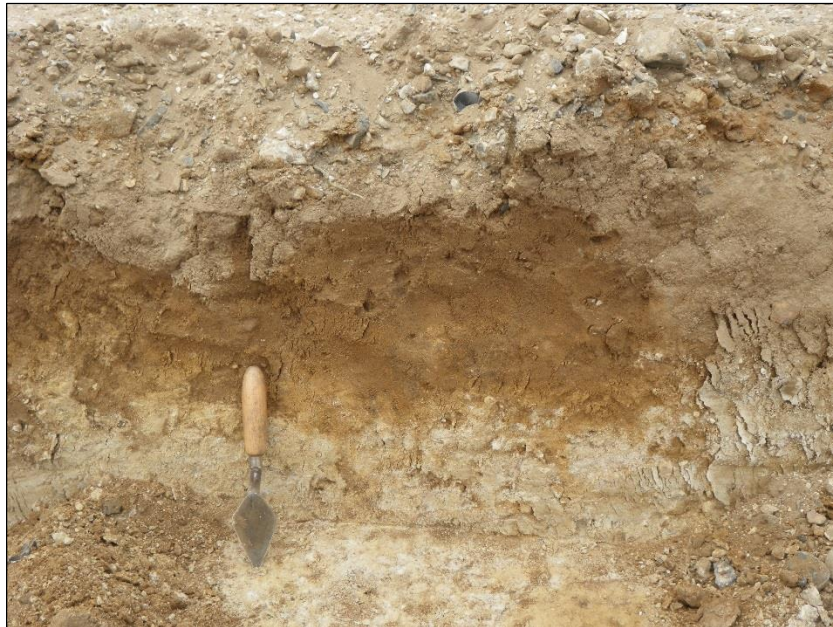
Plate 1. Representative section along southern edge of road strip.

Due to previous development on the site there was no surviving topsoil along the roadway. The stratigraphy encountered consisted of between 0.2m and 0.25m of mid brown silt subsoil above slightly weathered chalk deposits. At the deepest point (the southern edge of the new road strip) the road was stripped to a depth of approximately 0.4m with a recorded stratigraphy of 0.2m of subsoil over 0.2m of chalk. No archaeological deposits were noted during the monitoring visits, though several modern features were noted (drainage/service runs, soakaways and building foundations) all containing modern brickwork, plastic, broken tarmac or similar items.