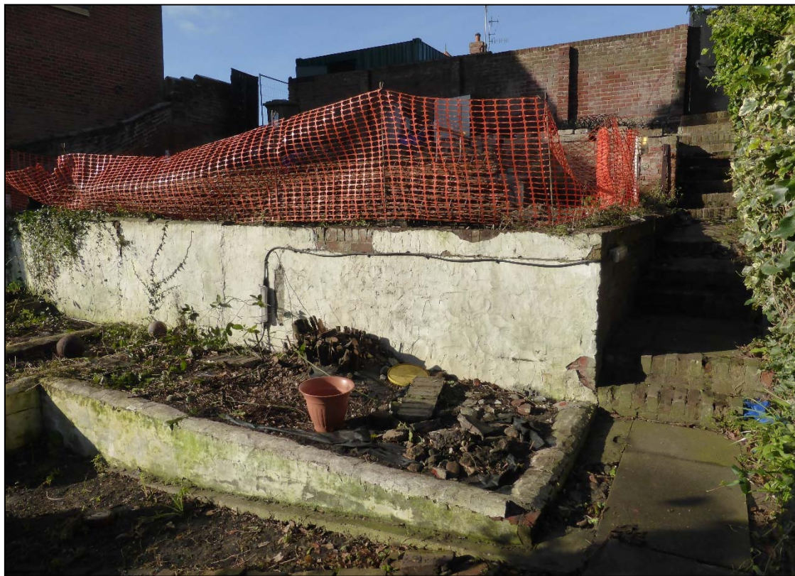
General view of site prior to construction showing the existing terraces, camera facing west

The proposed development was to be constructed on a piled foundation with internal floors on two main levels that, on the whole, followed the existing terraces. Discussions with the on-site piling contractors indicated that other than the drilling for the piles there would be very little excavation work involved in the proposed construction. The piles were to be close set to form substantial retaining walls with infilling behind. The main groundworks would therefore consist of the removal of a series of low brick walls and levelling on the existing upper terrace to create access for a small piling rig. This work was monitored but only late post-medieval deposits were encountered. The boring of a limited number of piles was also monitored, which suggested the existing terraces were formed through the deposition of material behind 19th century, or later, brick retaining walls. Spoil from other pile bores was also examined but no pre-modern artefacts were identified.