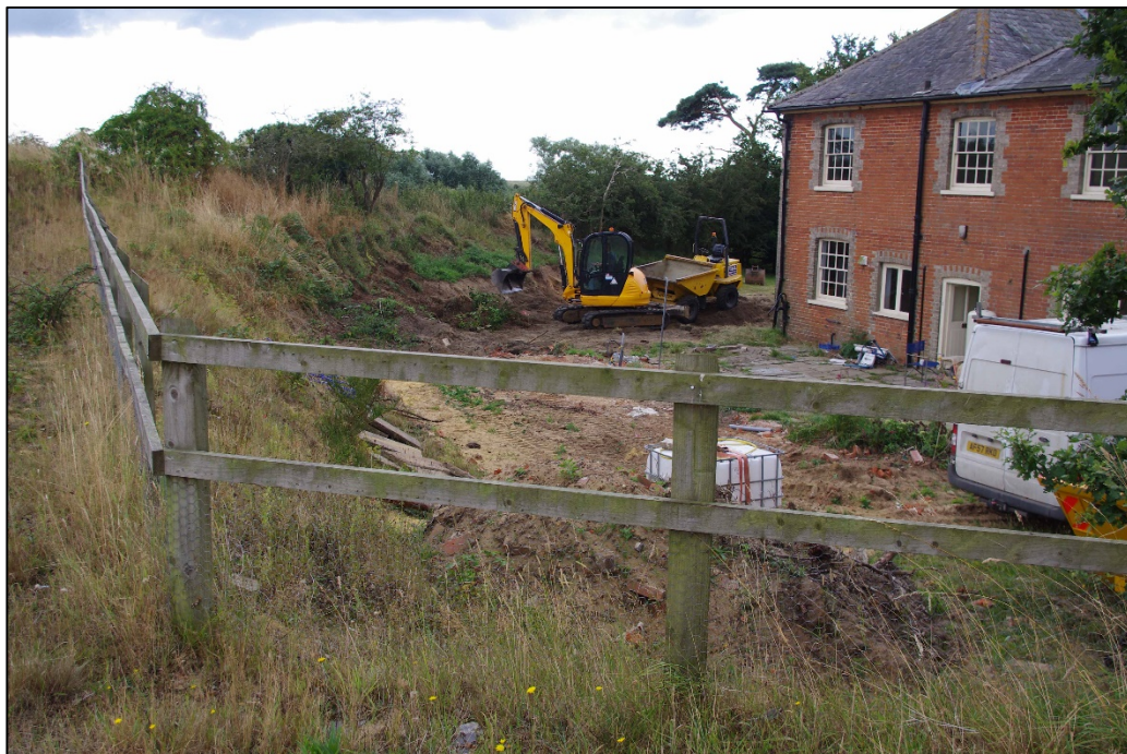
Plate 2. General site view showing house within quarry pit (facing southeast)