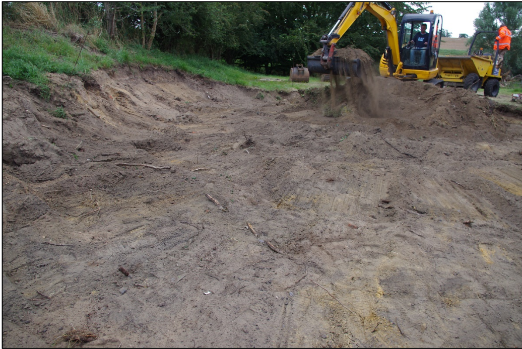
Plate 1. Stripped soil level to the side of the house (facing south)