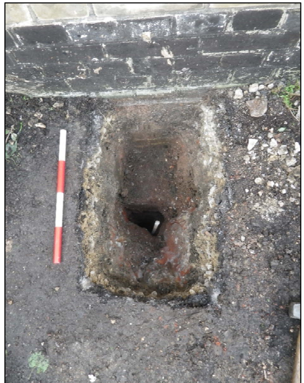
Plate 4. Test Pit 2, looking south