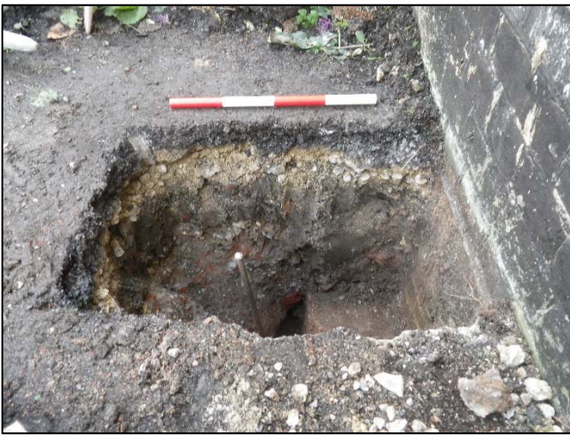
Plate 3. Test Pit 2, looking east