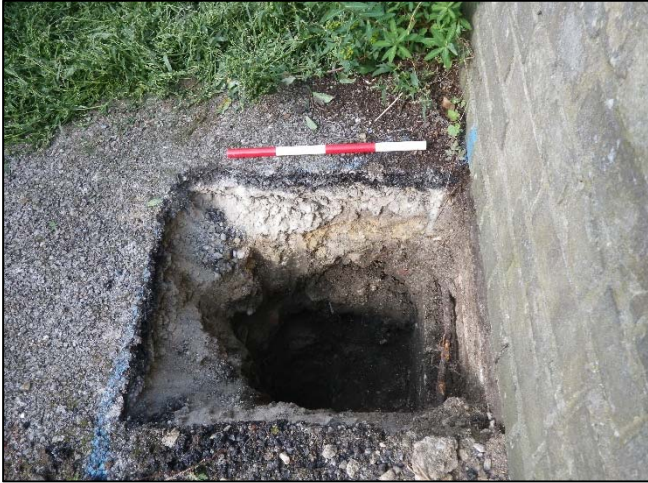
Plate 1. Test Pit 1, looking west