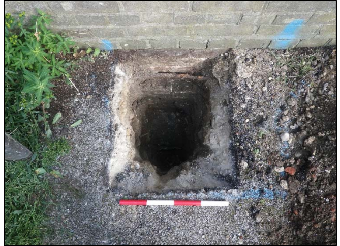
Plate 2. Test Pit 1, looking north