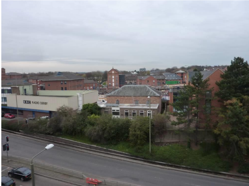
Figure 3. The meeting house (centre) and its setting