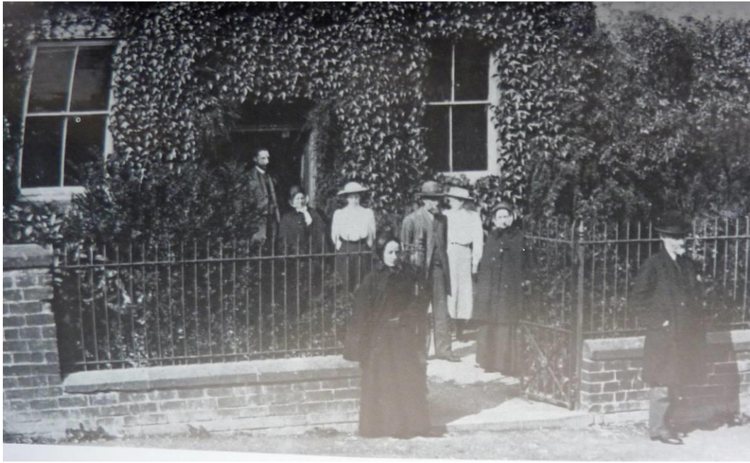
Figure 1. The meeting house in c. 1908.