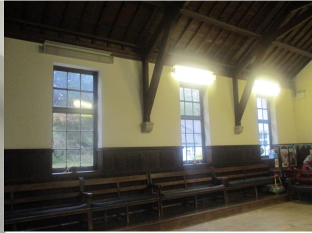
Figure 2: Simmons & Son clock, Devonshire House Figure 3: Benches in the meeting room