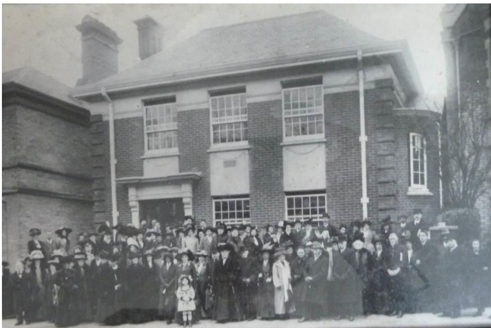
Figure 2: The former meeting house of 1912

In 1964, the meeting house in Avenue Road was acquired by Marks & Spencer who redeveloped the site in return for paying for a replacement building in Wharncliffe Road, Boscombe. (Apparently, no money changed hands during the transaction.) This, the current meeting house, was built by the architects Dexter & Staniland in 1964 and opened on 20 June that year (figure 3).