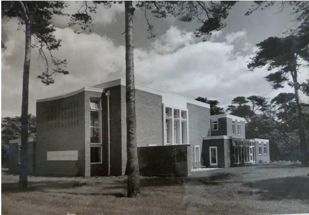
Figure 3: The new meeting house shortly after completion in 1964