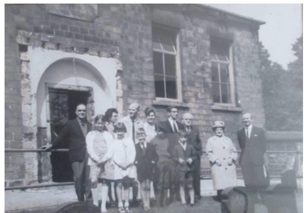
Figure 2: Two photographs of the meeting house built 1815, the left with porch, the right with the porch demolished, date unknown