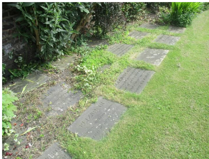
Figure 3: Relocated gravestones