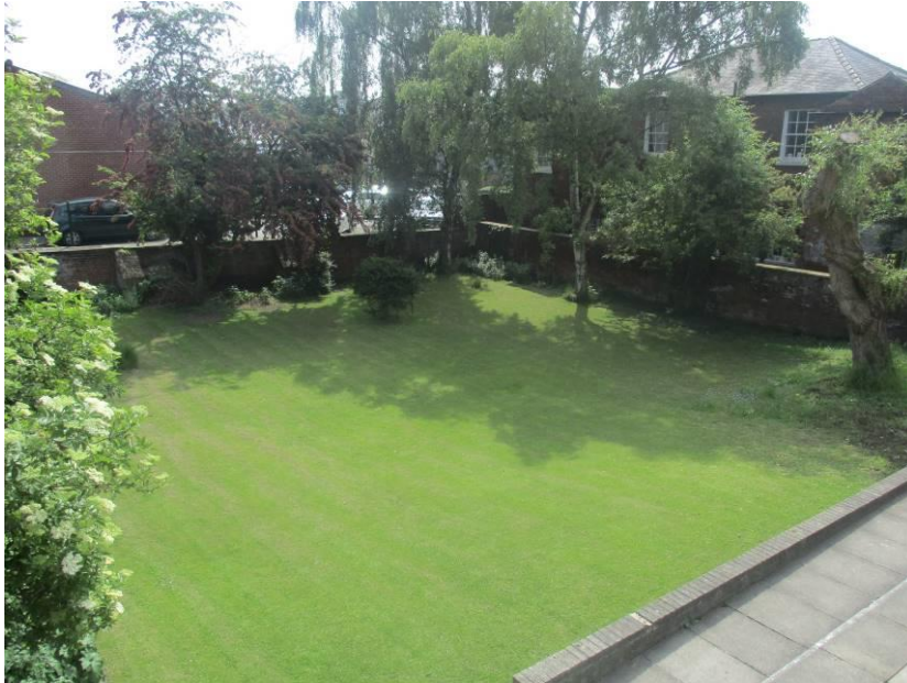
Figure 2: Burial ground

The burial ground is located to the east of the site. The burials cover a period approximately from 1826 to 1953. This is no longer used for burials but is still used for the scattering of ashes. Formerly, flat stones were laid in rows; however these were relocated to the perimeter in the 1960s (Fig.3). The burial ground is mainly laid to grass with low level planting and trees around the edge. The burial ground is enclosed by red brick walls dating from the nineteenth century.