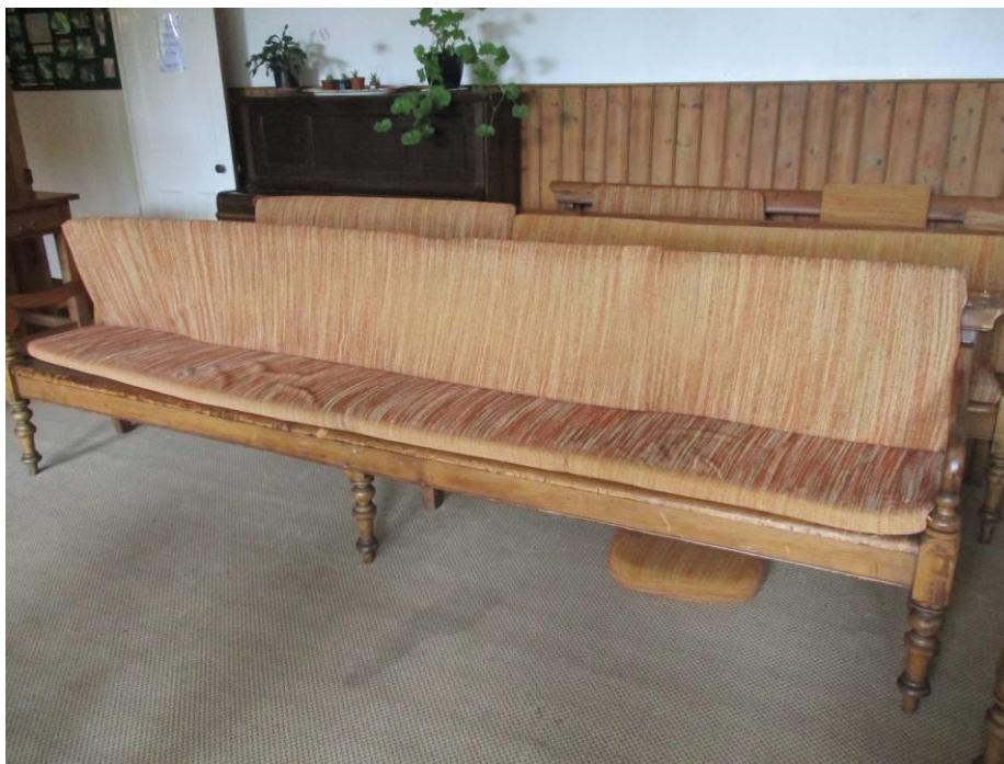
Figure 2: Open-backed pine benches in main meeting room

The foyer contains a table with inkwells associated with the building's use as an Adult School at the beginning of the twentieth century. In the meeting room is a centre table by Alan Grainger c.1970s. The seating consists of open-backed pine benches with turned front legs and arm supports, simple benches with shaped bench ends.