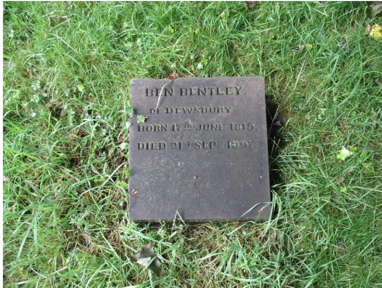
Figure 3: Example of flat gravestone