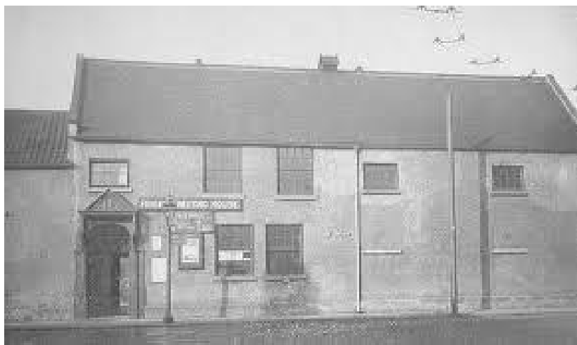
Fig.1: The meeting house on West Laith Gate before demolition in the 1970s (Balby meeting)