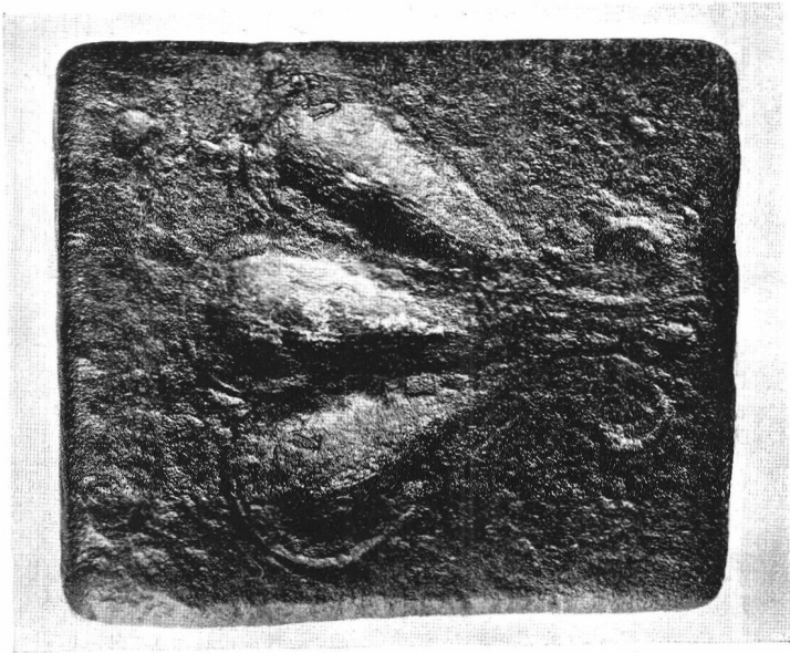
Fig. 1. Figured Bronze Plate.