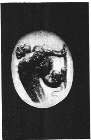
Fig. 2. Sphinx Seal.