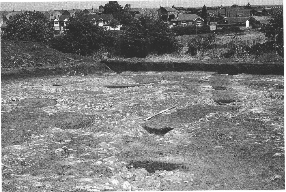
Plate 1: Excavation area, looking north-east.

survey. The features comprised a linear gully (F302.06), a scoop with a possible post-hole at its base (F301) and two shallow pits (F300 and F303) which, together, were thought to represent the remains of a settlement. All of the features were shallow, had weathered profiles, and were sealed by a layer of alluvium (3001). A struck flint flake, which was recovered from one of the pits (F300), probably dated the fill of that feature to the prehistoric period. The similarity of all four of the features in terms of form, fill and preservation, suggested that they were contemporary.