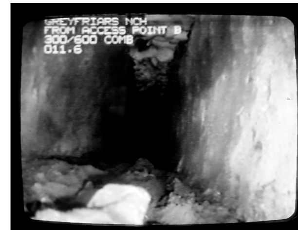
Plate 3.15 Interior view of Great Drain (10334)