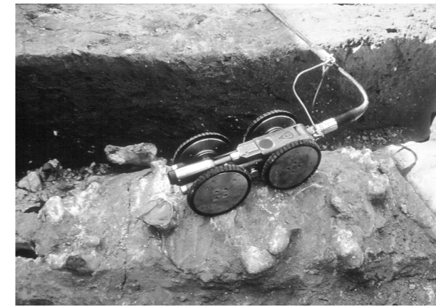
Plate 3.14 Crawler tractor unit on roof of Great Drain (10334)