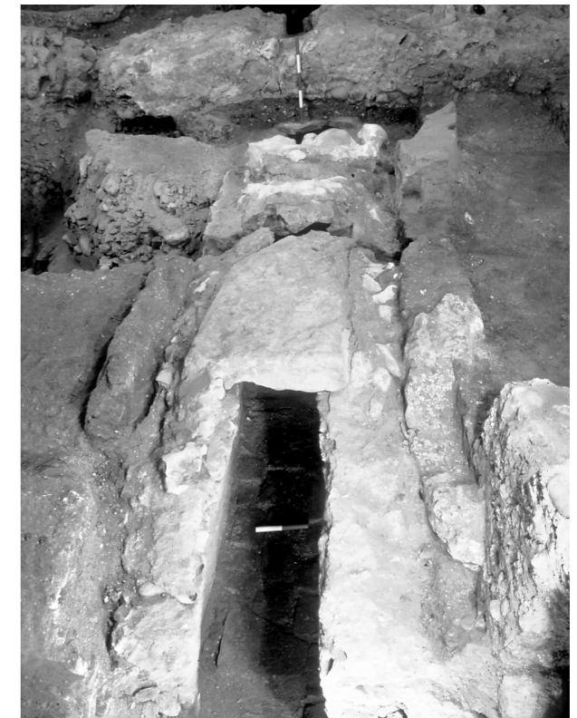
Plate 3.17 Western section of Great Drain looking east