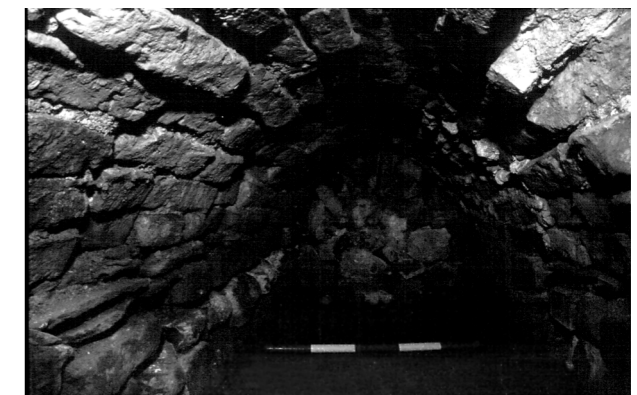
Plate 3.18 Interior view of Drain 10335 looking north