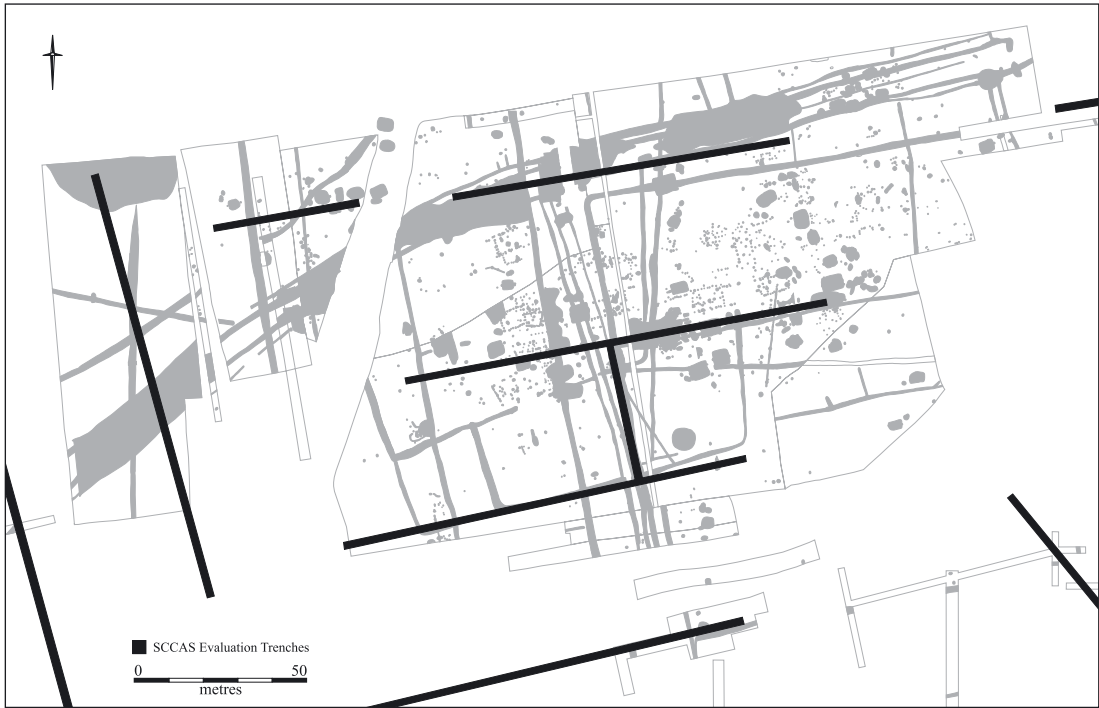
Figure 1.9 SCCAS evaluation trenches shown against CAU base plan