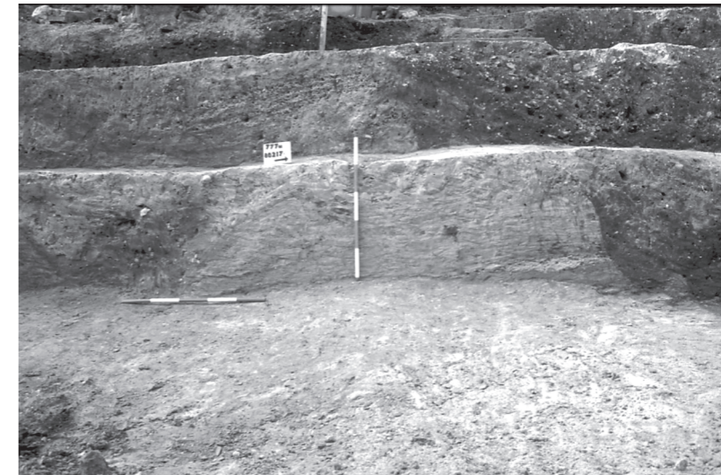
Plate 5.1 The ?Castle Fee ditch (Ditch 3) at its junction with the later south bailey ditch (Ditch 10) (Area 8), looking west