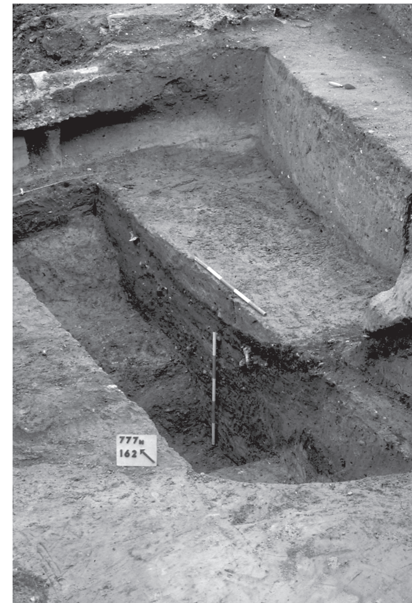
Plate 5.2 Basal fills of the ?Castle Fee ditch (Ditch 3), (Area 1, north-facing S.162)