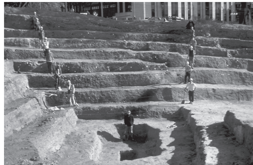
Plate 7.10 Profile of the barbican ditch in Area 9, looking north (Ditch 13, Period 4.2). The ditch survived to well over 20m wide and 10m deep. The majority of the infilling was of post-medieval date.