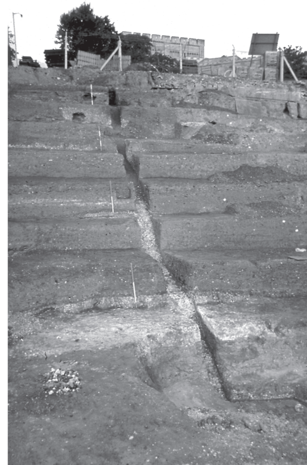
Plate 7.11 Profile of western side of Ditch 13 (barbican, Period 4.2), showing the castle keep in the background (Area 9)