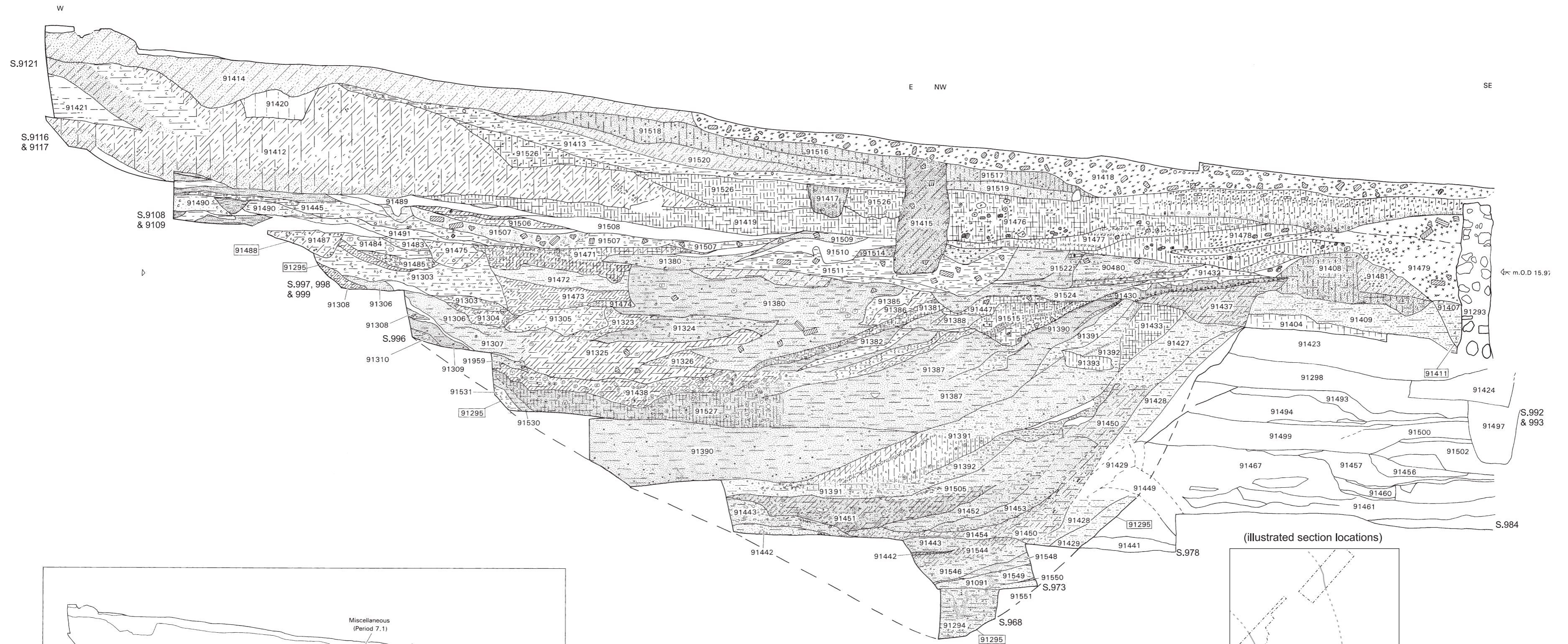
Figure 7.18 Period 4.2: Composite south-facing section across Ditch 13 (barbican) (Area 9). Scale 1:50