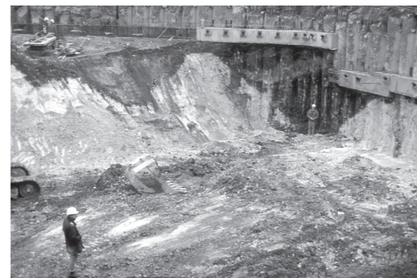
Plate 7.12 Profile of the barbican ditch on the pile line (Area 9), looking north-west