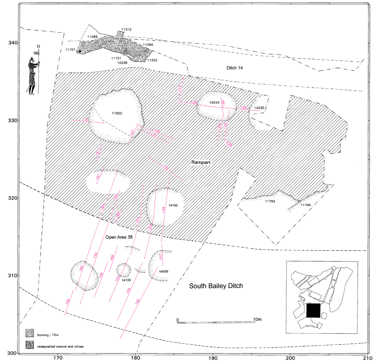
Figure 8.15 Period 5.1: Quarrying above south bailey ditch and rampart (Area 1) (?Castle Fee Property 49). Scale 1:300