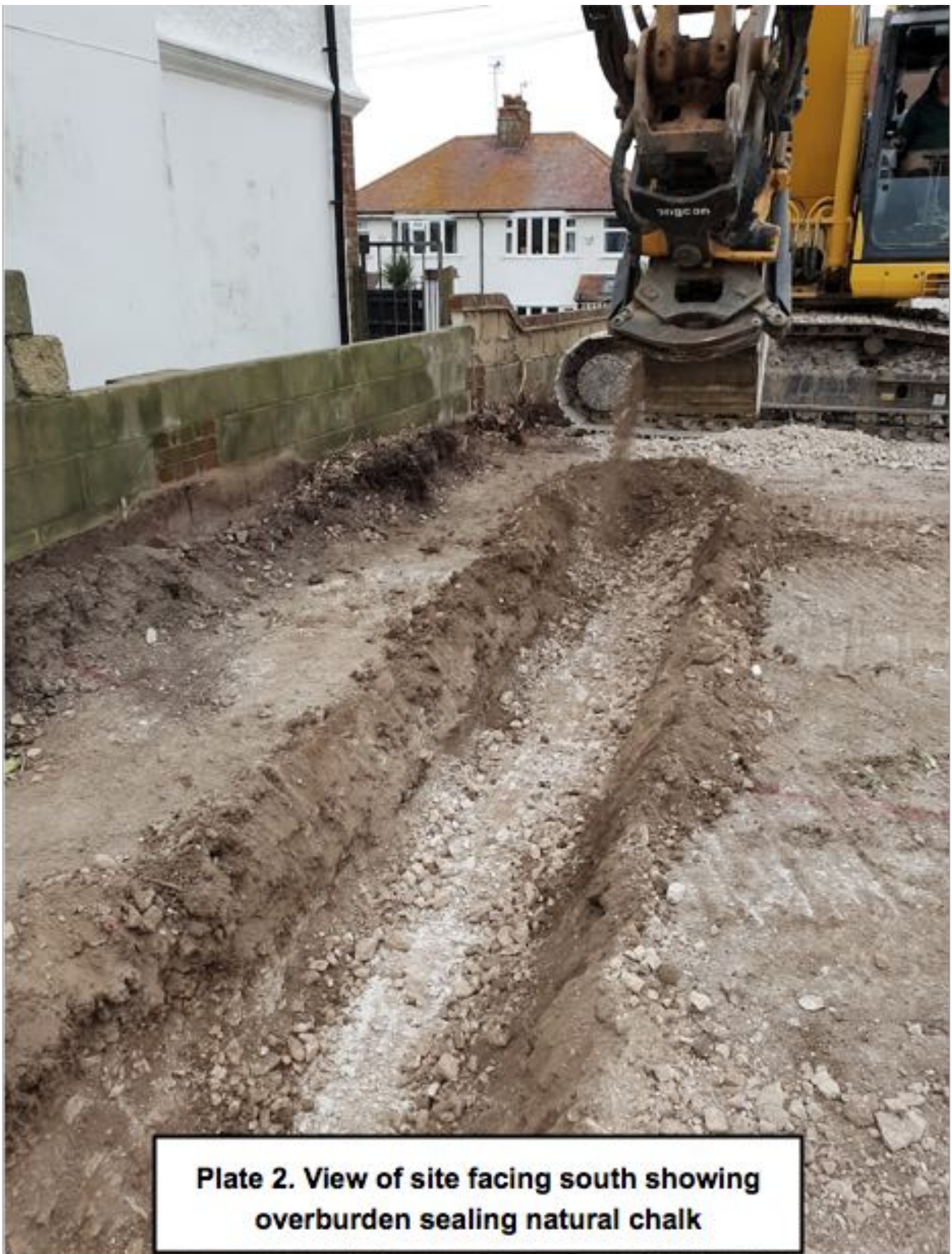
Plate 2. View of site facing south showing overburden sealing natural chalk