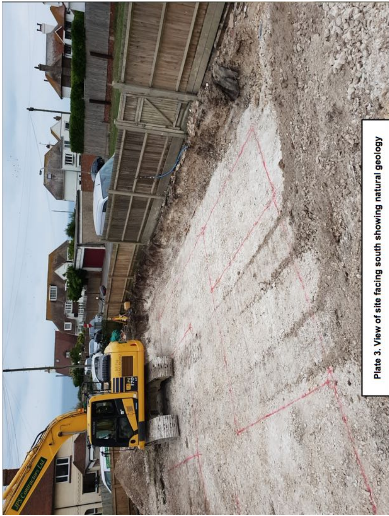
Plate 3. View of site facing south showing natural geology