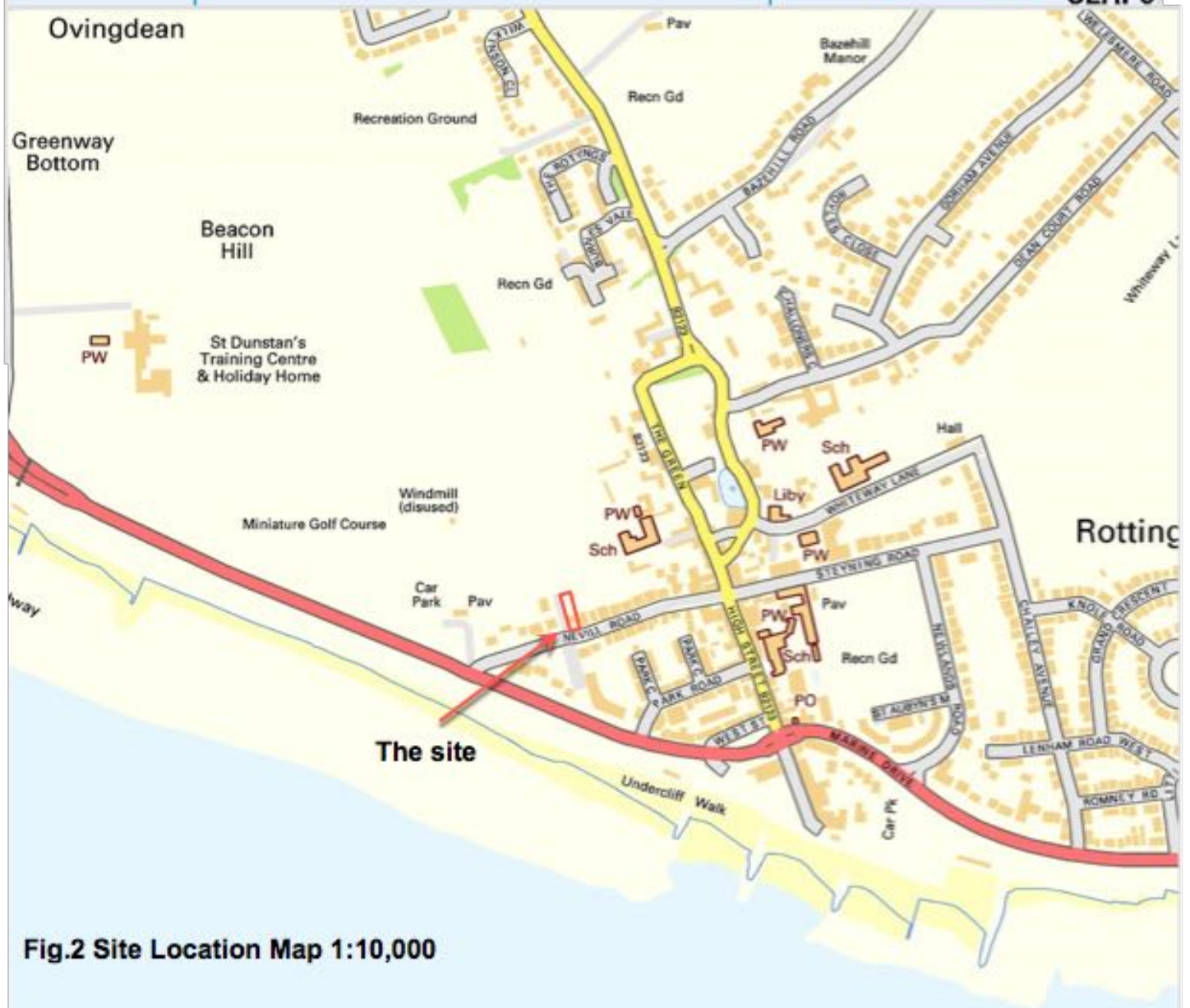
Fig.2 Site Location Map 1:10,000