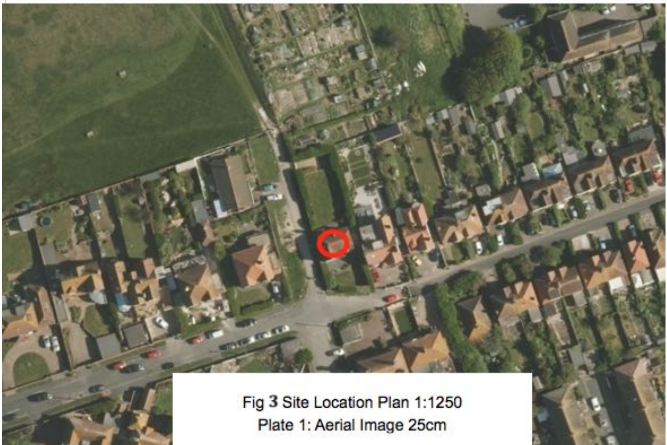
Fig 3 Site Location Plan 1:1250 Plate 1: Aerial Image 25cm