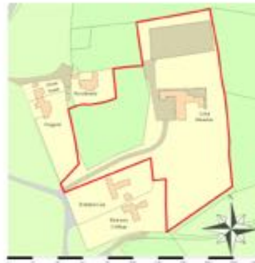
Scale: 1:2500 | Area: 4Ha | Grid Reference: 564223,201835 | Paper Size: A4