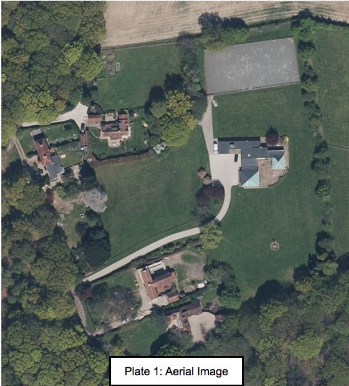
Plate 1: Aerial Image