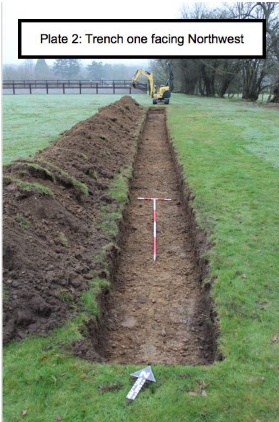
Plate 2: Trench one facing Northwest