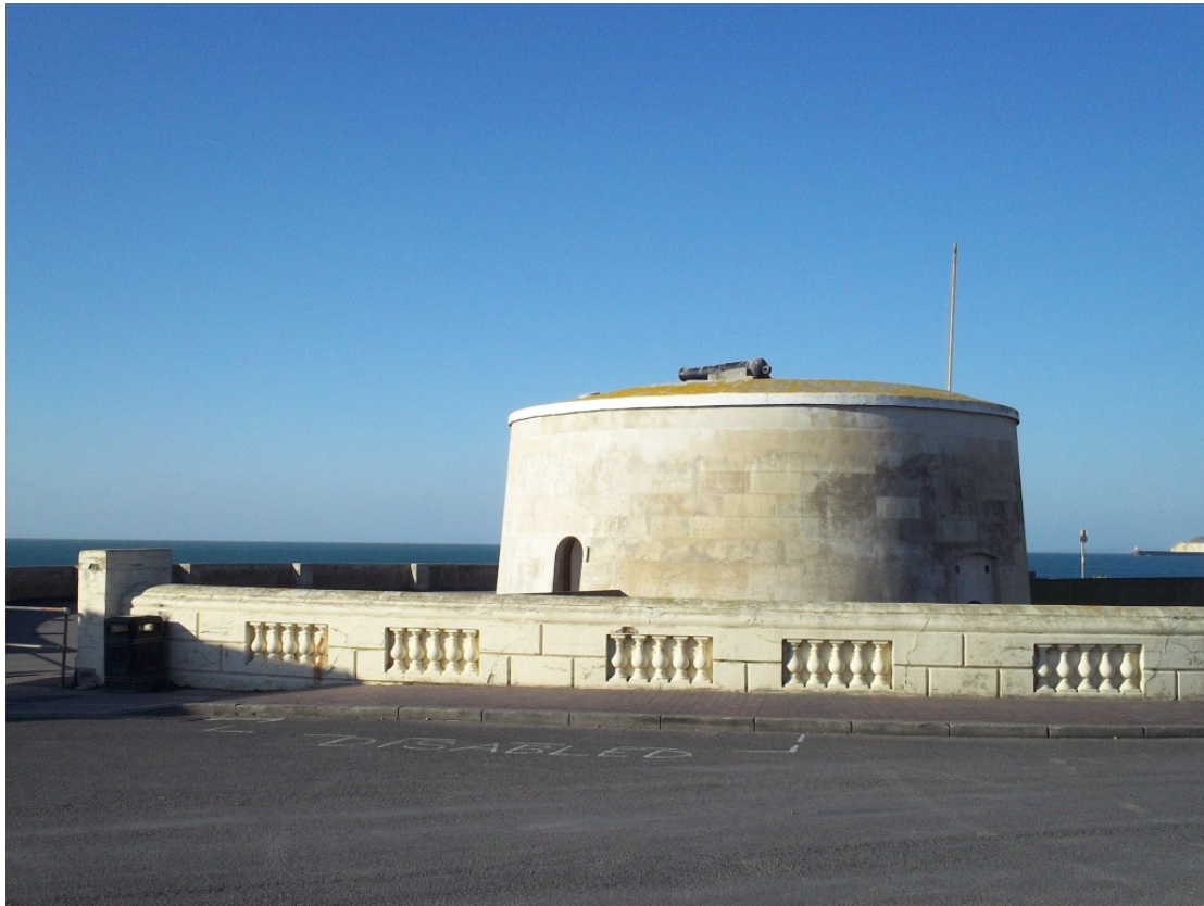
Plate 22. RSK ID V287. SM Martello Tower No. 74, Seaford.