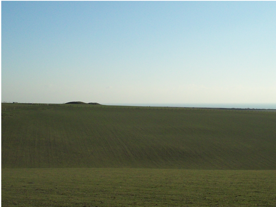
Plate 20. RSK ID V78. SM Lord's Burghs round barrows; part of shared setting with RSK ID 50 Firle Beacon