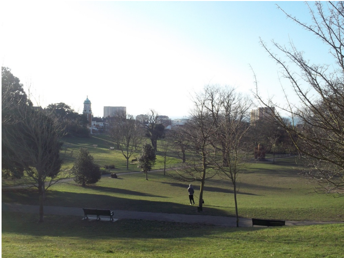
Plate 18. RSK ID V15. RPG Queens Park.