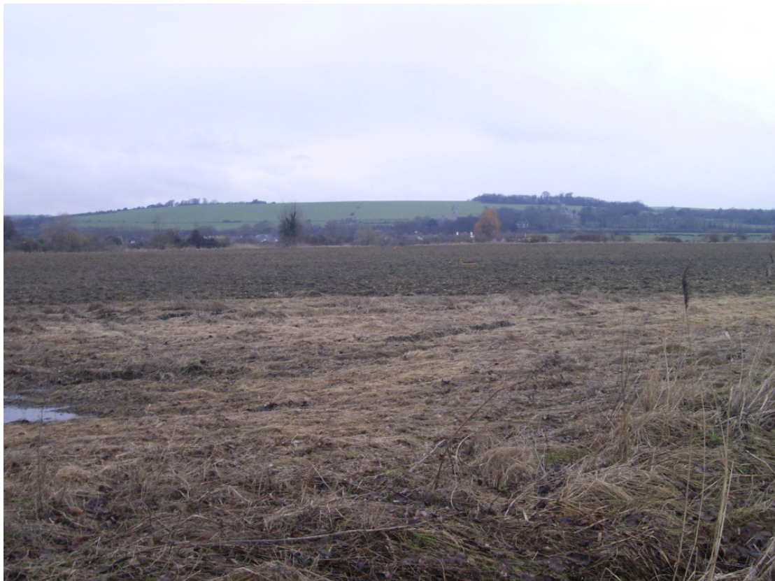
Plate 4. High-point RDX04/03. Overlooking former wetlands is considered suitable for prehistoric settlement.