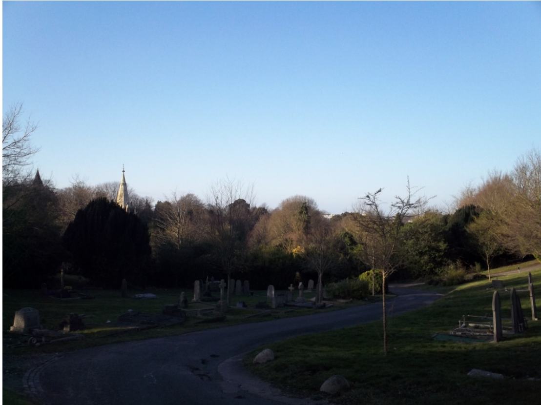
Plate 16. RSK ID V7. RPG Woodvale Cemetery.