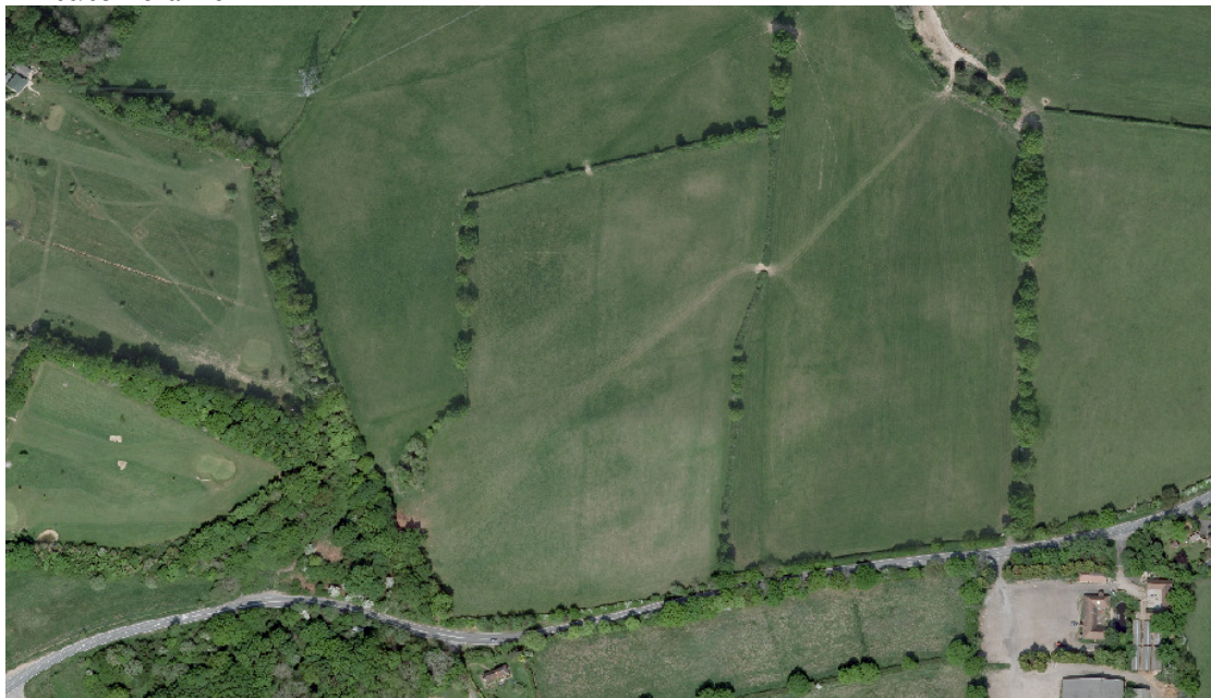
Plate 14. RSK ID 202. Crop marks of former field system. RDX11/01. Aerial View.