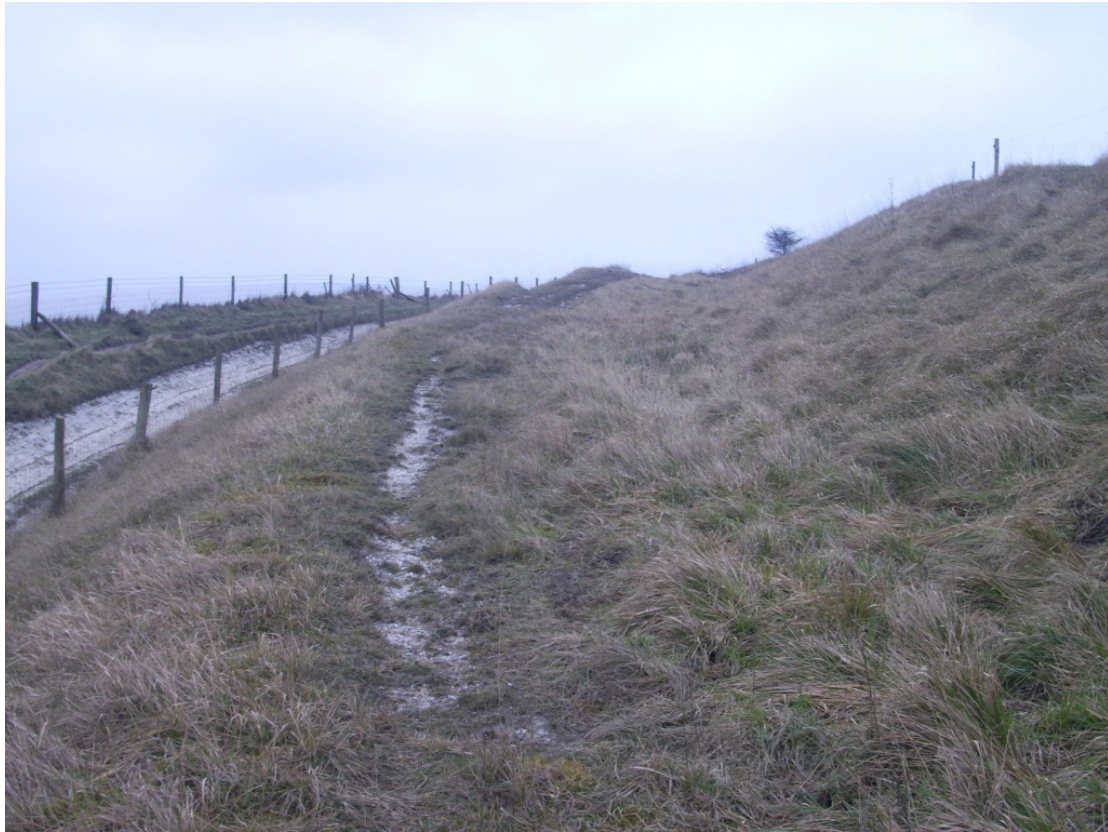
Plate 5. RSK IDs 7 & 34. Iron Age or Roman trackway / U-trackway. Also Parish Boundary (Adur District – Upper Beeding CP) RDX05/03-04. Looking South East.