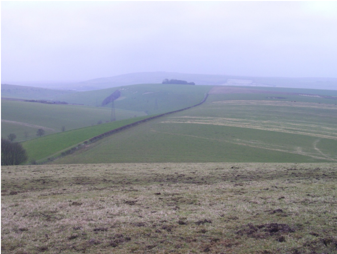
Plate 6. Overlooking RSK IDs 17 & 40. Iron Age or Roman settlement/field system visible on aerial photographs. RDX05/06. Looking East.