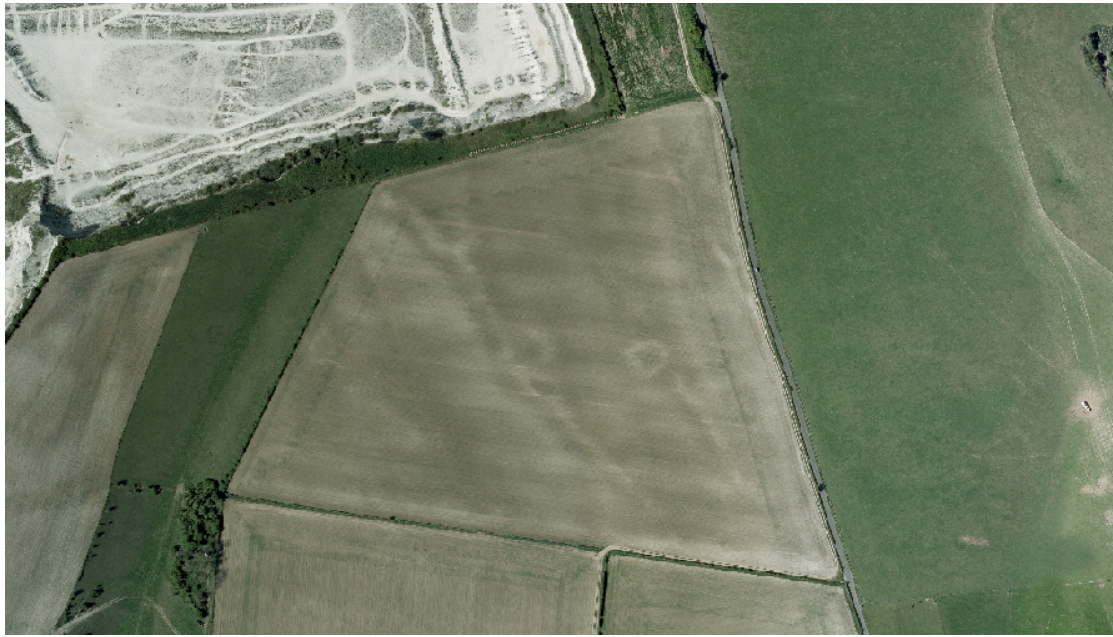
Plate 8. RDX07/03. Aerial View. RSK ID 84. Possible ditches or geological marks. RSK ID 85. Two possible Bronze Age round barrows. RSK ID 199. Possible Bronze Age round barrow.