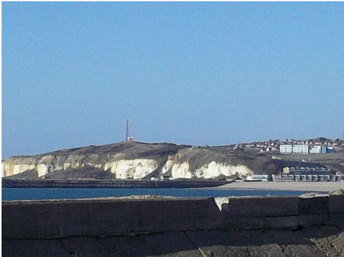
Plate 19. RSK ID V26. Landscape position of SM Newhaven military fort and lunette battery.