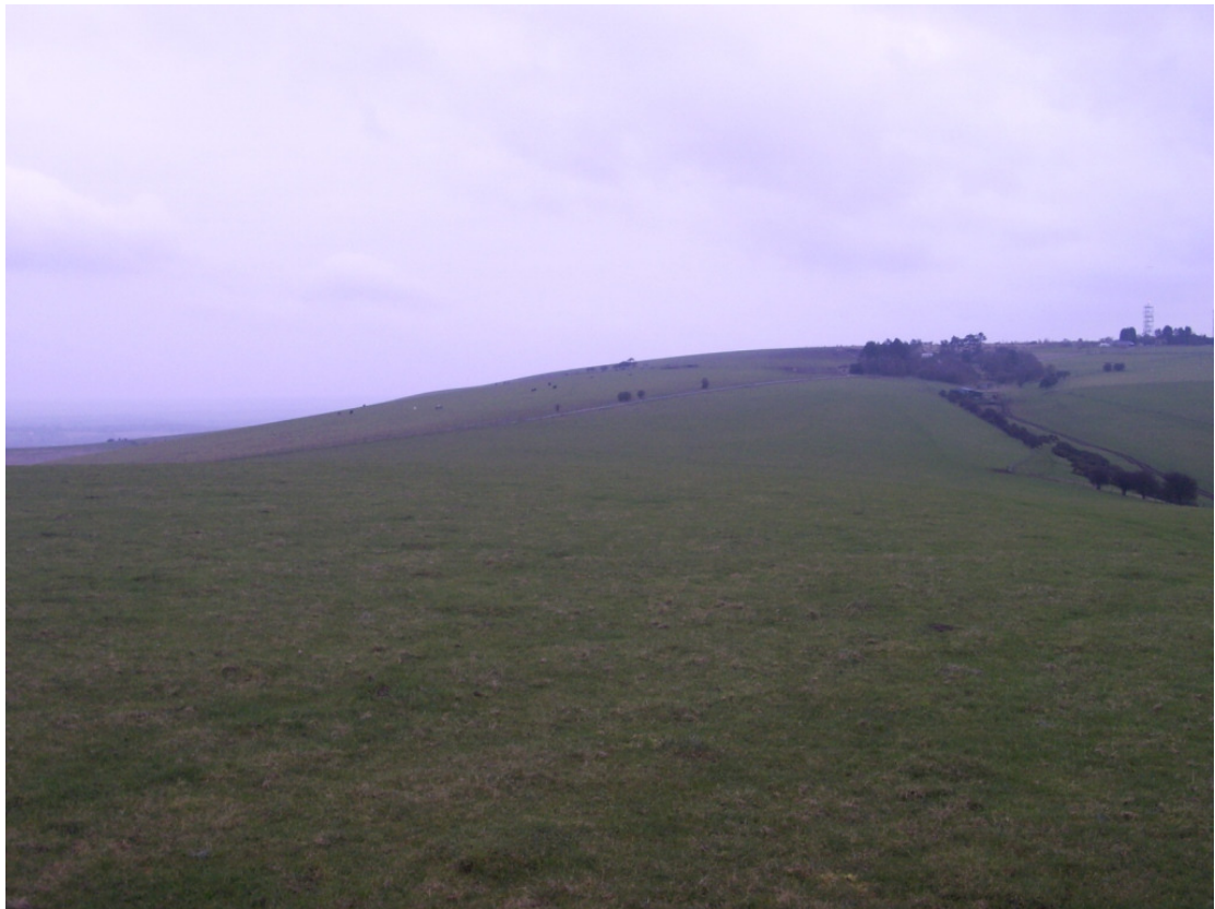
Plate 10. Mill Hill 'barrow cemetery' – no modern surface signature. RDX08/02. Looking North.