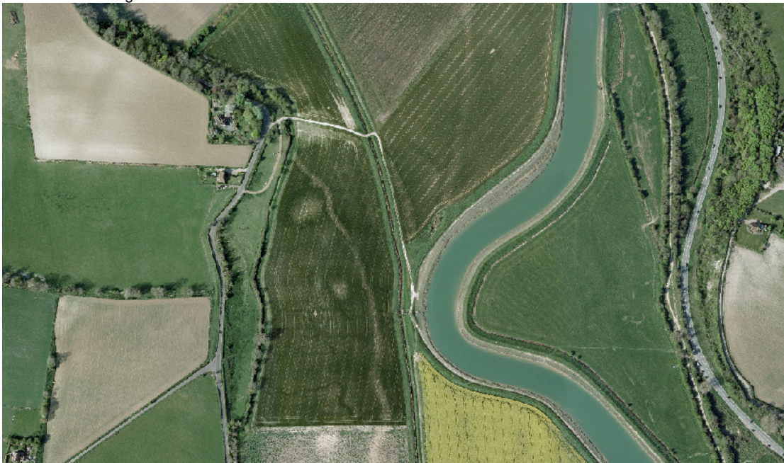
Plate 7. Aerial View. RSK ID 16. Medieval salt mounds. RDX 06/02 RSK ID 1. Adur Navigation / RSK ID 5. Horsham and Shoreham on Sea Branch Railway