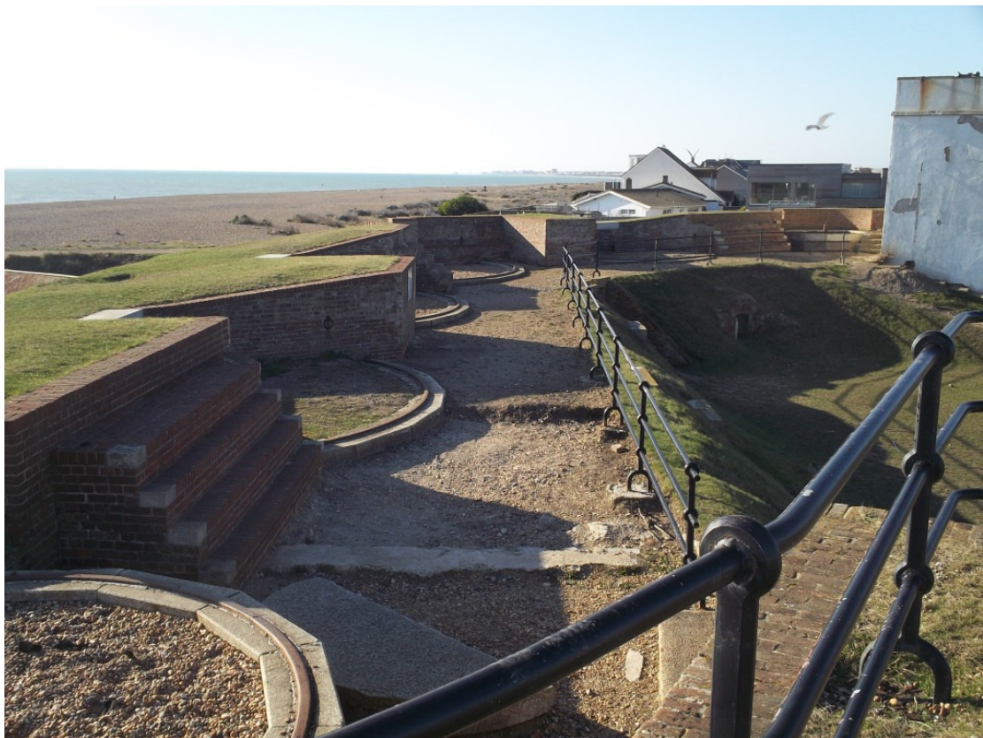
Plate 21. RSK ID V87. SM Shoreham Fort.