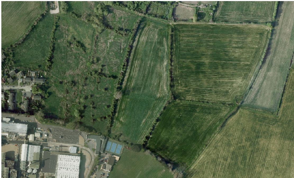
Plate 1. RSK IDs 42 & 66. Earthwork ditches and enclosures / trackway. RDX01/12-16. Aerial view.