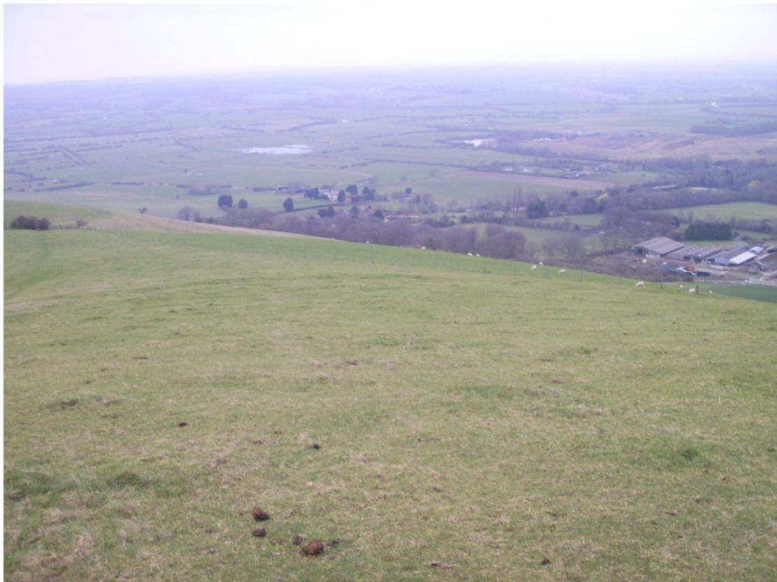
Plate 12. Scheduled Monument RSK ID 99. Late Bronze Age Cross Dyke. RDX09/03. Looking North West.