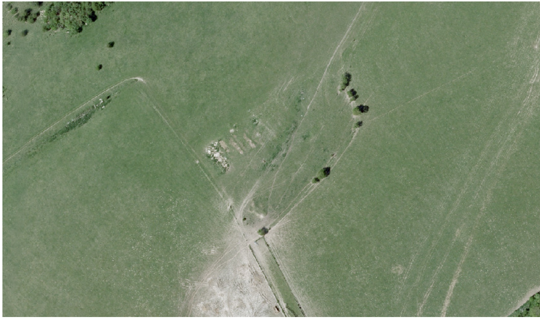
Plate 11. RSK ID 193. (Possible WWII?) Earthworks. RDX09/02. Aerial View.