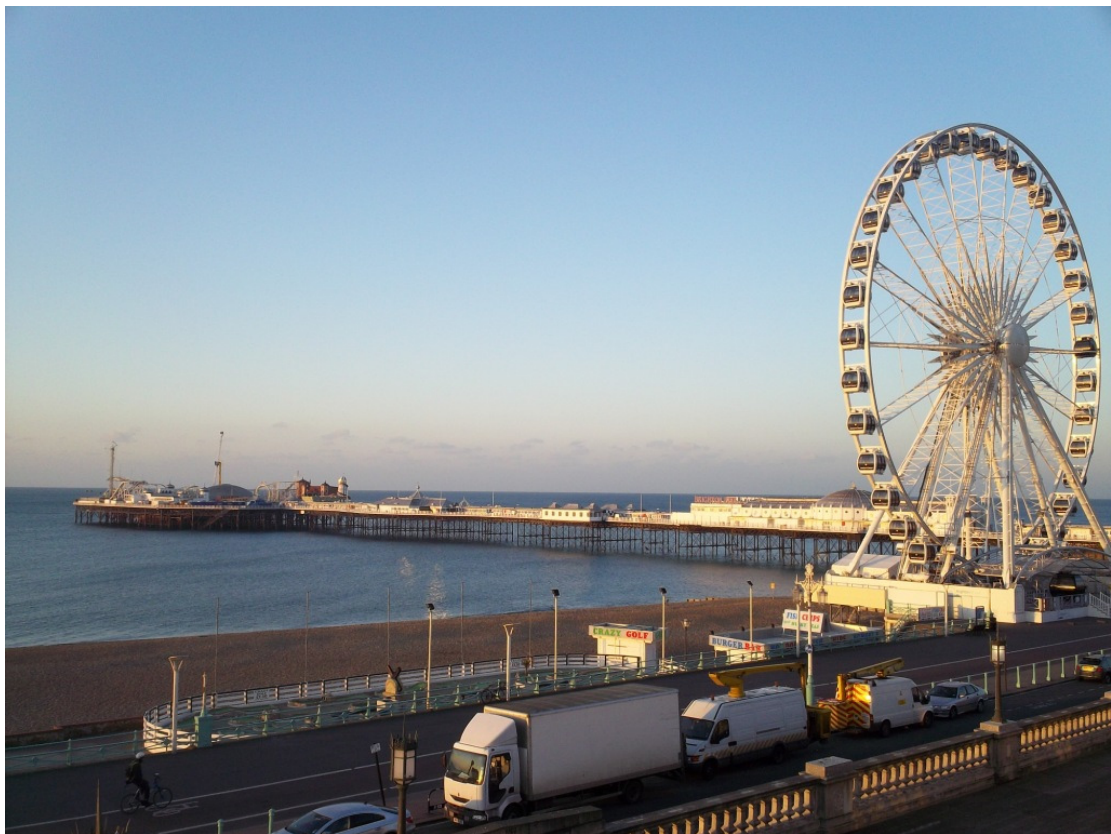
Plate 25. RSK ID V606. LB II* The Palace Pier, Brighton.