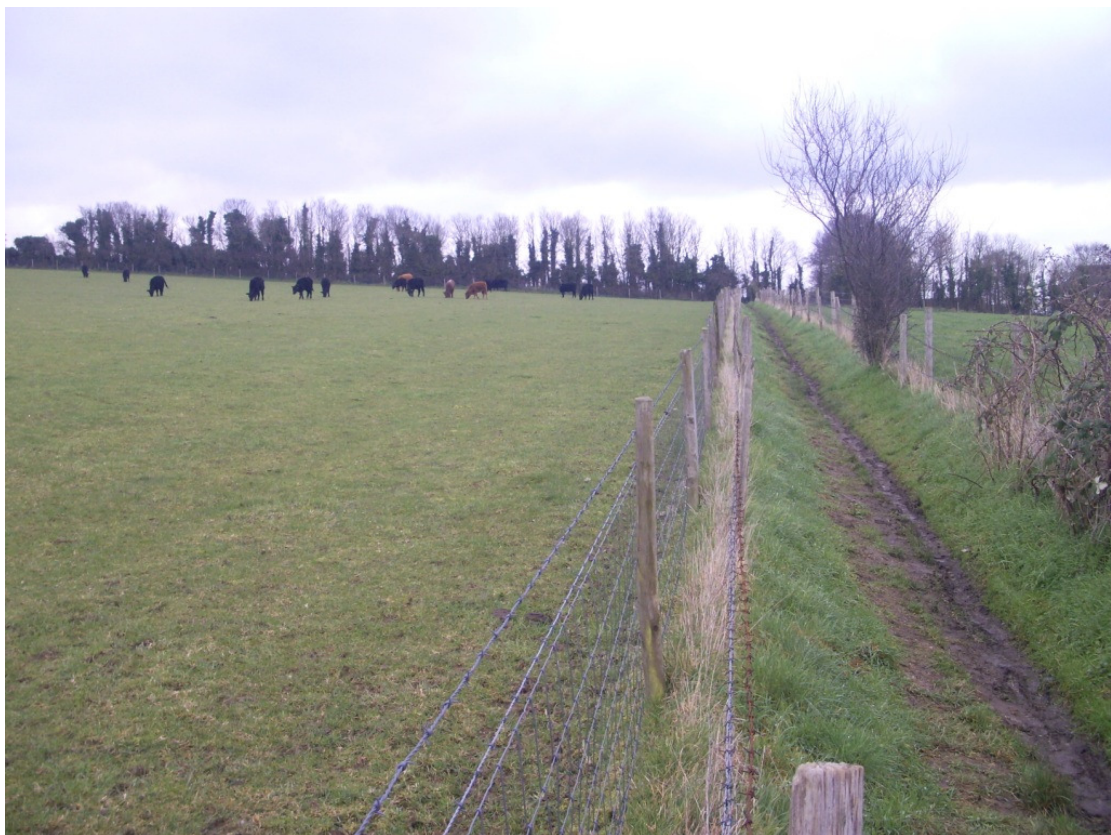
Plate 2. RSK ID 3. Projected line of Roman Road possibly preserved as modern footpath/to left of fenceline. RDX03/02. Looking East.