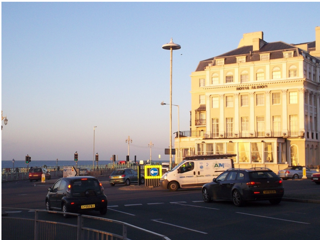
Plate 23. RSK ID V357. LBII* Royal Albion Hotel.