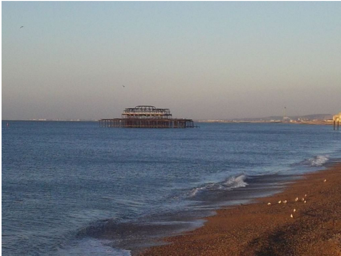
Plate 24. RSK ID V601. LB I The West Pier, Brighton.