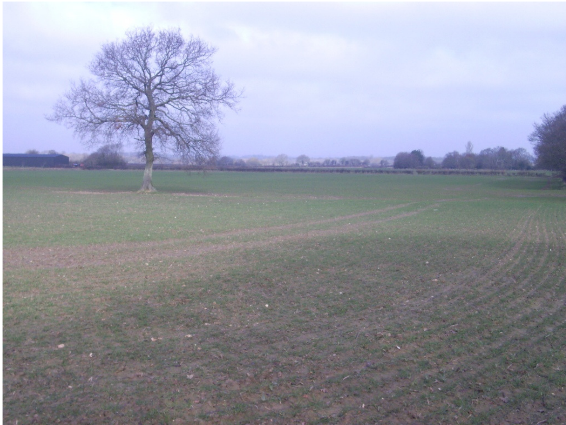
Plate 15. Example of inland Low Weald plot – relative high point with archaeological potential. RDX12/07. Looking North.