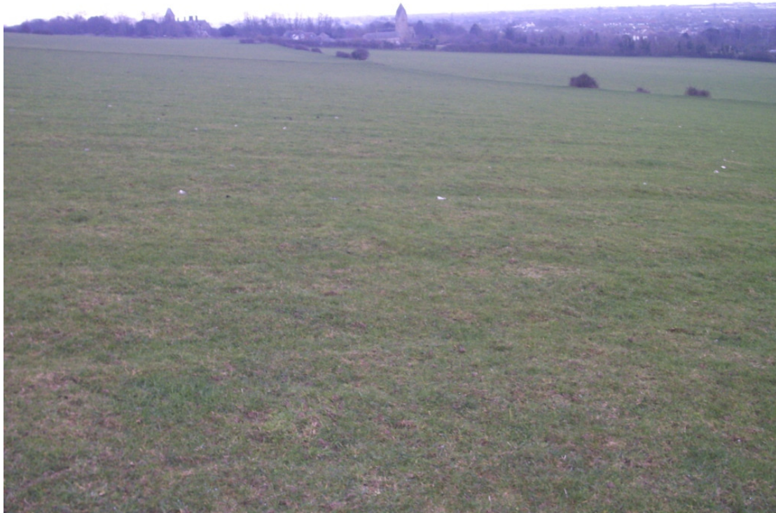
Plate 3. RSK ID 196. Ridge and furrow earthworks. RDX04/02. Looking South East.