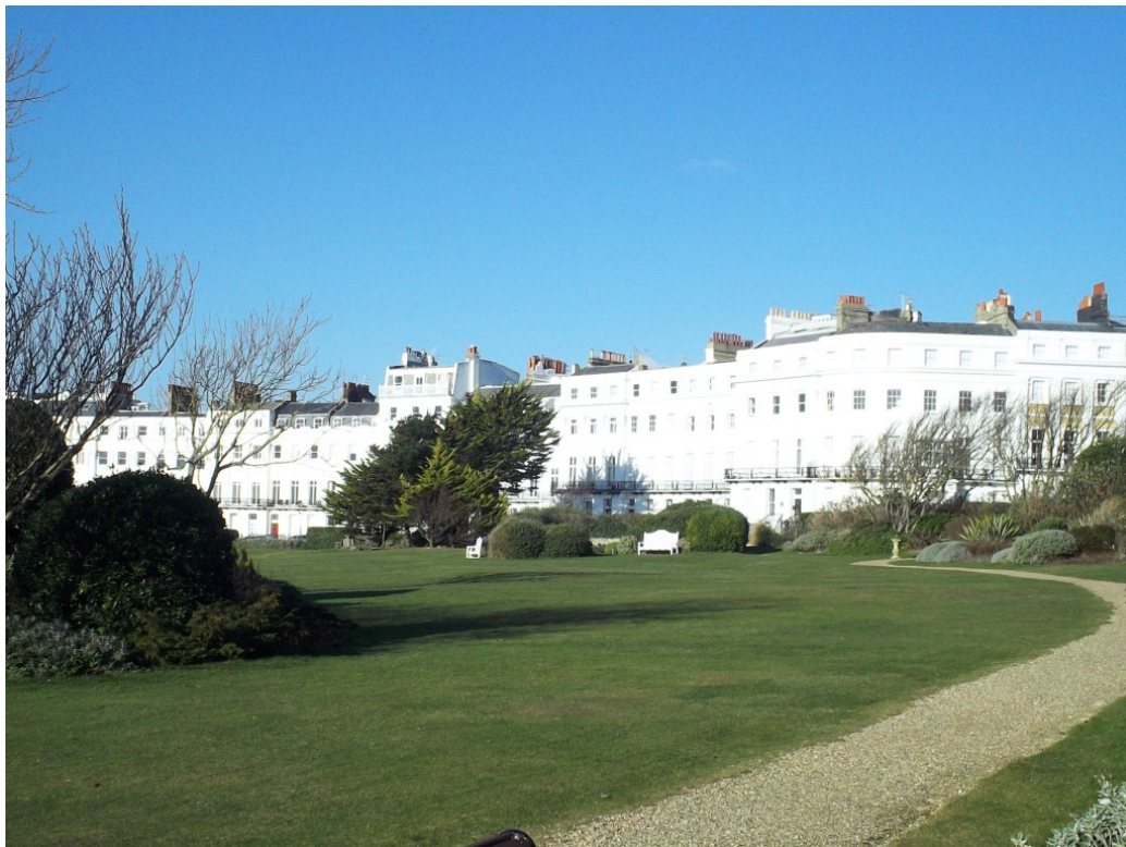
Plate 17. RSK ID V14. RPG Kemp Town Enclosures