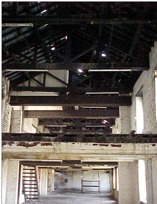
The interior of the Whitelands Works showing the trusses and floor beams typical of a mid-19 th century urban warehouse construction.

The final report on the archaeological building survey of Whitelands Leather Works, Whitelands, Dukinfield, (centred SJ 9420 9869), has now been produced. The site which was surveyed in 2002-3, was situated to the east of Whitelands road and to the south of the disused Huddersfield Canal. Whitelands works consisted of a four story building with adjoining single story sheds to the east. It appears to have begun life as a purpose-built leatherworks. Although the buildings were noted on the 1840s OS map there appeared to have been a significant rebuild dating to 1868. During the late 20 th century the site was reduced in size with residential buildings constructed to the east and south of the works and this may have been the period when the building was converted to a warehouse. The adjoining sheds were partially demolished in the late 20 th century and the works was finally demolished in 2003.