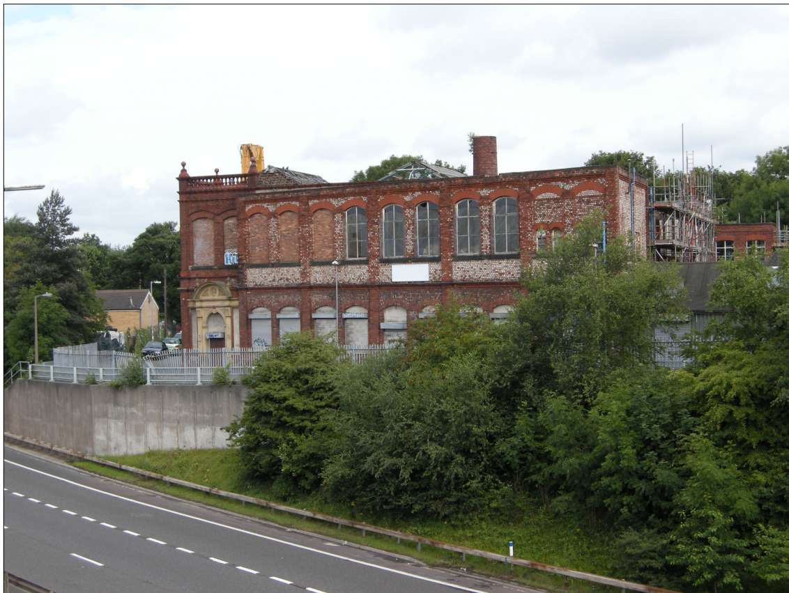
The southern elevation of the Caxton Engineering Works immediately prior to demolition in July 2009.

In July and August 2009 a square, two storey, engineering building to the west of Carrfield Mill in Hyde, was demolished. Although access to the interior of the building was not possible Centre staff were able to record the exterior and some of the partially demolished interior features of the building during demolition. The Caxton Engineering Works was established between 1872 and 1894, but probably in the early 1890s when it first appears on the Ordnance Survey map base, where it was named and lies on the northern side of Mary Street. This was one of the many engineering firms established in Hyde in the mid-19 th century, when the presence of the railway network and the railway junctions around Newton to the north encouraged the development of a light and heavy engineering tradition in this area. In 1896 and in 1902 the works was occupied by Cartwright & Rattray Limited, lithographers and printers ( Kelly's Cheshire Directory 1896, 314; ibid 1902, 356).