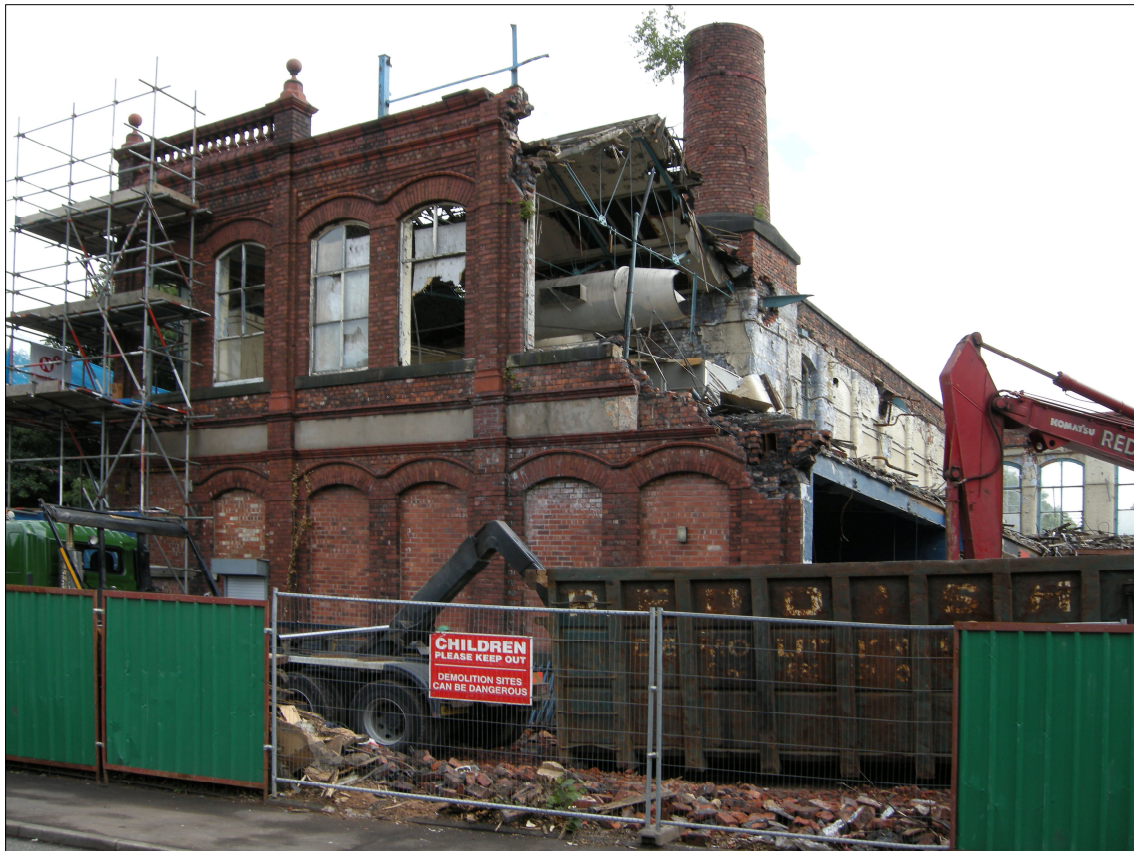
The southern elevation of the Caxton Engineering Works immediately prior to demolition in July 2009.

shop floors occupied the main body of the two storey range to the south and east. This had ten windows on each floor in the southern elevation and 15 to the eastern elevation. This part of the structure was steel and cast-iron framed, a style of construction just coming into mill building, as at the 1884-5 Cavendish Mil in Ashton-under-Lyne. The top floor had a multi-ridged roof supported by wire trusses.